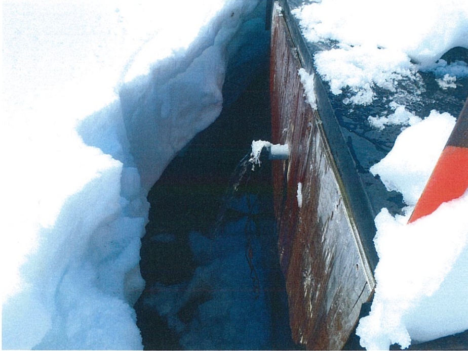
Sample location- downstream of STP-7 at rock filled sump outfall.

ᑲᐅᑦᑭᑲᑲᑦ/P.O. Box 340, ᑲᐅᑦᑭᑲᑲᑦ Rankin Inlet, ᓄᓇᑭᑦ Nunavut X0C 0G0 ᑭᐅᑦᑭᑲᑲᑦ/Tel: (867) 645-2800 ᑭᐅᑦᑭᑲᑲᑦ/Fax: (867) 645-2348 Toll free: 1-800-220-6581