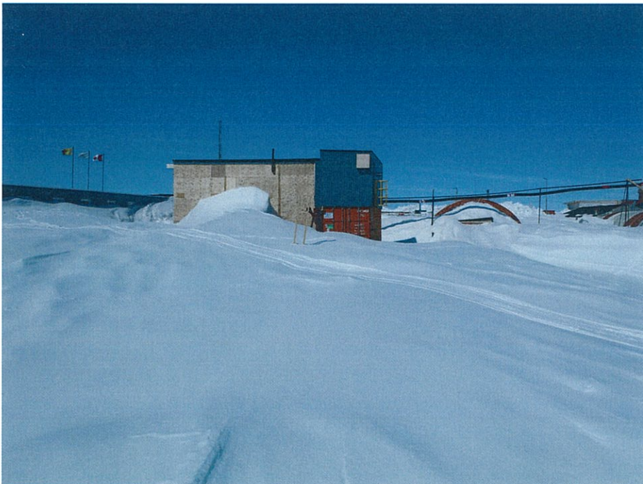
Viewing northwest towards water treatment unit from rock filled sump

ᐃᓄᐃᑦ- CHESTERFIELD INLET/ᑲᐅᑦᑭᑲᑲᑦ-BAKER LAKE/ᑲᐅᑦᑭᑲᑲᑦ-RANKIN INLET/ ᑲᐅᑦᑭᑲᑲᑦ-WHALE COVE/ᑲᐅᑦᑭᑲᑲᑦ-CORAL HARBOUR/ᓄᓇᑭᑦ-REPULSE BAY/ᐃᓄᐃᑦ-ARVIAT