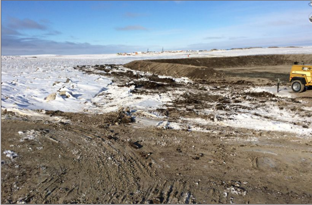
Photo 5: Exploration Landfill Cell (Stage 1) - View from Southwest