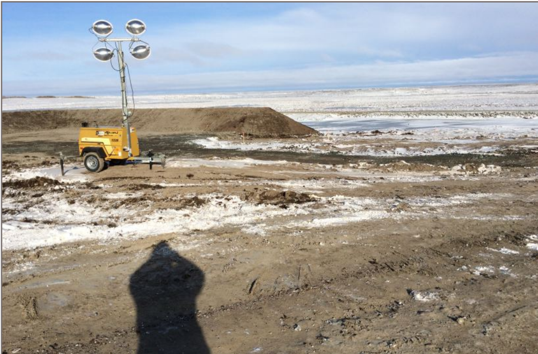
Photo 4: Exploration Landfill Cell (Stage 1) - View from Southwest