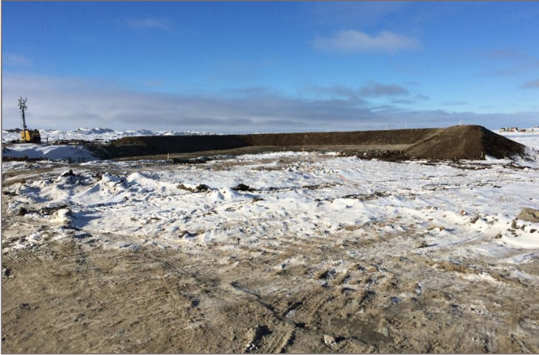
Photo 3: Exploration Landfill Cell (Stage 1) - View from Southeast