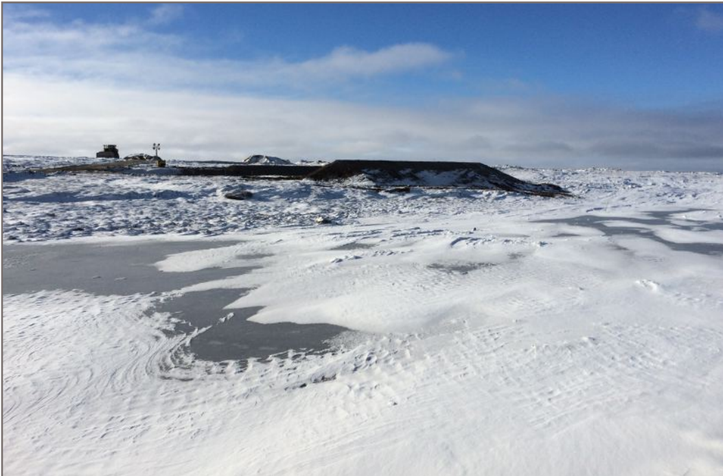
Photo 6: Exploration Landfill Cell (Stage 1) - View from Northeast