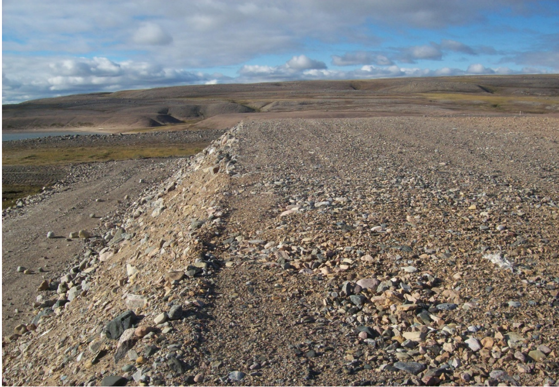
Top of cover as seen from edge of cover and retention berm.