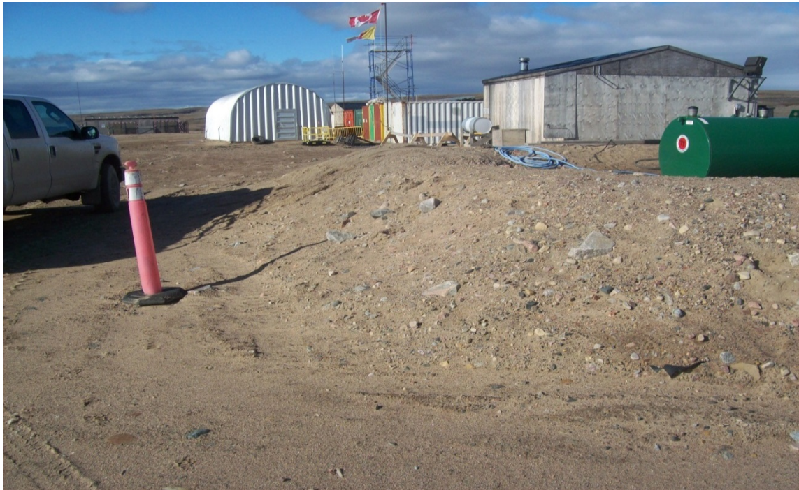
Waste Oil Storage.