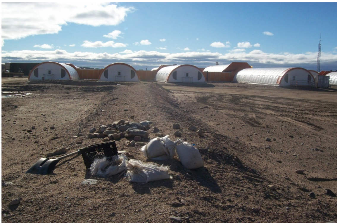
Dyke at Enviro-Tank Storage Containment.