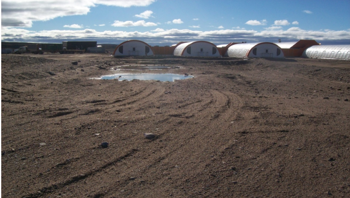
Empty cell at former Enviro Tank Storage.