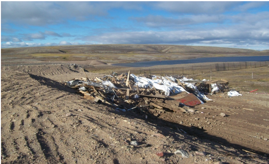
Active face of Solid Waste Disposal Site taken from top of cover showing waste awaiting cover.