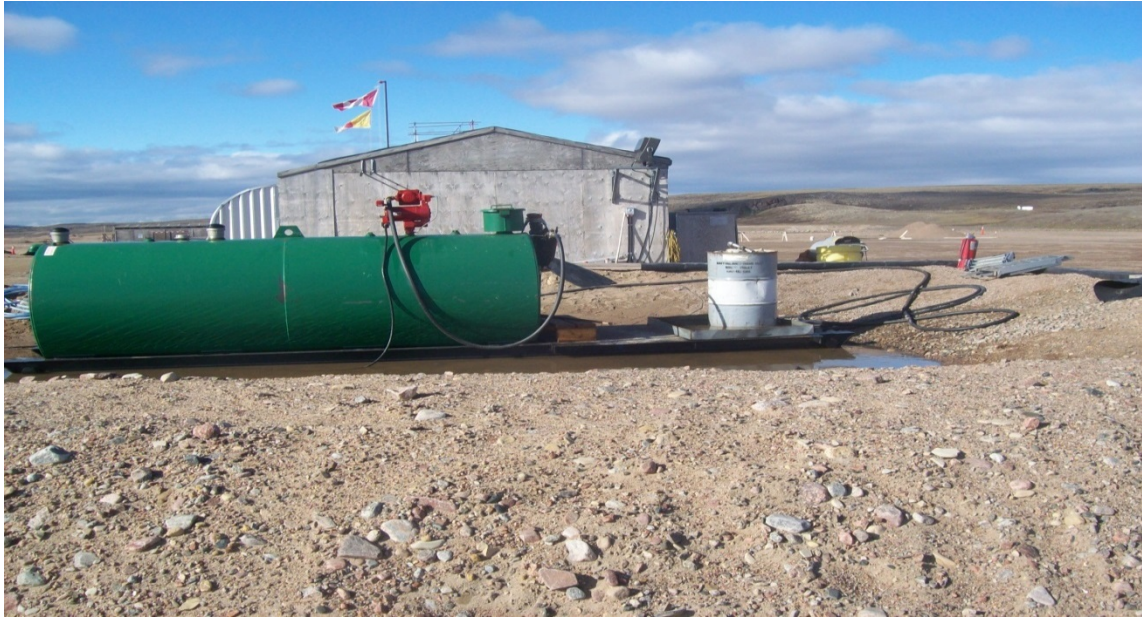
Jet Fuel and Pump Containment.