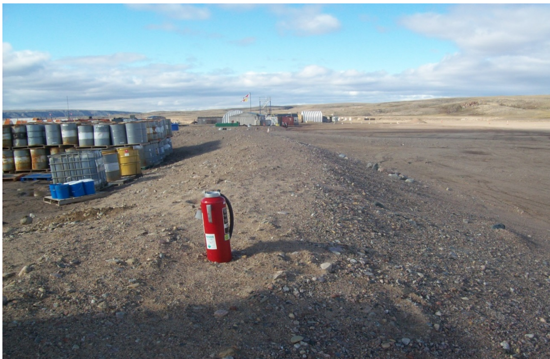
Dyke at Hazardous Waste Containment.