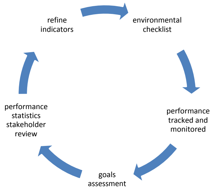
Figure 3-1. Continual Improvement Model

Proactive and reactive key performance indicators will be developed by Sabina to monitor performance against EMS objectives and to promote continual improvement. The key performance indicators will be tracked and monitored by using environmental checklists. These will be developed for the Project as a whole to confirm that there is alignment and consistency in achieving performance goals. Performance statistics based on the checklists will be compiled and distributed to internal and external stakeholders, as appropriate. Environmental indicators and monitoring programs associated with the aspects or activities of the Project will be refined as the Project develops.