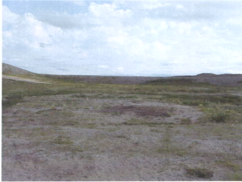
Reclaimed RJ Camp Location – Picture 3 July 2008