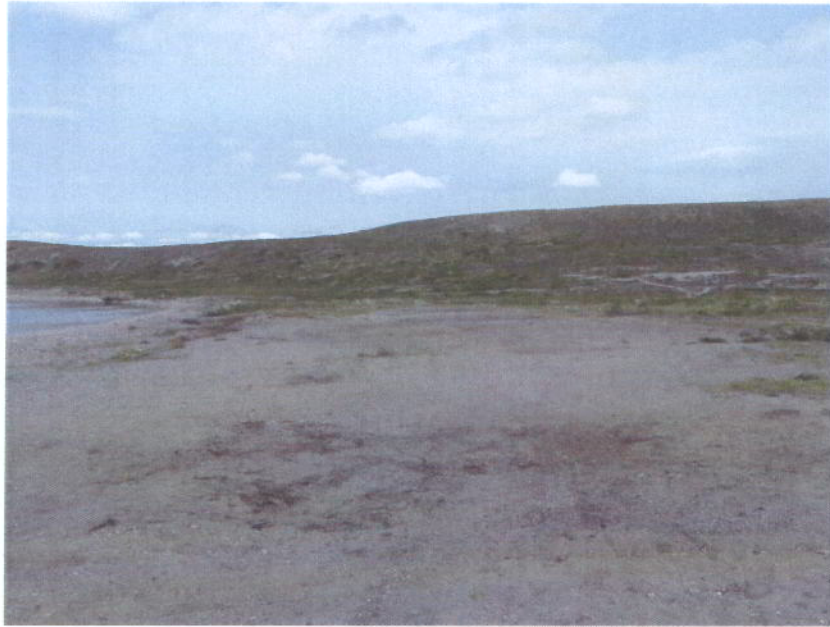
Reclaimed RJ Camp Location – Picture 1 July 2008