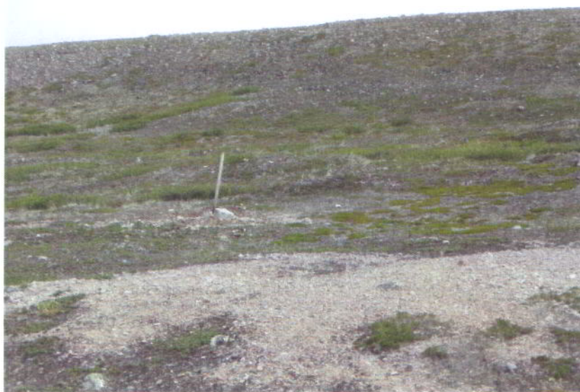
Reclaimed RJ Camp Location – Picture 2 July 2008