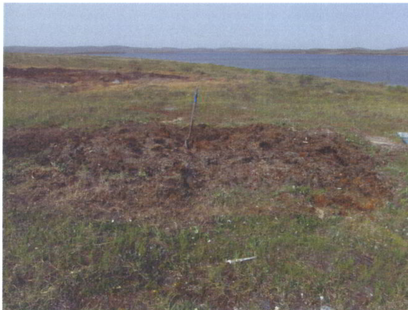
Reclaimed Phantom Camp Location – Picture 2 July 2008