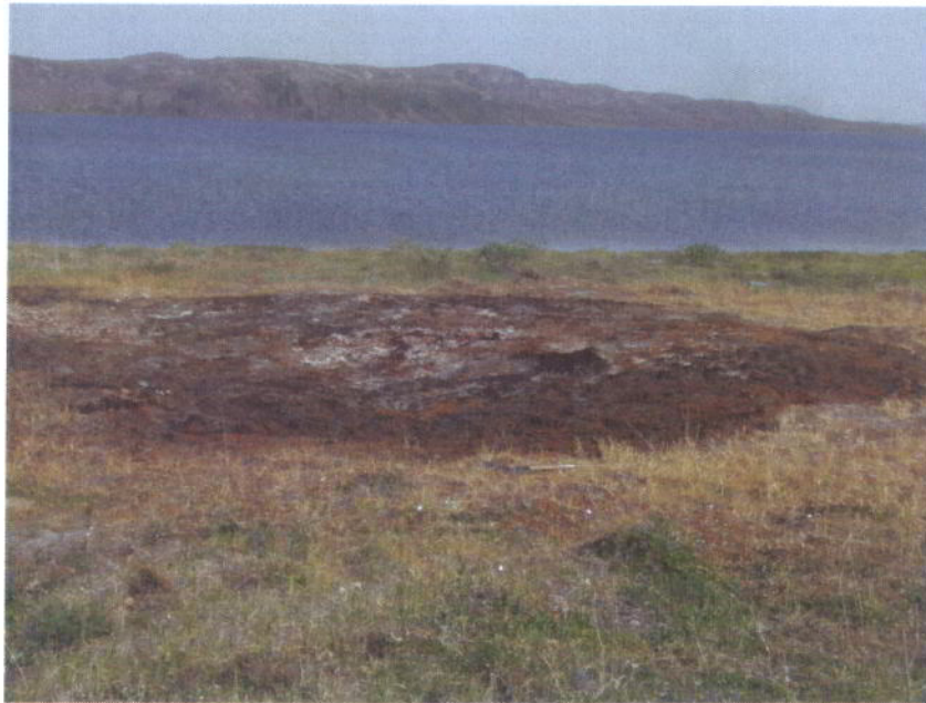
Reclaimed Phantom Camp Location – Picture 1 July 2008