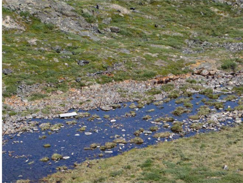
Figure 2. Debris noted in the outlet.

The six points of confusion highlighted in your document dated Nov. 14, 2013 are all verified and correct except for point #3. In point #3 you mention that the camp location given in the 2005 Annual Report and in the 2006 renewal application lists the camp water source as N62° 07' 46" W111° 05' 52"(WGS84). Having gone back and reviewed both documents, the 2006 renewal application lists the camp location not at N62° 07' 46" W111° 05' 52"(WGS84), but instead at N67° 07' 46" W111° 05' 52"(WGS84) – which is the proposed camp location from the 2004 NWB Water License Application.