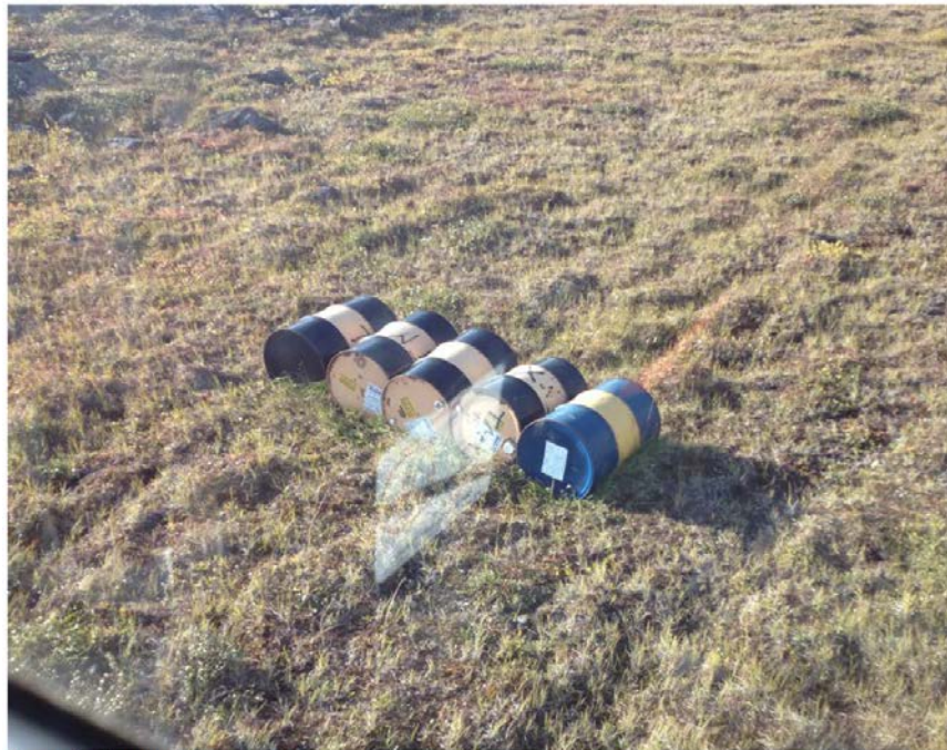
Figure 6. Barrels at Canoe Lake.

Five full fuel drums (fill date 2005) noted in July 2010 report by Melissa Joy and again in July 2013 – “TMX” clearly visible.