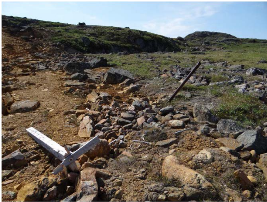
Figure 4. Boards and debris left at fly camp. Drill casing assumed to be pre-existing.

Photos from your inspection earlier this year (below), wood debris and drill-casing are not related to Strongbow's exploration activity at Canoe Lake.