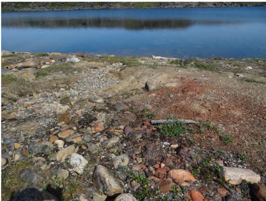
Figure 5. Wire and boards at fly camp location.