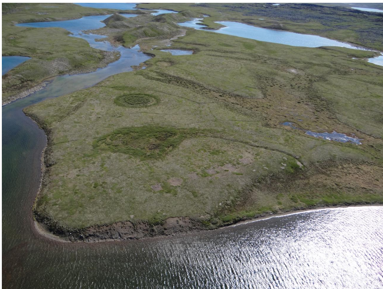
Figure 4. Jubilee Camp, reclaimed.