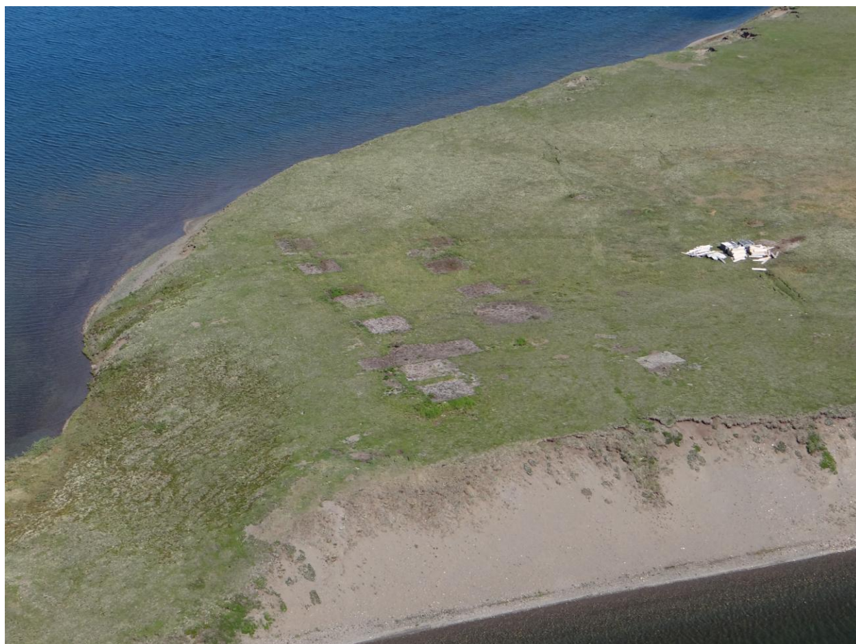
Figure 1. Eureka Camp July 4 2013.