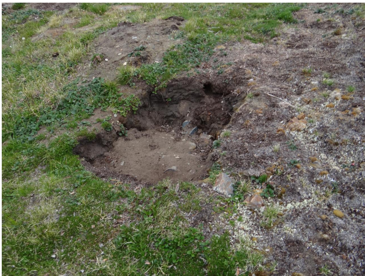
Figure 3. Holes to be backfilled.