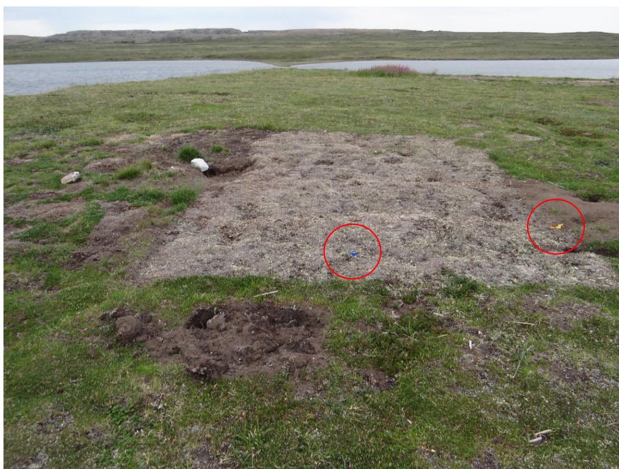
Figure 2. Tent outlines with small garbage visible and holes to be backfilled.