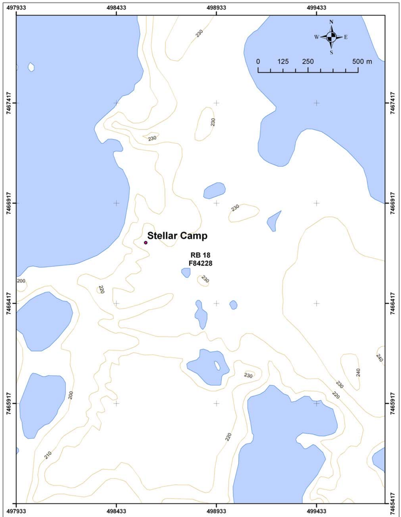
Darby Location Map (NAD83 UTM Zone 15)