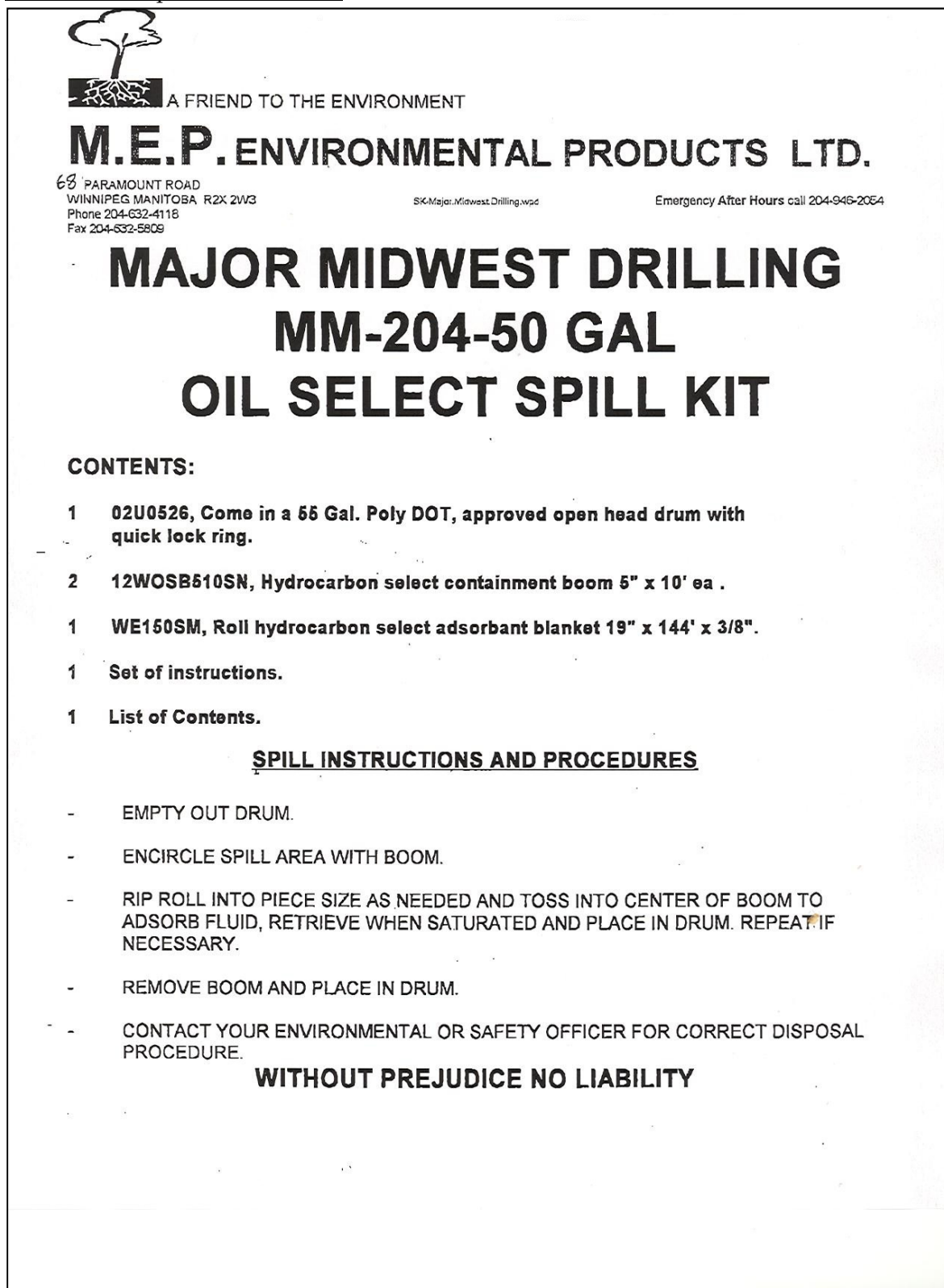
Figure 7-1a. Contents of Spill Kits -2007 Drill Site - Campsite - Ferguson Lake