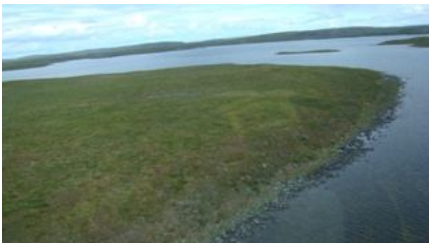
2BE-FRK Site overview 2