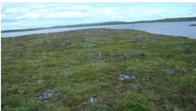
2 BE-FRK Site overview 3