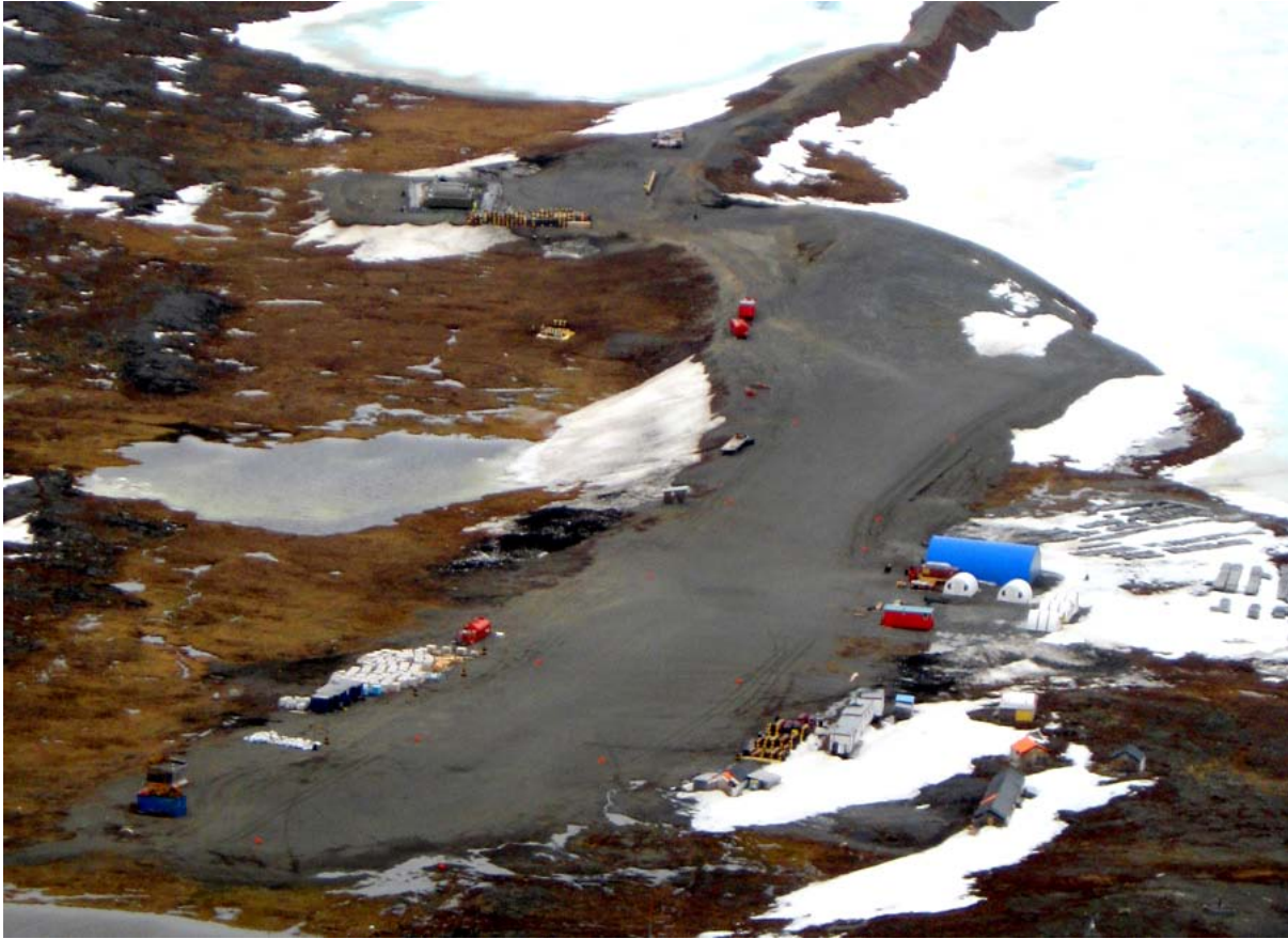
Figure 2. Bird's eye view of George Lake. Photo taken June, 2008. View looking northwest.