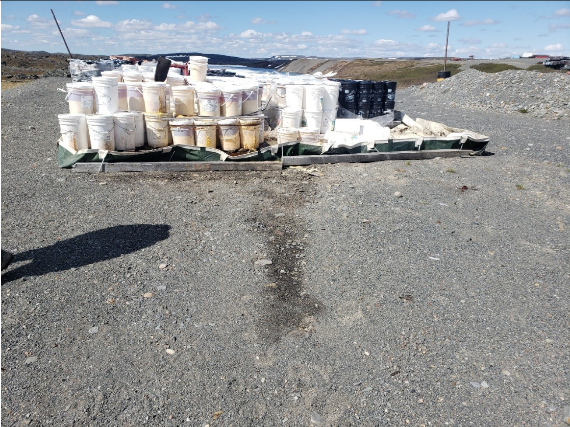
Description: Chemical storage with visible staining down stream.