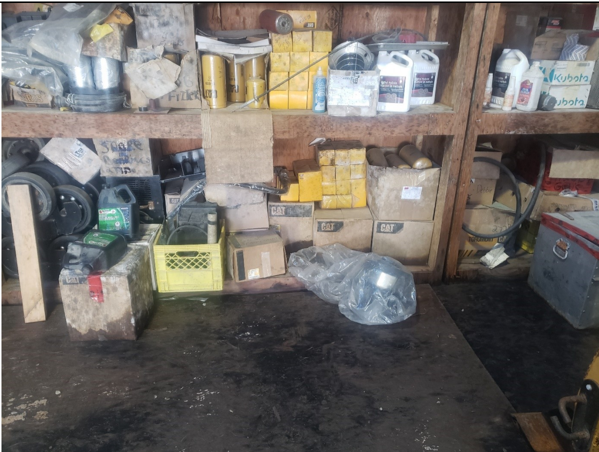
Description: Potential hydrocarbon staining in garage.