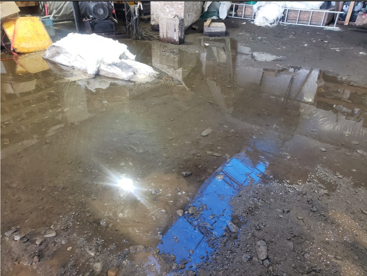
Description: potentially contaminated water.