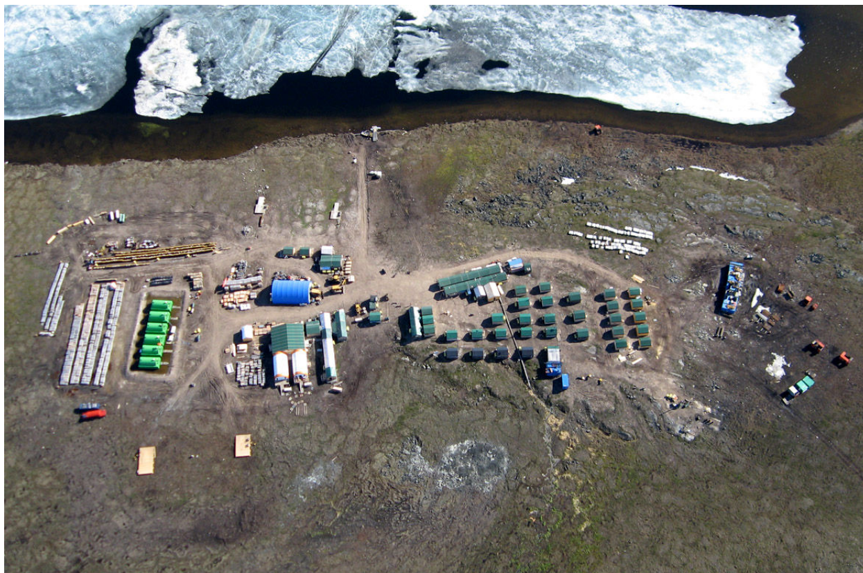
Figure 1. Bird's eye view of Goose Lake. Photo taken June 2007.

The camps are serviced with Pacto toilet systems, with incineration of the resulting waste. Greywater from the kitchen and showers is continuously released into a sump for settling of solid particulate matter and subsequently discharged onto the tundra.