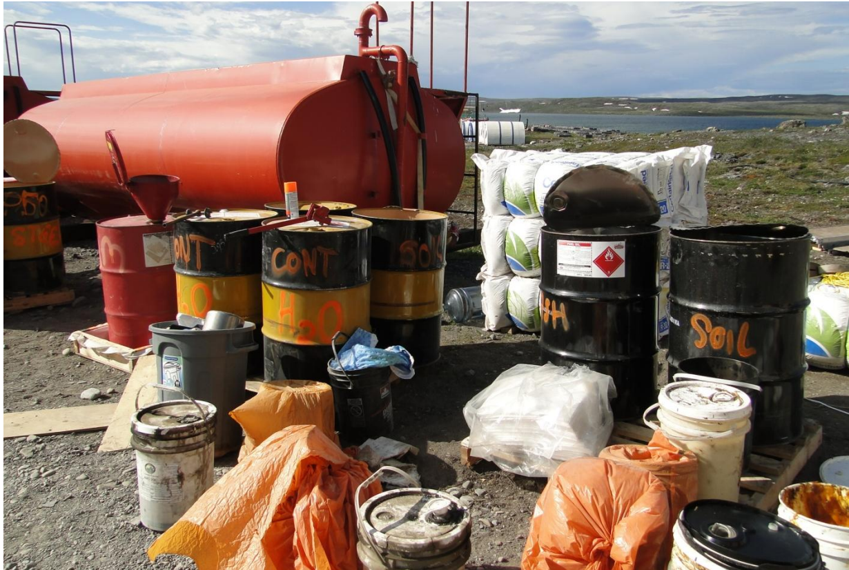
Figure 5. Waste consolidated near incinerator. Barrels marked, but not all are in containment or covered. Pails should be contained/covered as well.