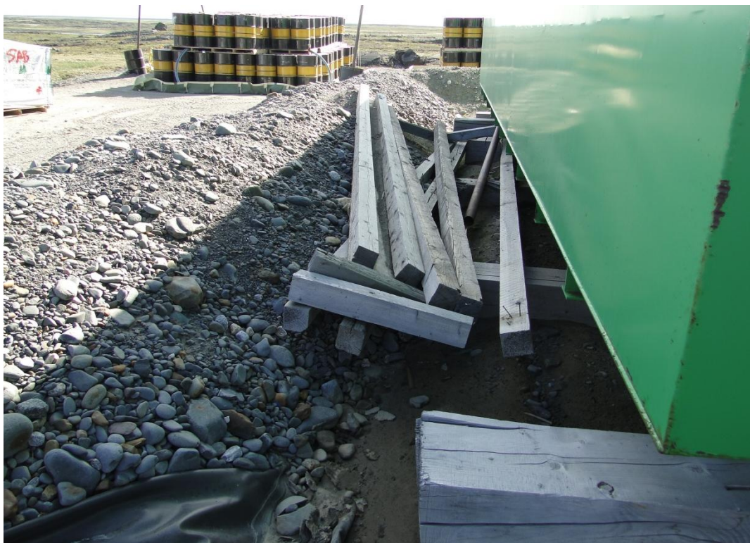
Figure 8. Berm liner exposed and boards with nails piled inside.