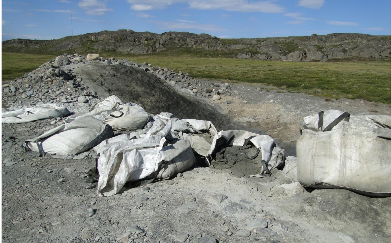
Figure 3. Trench where drill cuttings are being deposited. Reason for dark staining unknown.