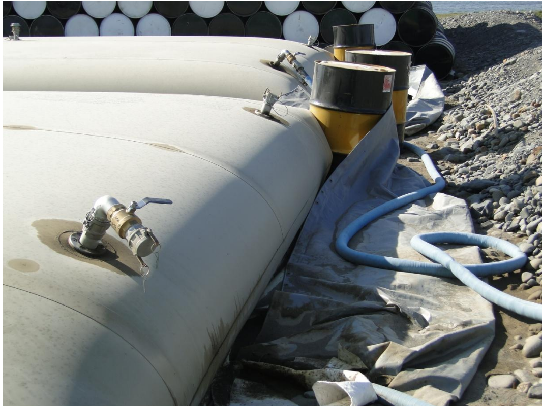
Figure 9. Fuel bladders in use within engineered berm; secondary liner stained.