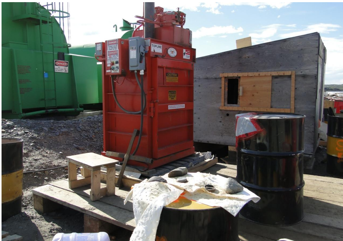
Figure 10. Drum crusher set on absorbent pads and tray; drums not over containment.