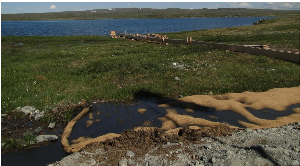
Figure 6. Greywater treatment at time of inspection. Shallow ditch, some matting, and then flowed downhill to lake.