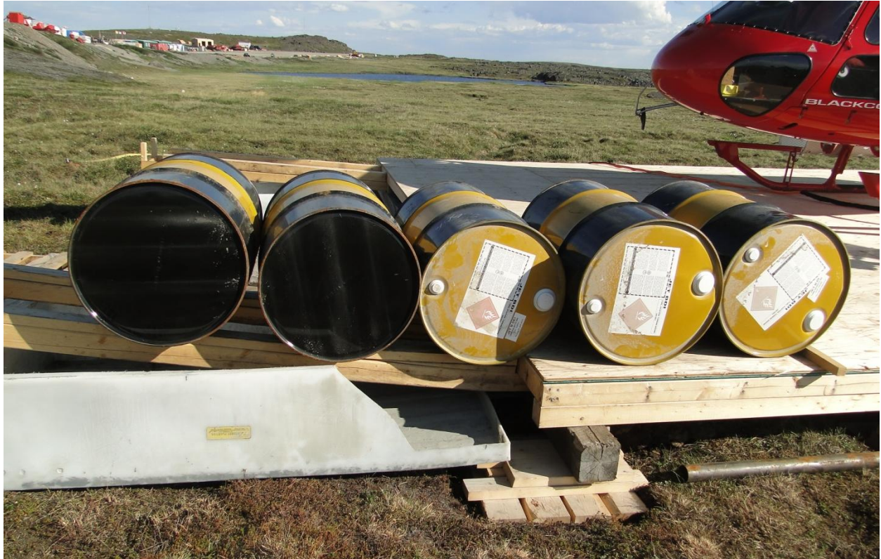
Figure 11. Secondary containment at helicopter area is insufficient.