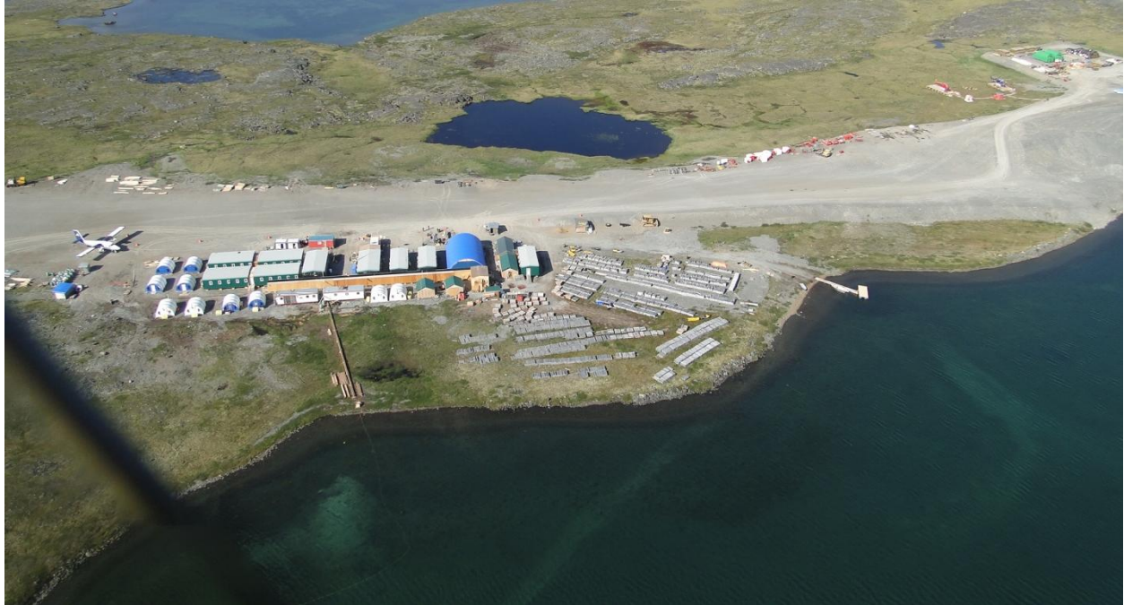
Figure 1. George Lake Camp (overview). Note dark pond near water where greywater pools. Note core stacks near water's edge