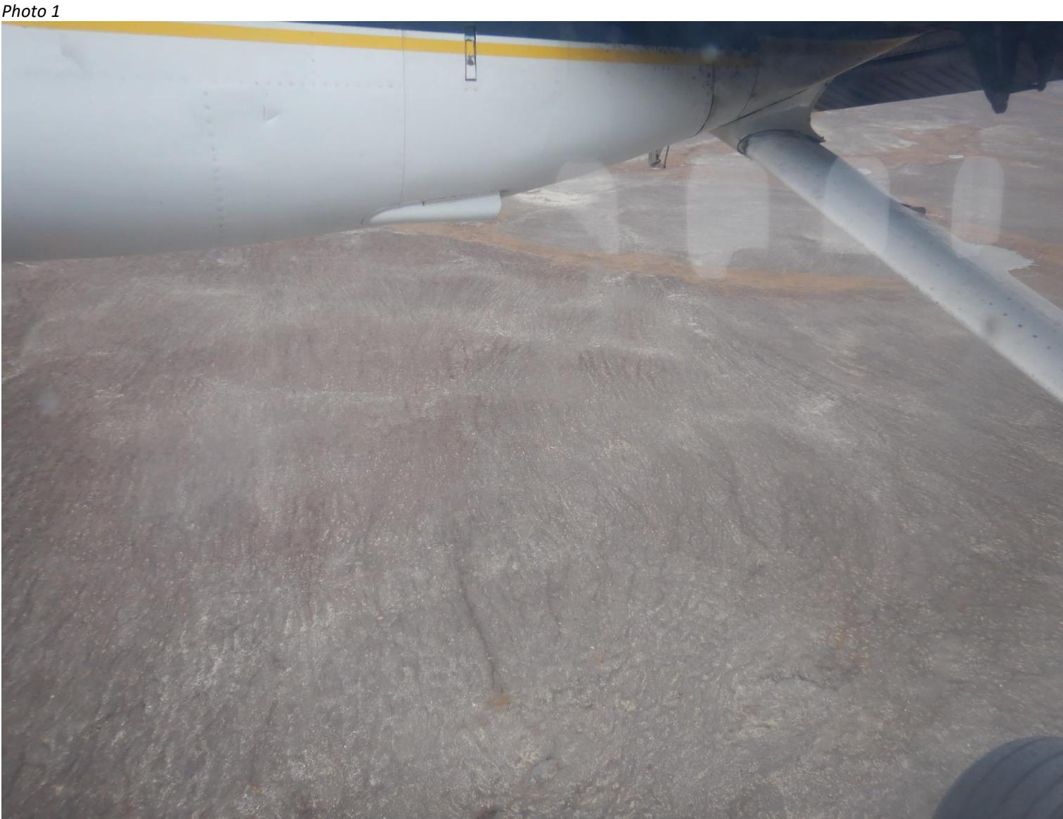
Centroid of Grail Property, no land usage notted.