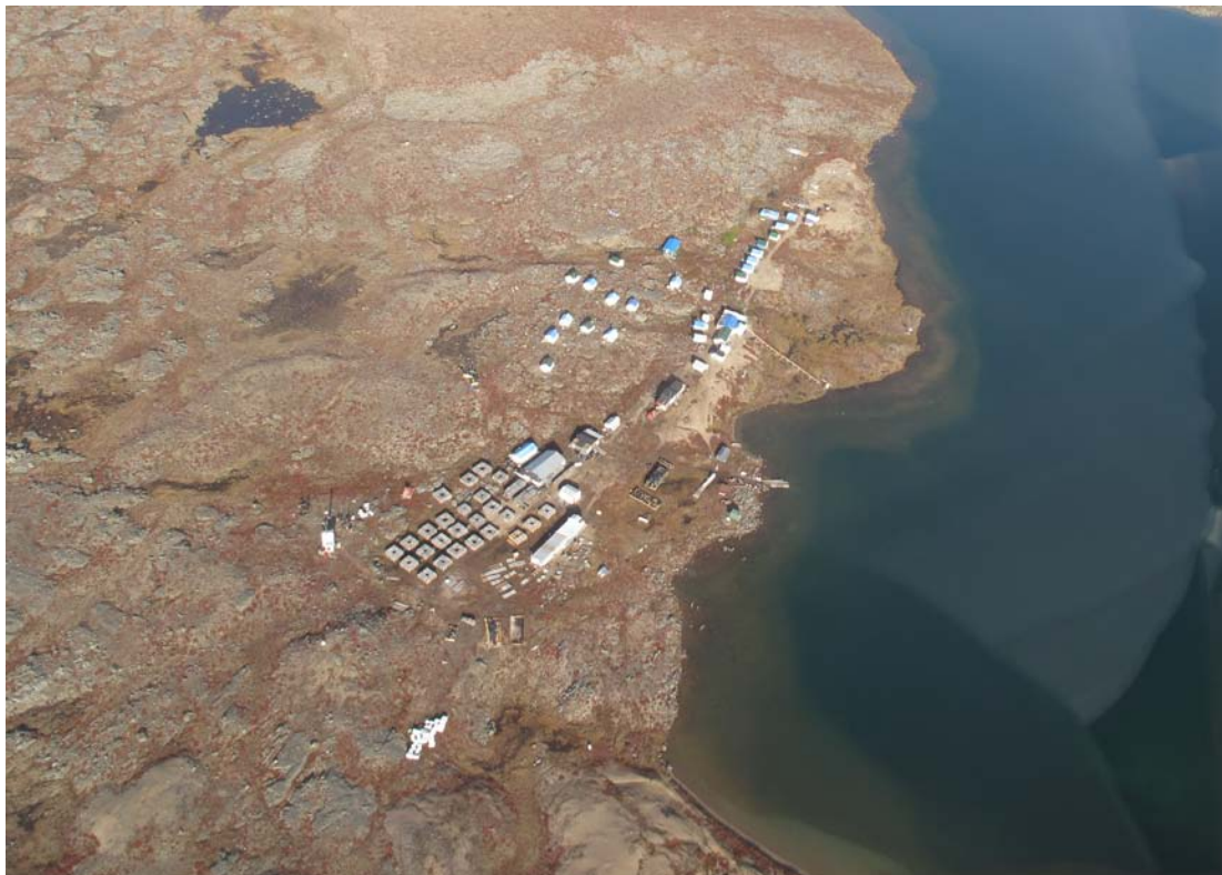
FIGURE 3: Hackett River Camp on September 3, 2009. Picture taken from the south of camp looking to the northwest.