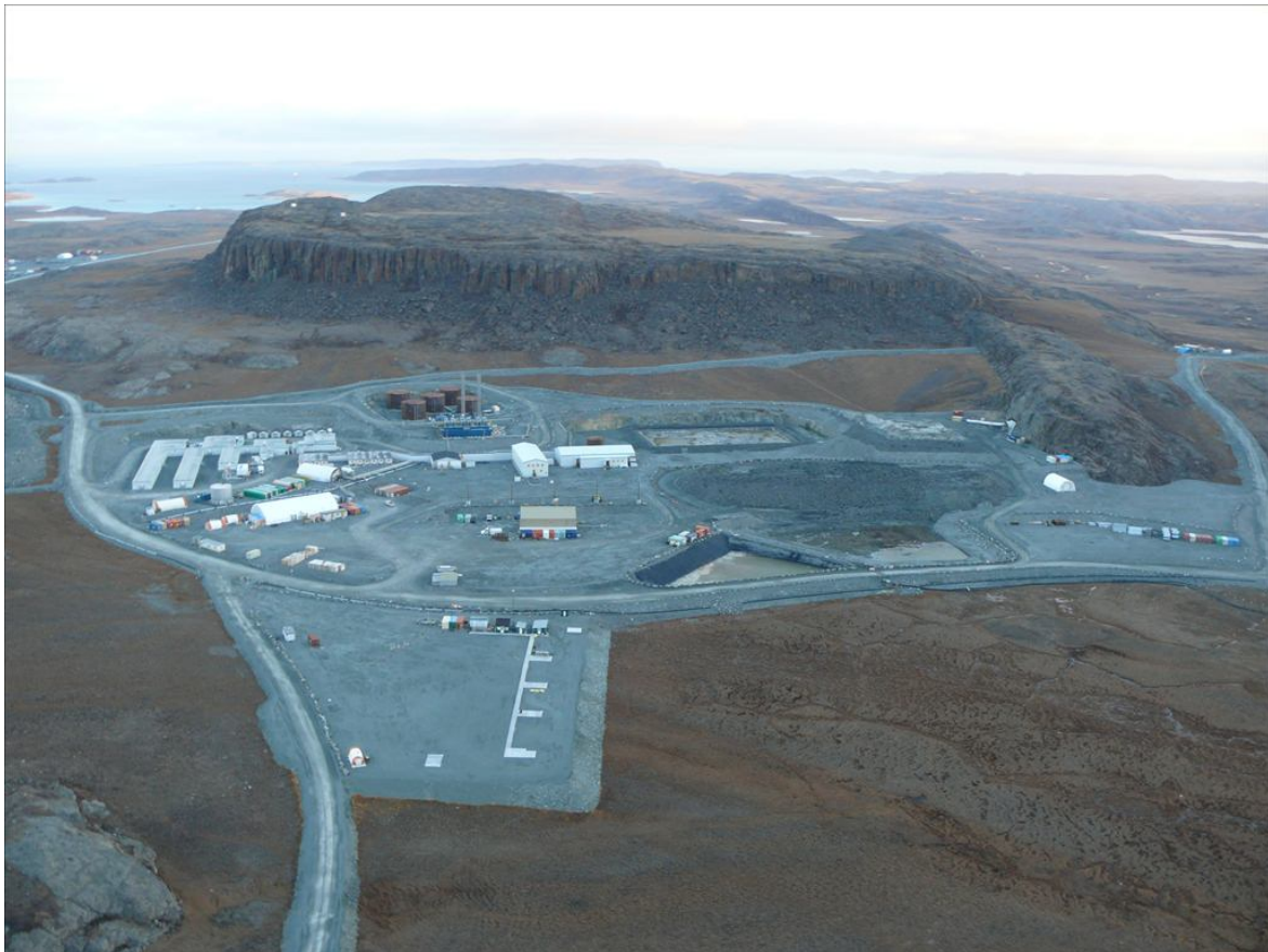
Doris North Camp at the end of September 2012