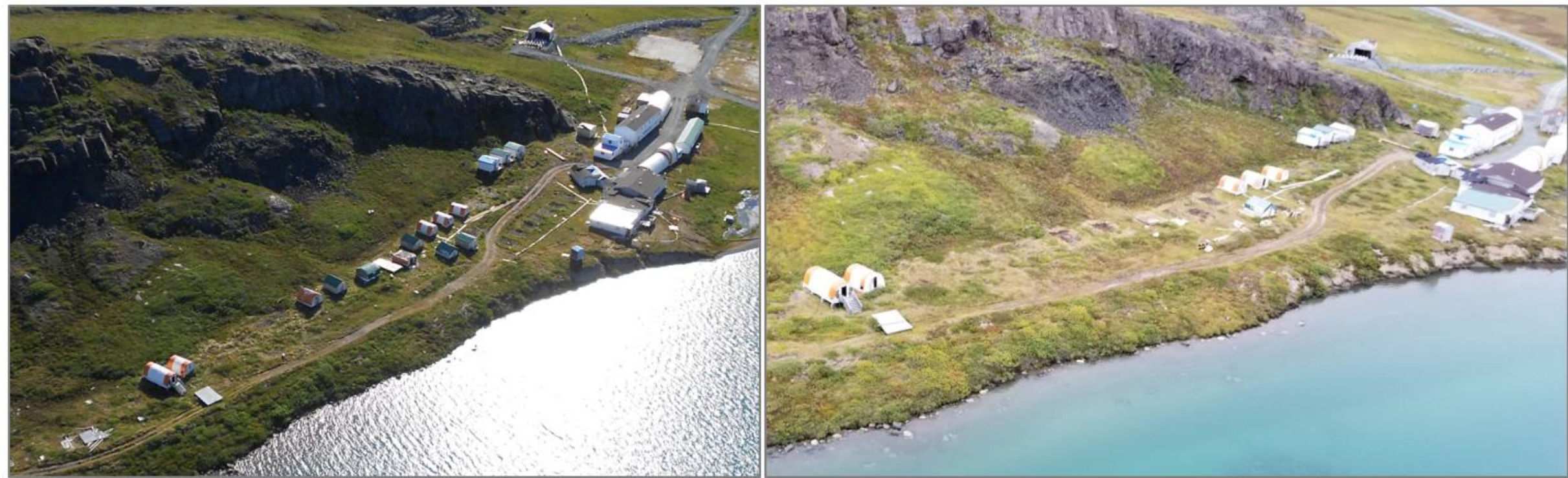
Windy Camp pictured in 2013.