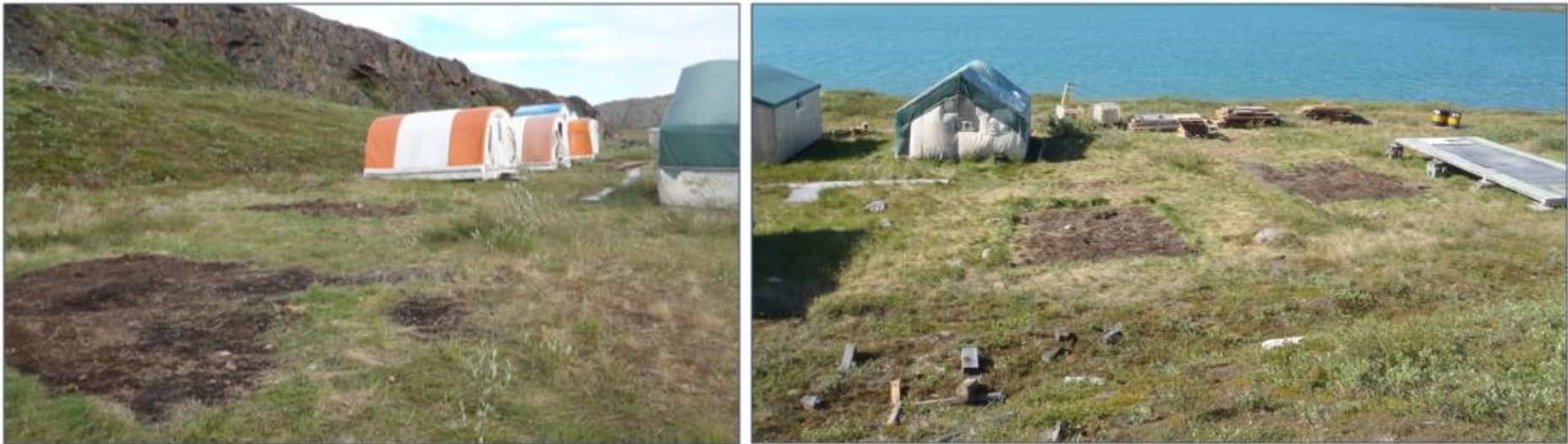
Post reclamation. Waste piled and segregated for transport to Doris Waste Management Facility (right).