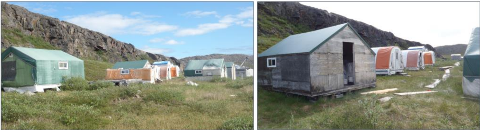
Cabin and tent structures prior to reclamation.