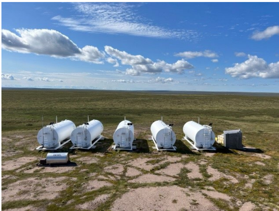
Figure 2 2023 Aerial view of Fuel Cache