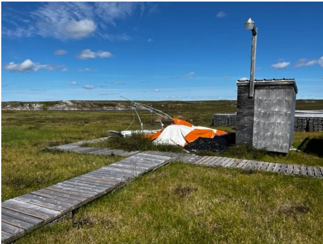
Figure 4 Collapsed geology office