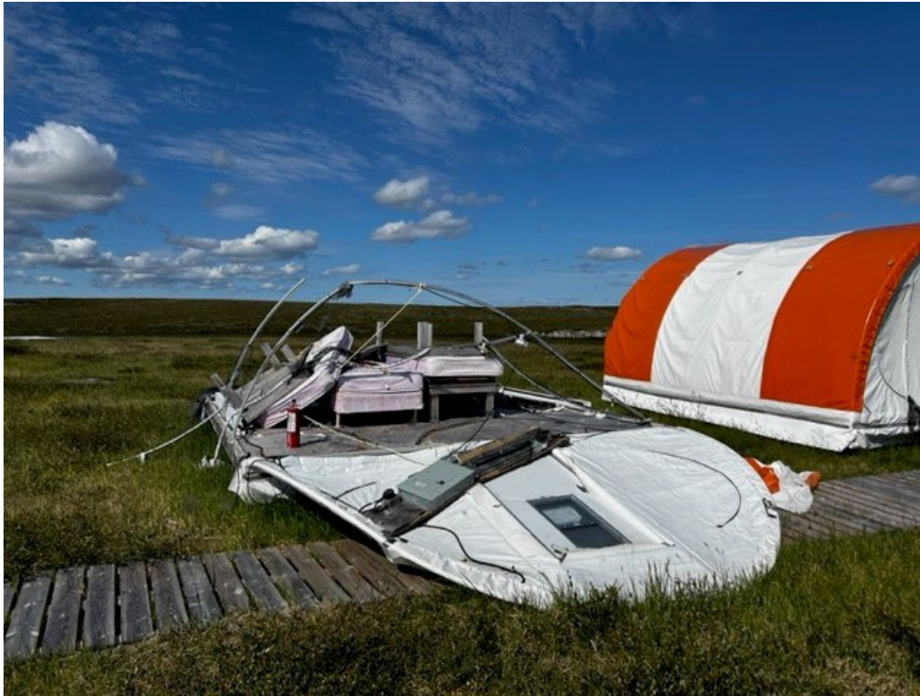
Figure 3 Collapsed sleep tent