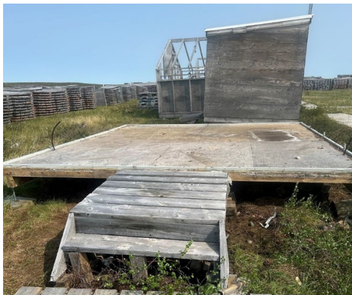
Photo 1-6 Geology office weather haven after dismantling