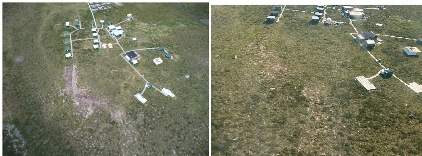
Photo 1-2 Aerial view of drill contractor laydown area (2017 on left/ 2024 on right)