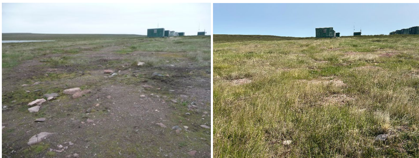
Photo 1-1 Revegetation status of drill contractor laydown area (2019 on left /2024 on right)