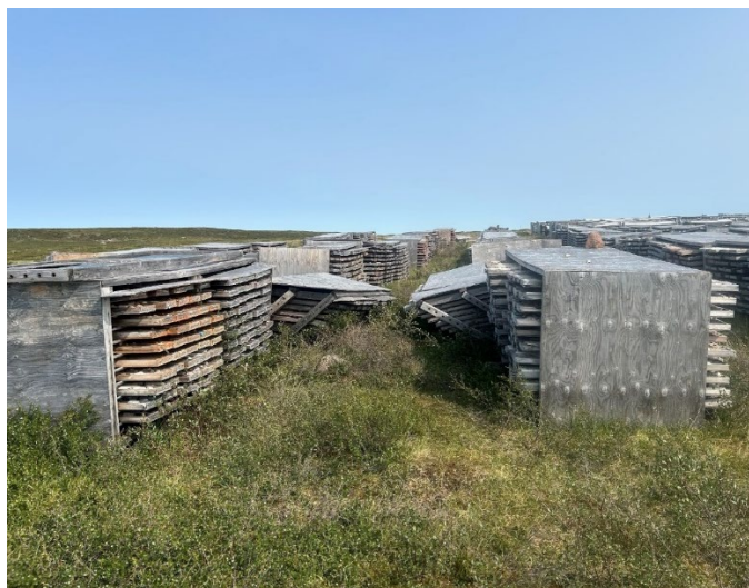
Photo 1-8 Scissored core racks