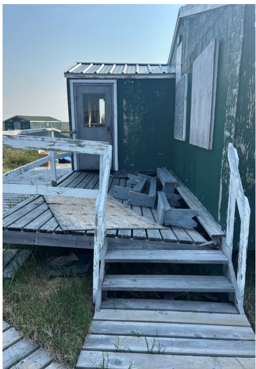
Photo 1-9 Colapsed kitchen porch