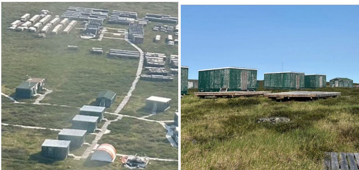
Photo 1-5 Weather Havens. Aerial photo prior to dismantling (left) and dismantled sleeping quarters (right)