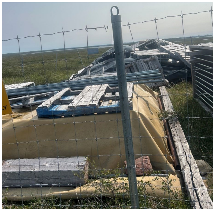
Photo 1-7 Berm in radioactive storage compound containing drums of mineralized cuttings