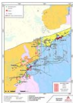
2015 Kiggavik Drill targets.png 305K