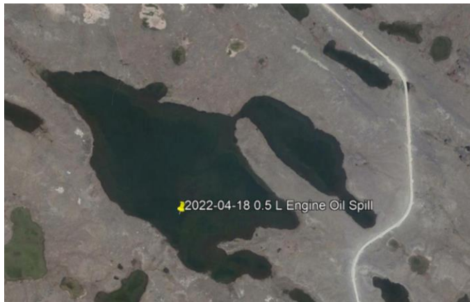
Figure 1: Incident Location

The coordinates of the spill are: 63° 0' 39.3" N, 92°12' 17.1"W, on the water body A8