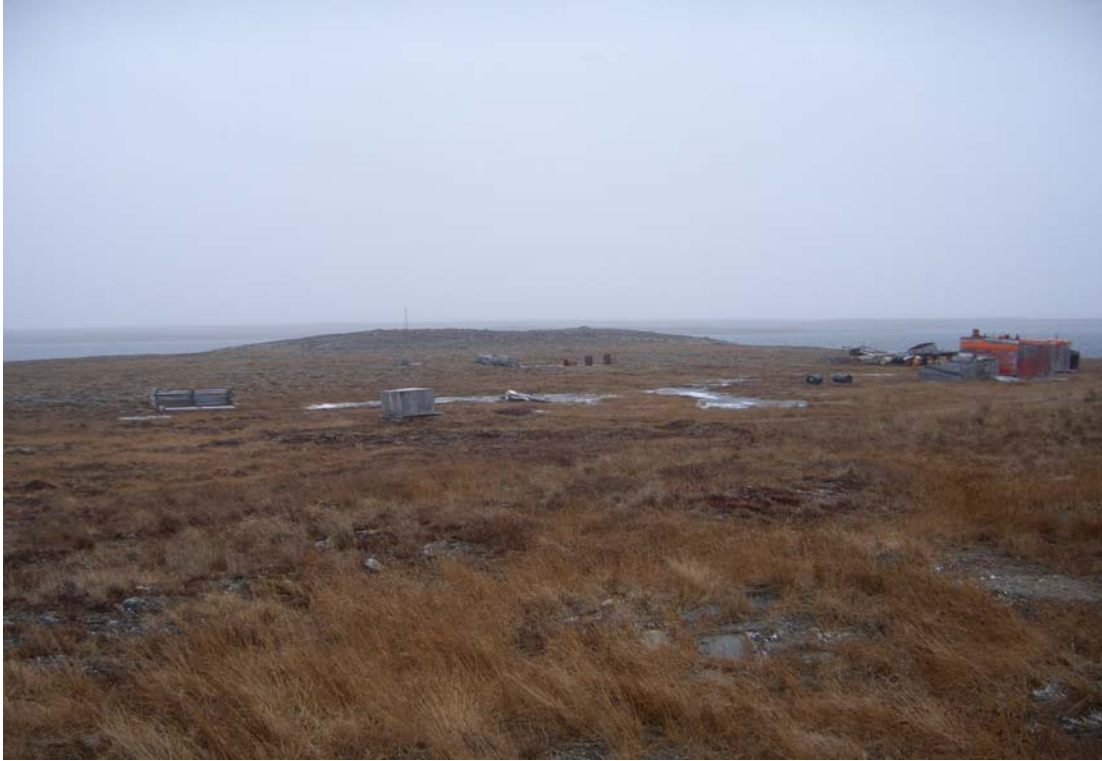
Discovery Camp – 2007 (prior to renewed exploration activities)