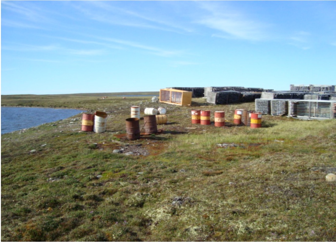
Old Burn Area (Prior to start of 2008 program)