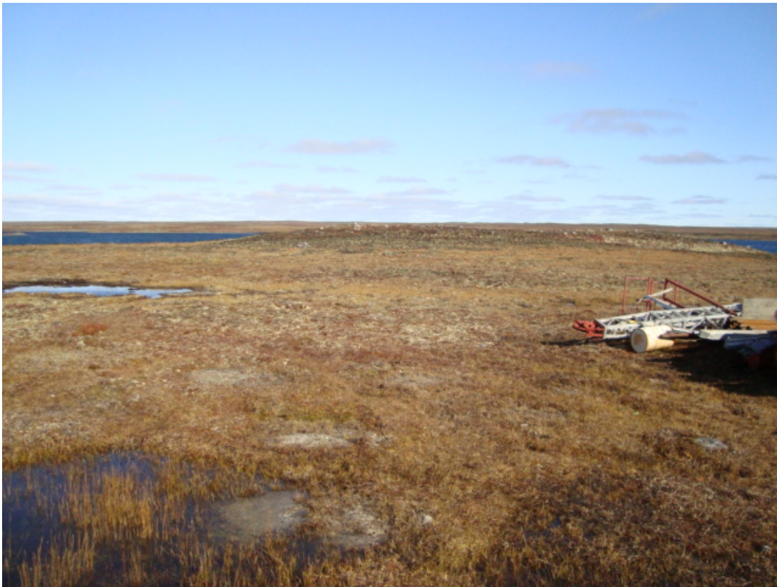
Discovery Camp – 2008 (Area cleaned up during exploration program)