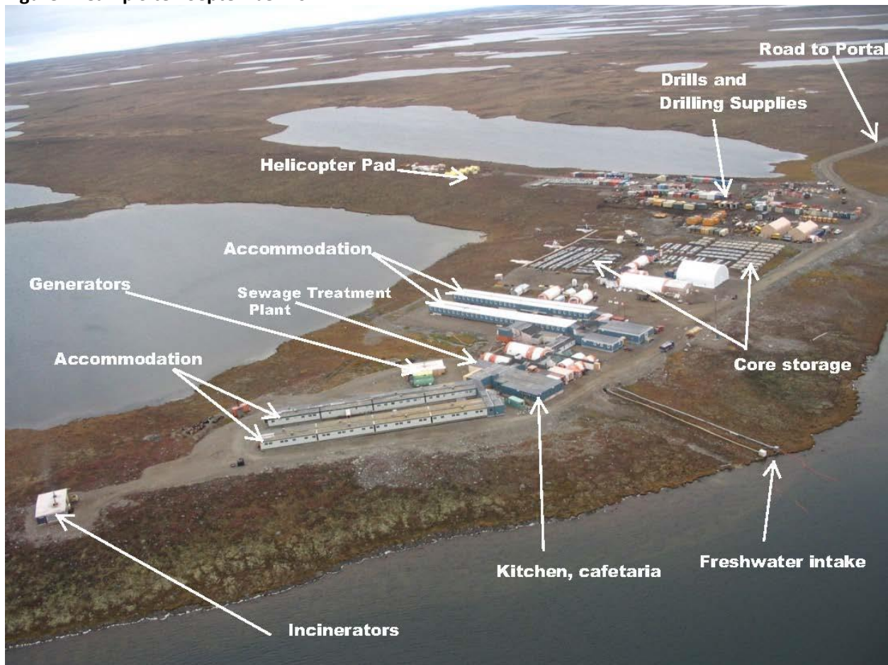
Figure 1. Camp Site - September 2012

The reclamation of the camp would see the removal of all buildings, sea cans and equipment. The core storage would be the only component to remain after reclamation.