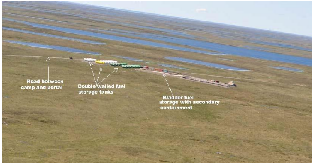
Figure 3. Fuel Tank Farm

All the double walled fuel tanks will be removed as will the bladder fuel storage. The road will be scarified as the final step in reclamation.