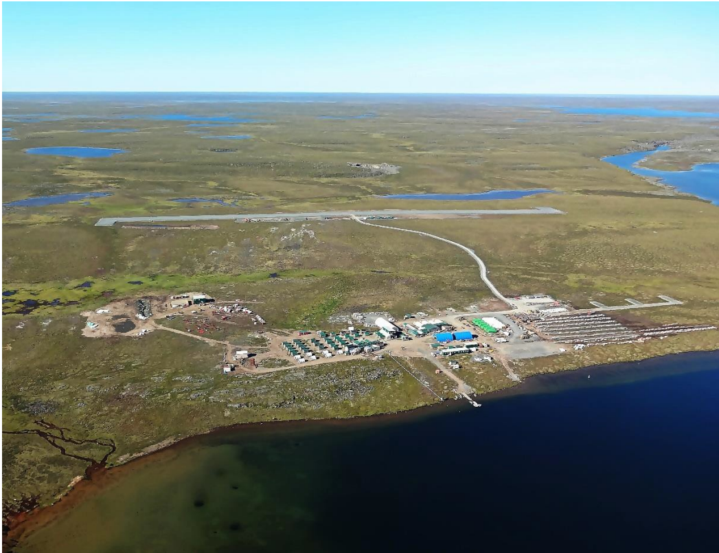
Figure 2. Aerial image of Goose Exploration Camp looking west. Photograph taken August 2013.