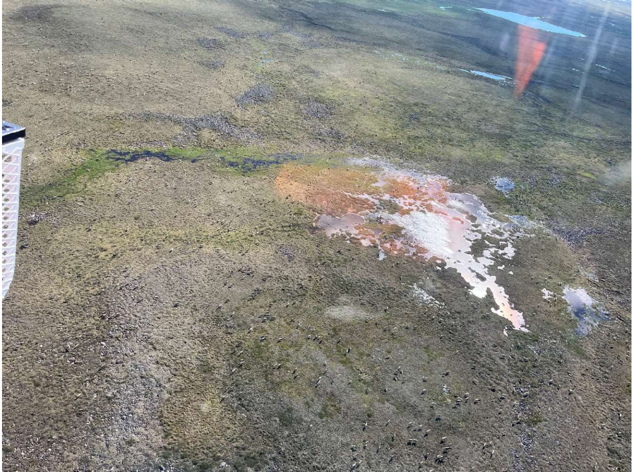
Figure 4. Photo of large caribou herd observed grazing in the tundra