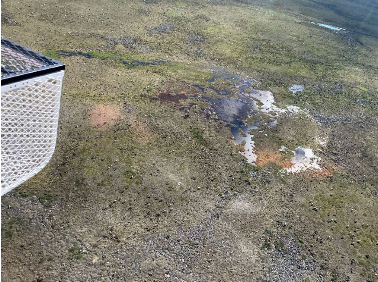
Figure 5. Photo taken from another angle of large caribou herd observed grazing in the tundra