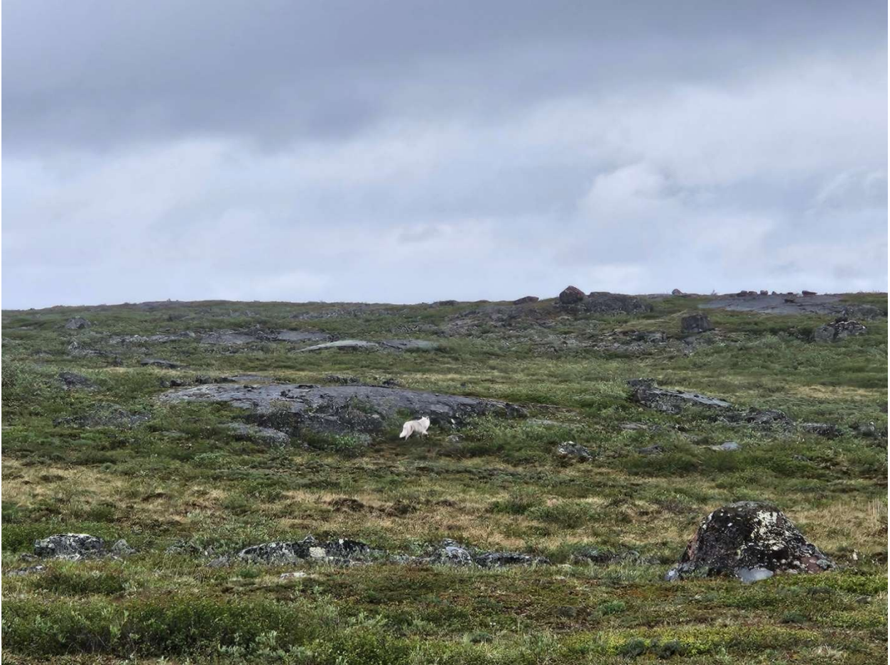
Figure 3. Photo of large white wolf observed walking in the tundra