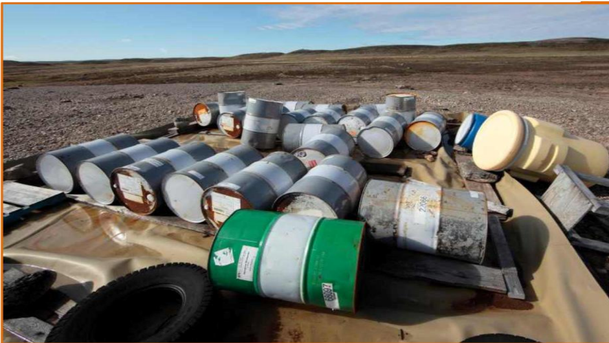
Aviation-fuel berm with spill kits at camp -- 18 August 2012.