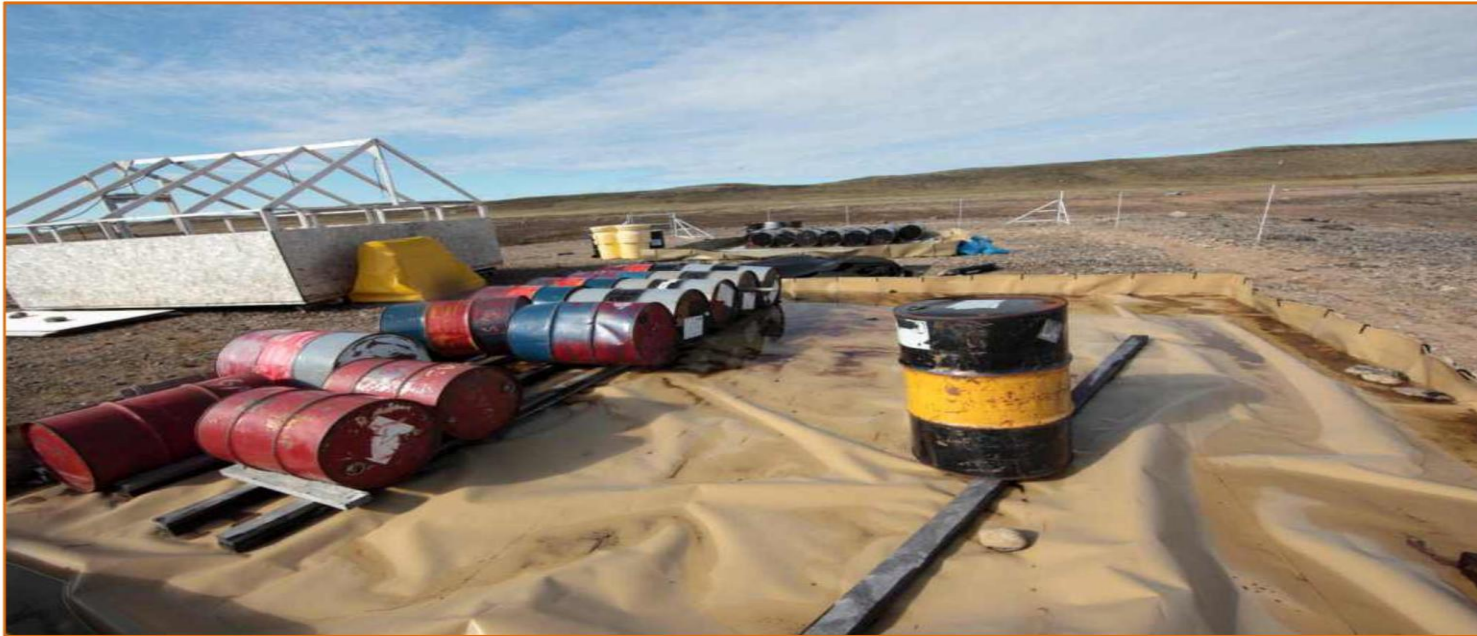
Petrol and tent drums in berm in foreground; diesel berm in background -- 18 August 2012.