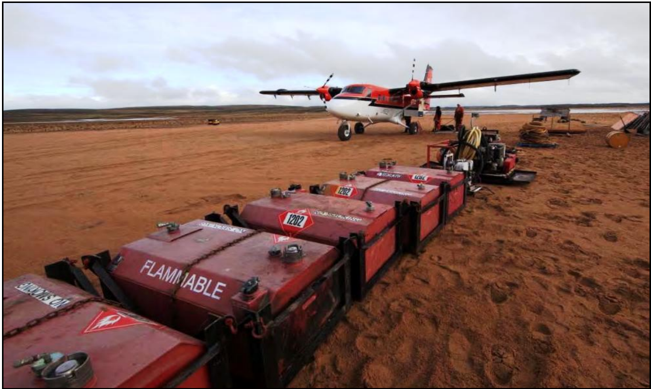
TOP: Drill-equipment laydown area after demobe – 20 August 2012. (LY-38 drill was removed in 2011.) ABOVE: Boart Longyear fuel tanks and pump tray on natural airstrip just prior to demobe – 19 August 2012.