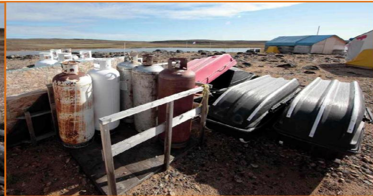
Propane and komatik storage -- 18 August 2012.