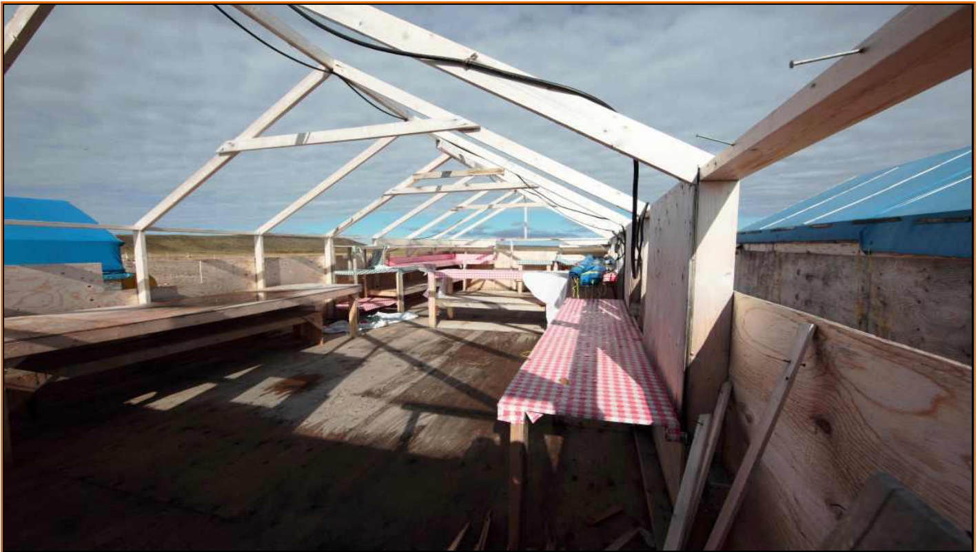
TOP: View from bear-fence south gate toward closed camp during Peregrine visit – 18 August 2012. ABOVE: Interior of empty kitchen (tent skin removed) – 18 August 2012.