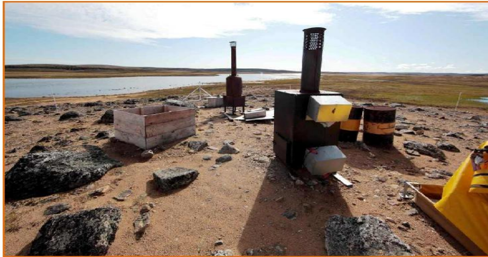
Inciner8 B-60 in foreground; old spare incinerator in background -- 18 August 2012.