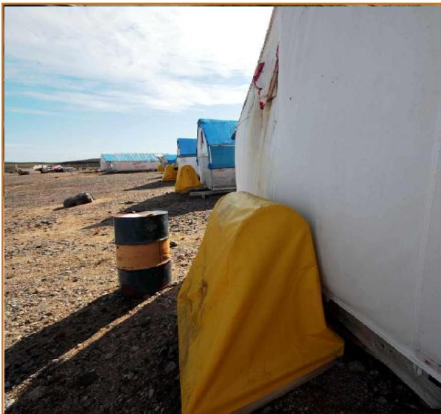
Looking E across covered tent-drum berms behind camp – 18 August 2012.