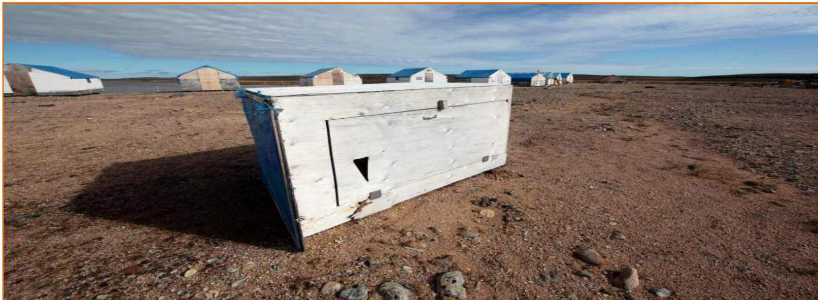
One of two outhouse shacks was found blown over during Peregrine site inspection; pits were covered -- 18 August 2012.