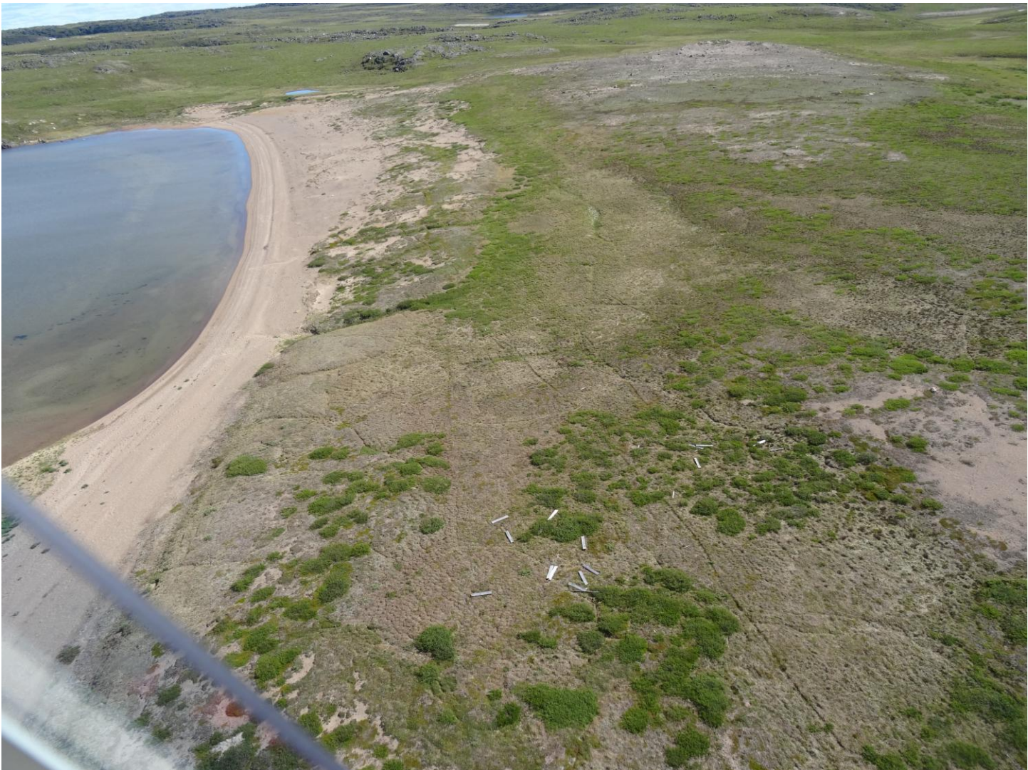
Figure 2. Further debris noted at the lake indicated as a camp location (coordinate 'D' above)