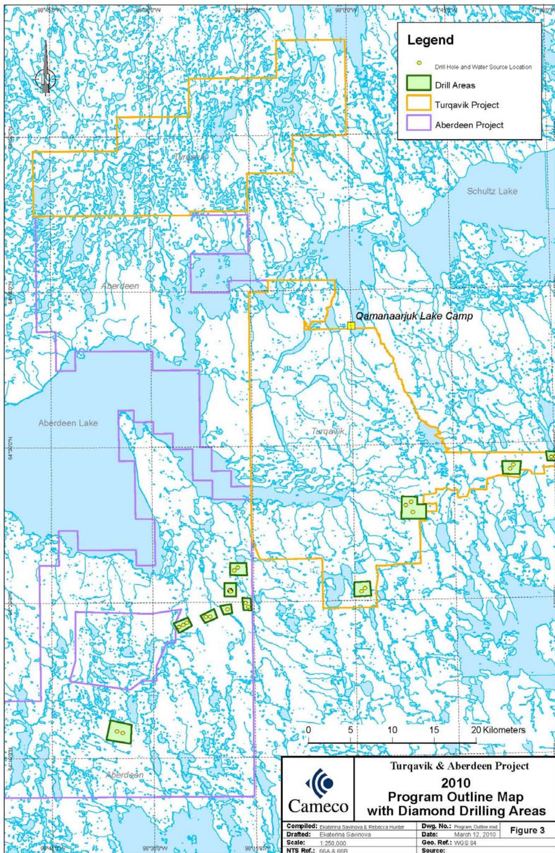
Figure 3. Proposed Drilling Sites and Drill Water Sources. Cameco Corporation Turqavik-Aberdeen Projects Uranium Exploration Plan