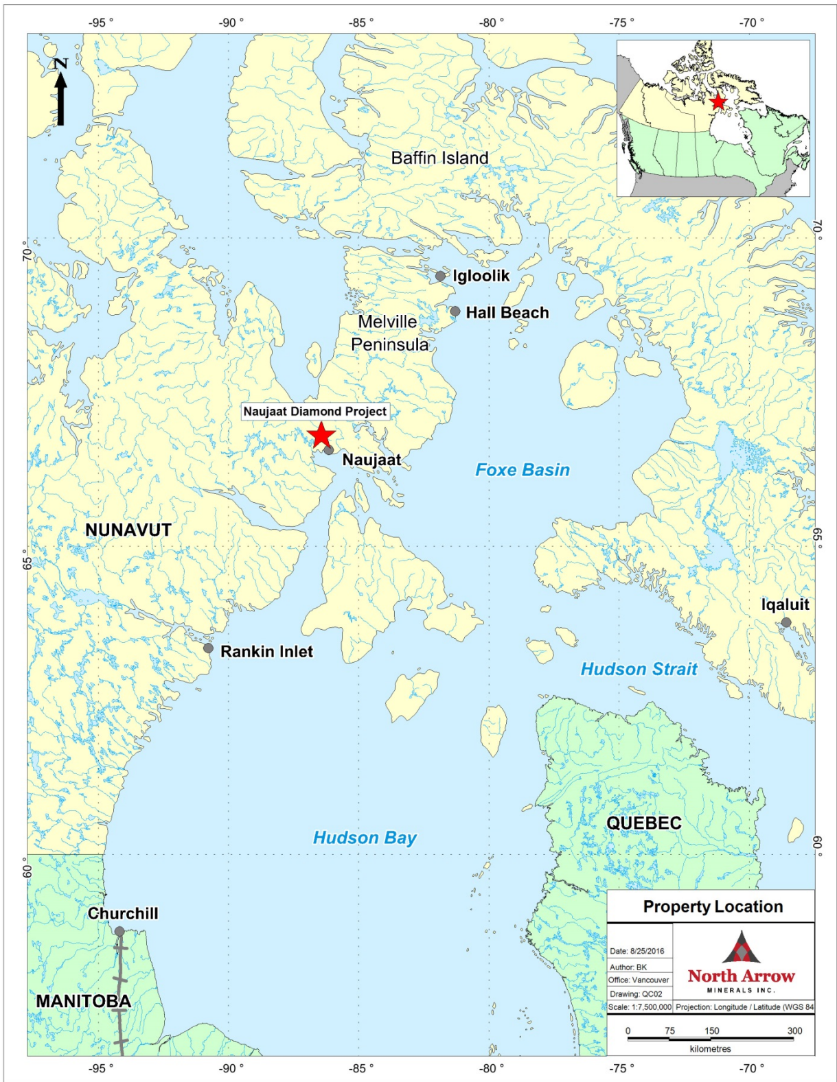
Figure 1: Regional Map