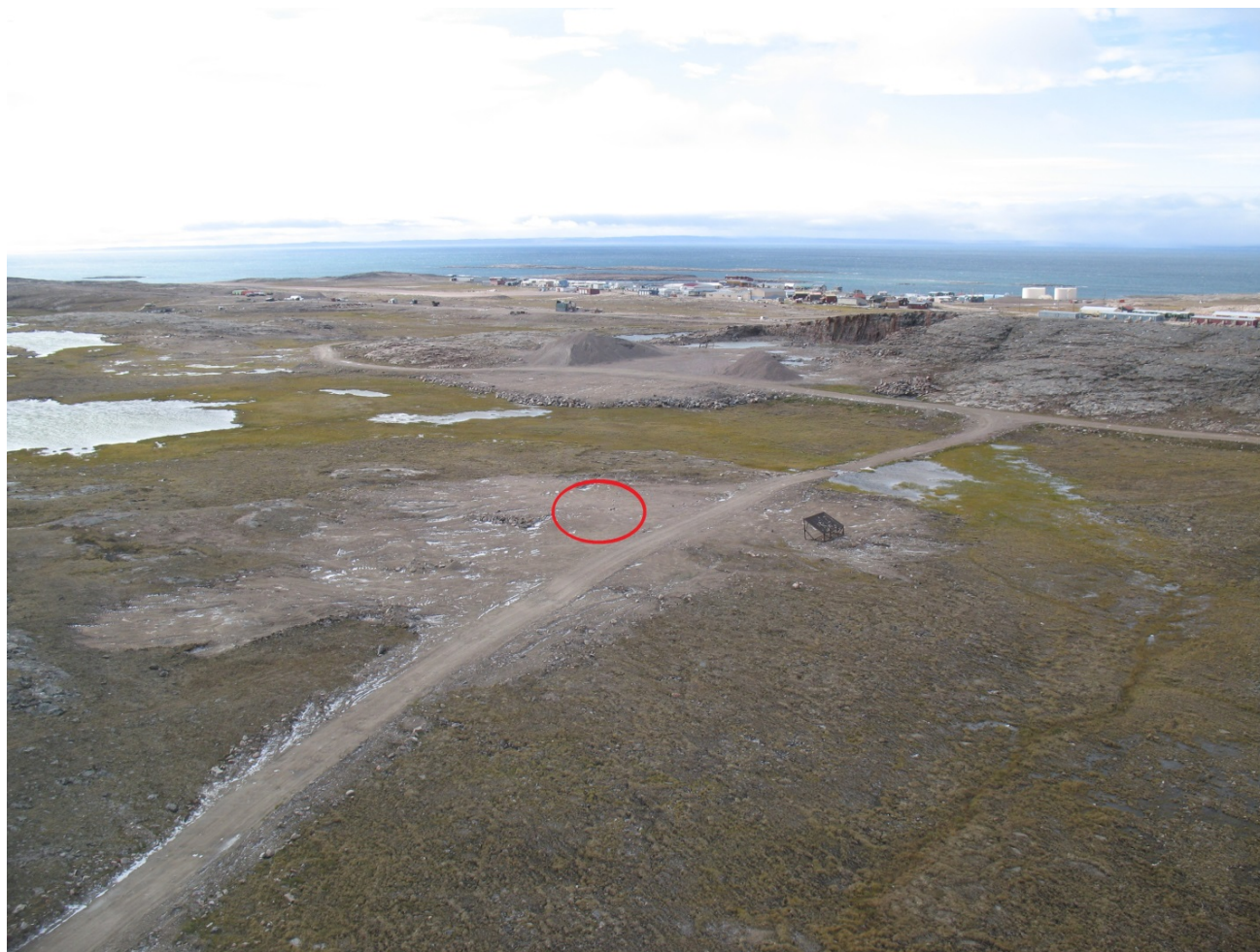
Photo taken from the air in the fall of the fuel storage site north east of Repulse Bay hamlet and airport (view looking south west).