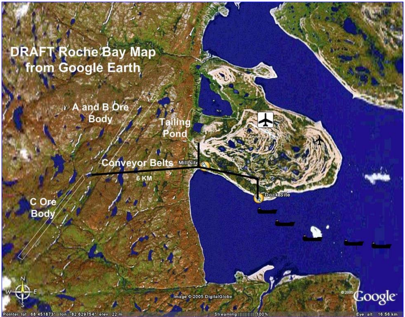
Figure 2: Site Specific Plan Drawings of Facilities