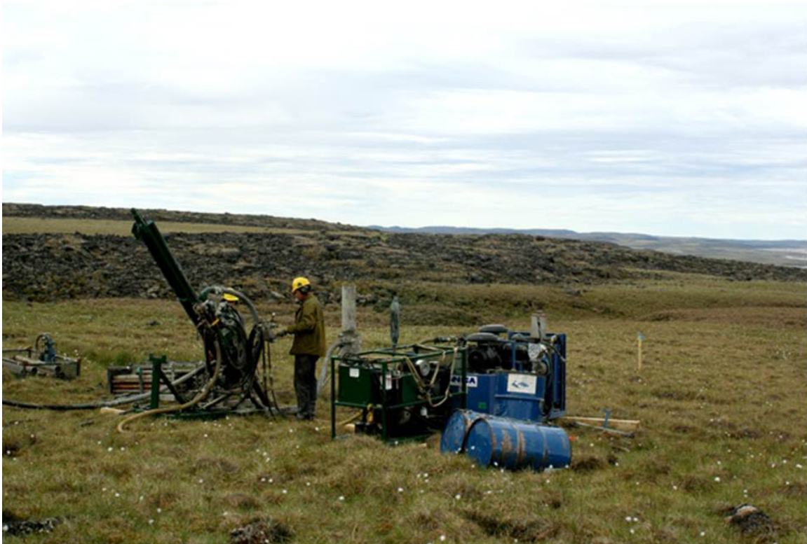
Figure 4: Example of reverse-circulation (RC) drilling operations. The drill is helicopter-portable and pneumatically powered, requiring no water source or drill fluid additives.