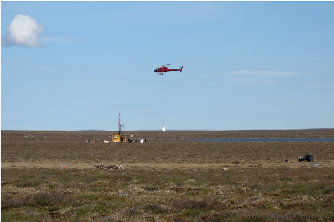
Figure 3: Example of diamond drilling operations. The helicopter is slinging salt to the drill in a nylon ore bag. In the foreground is the water supply pump as well as a pile of pallets used for cribbing the drill floor. Photo taken during 2008 operations.