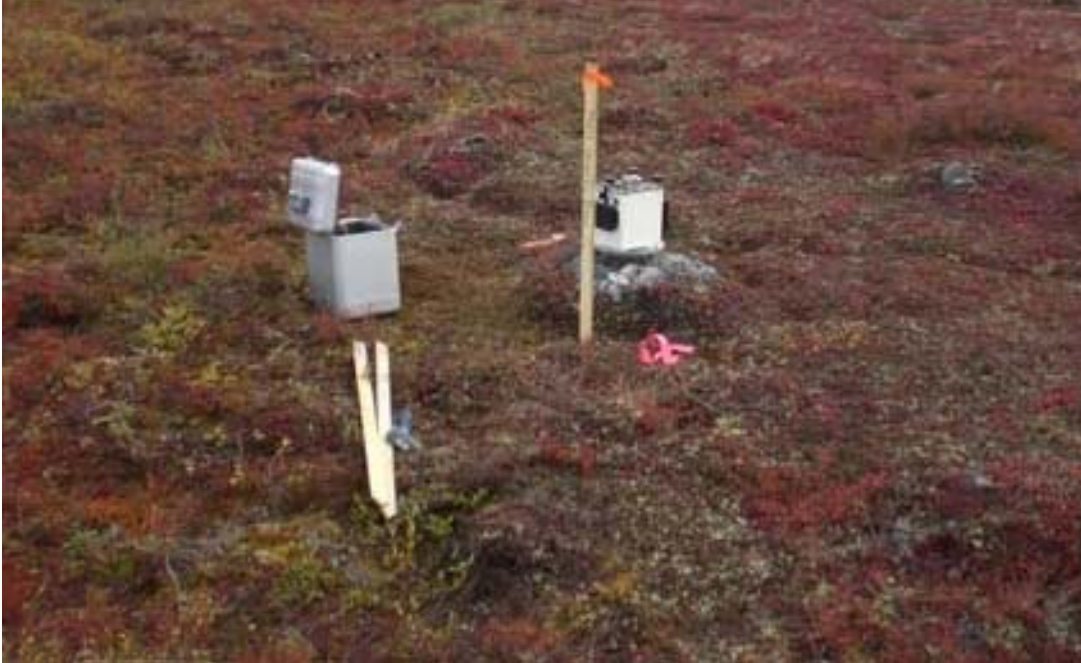
Figure 2: One of the gravity meters used by MWH Geo-Surveys Ltd. while conducting ground gravity surveys for Forum Uranium Corp. in 2008.