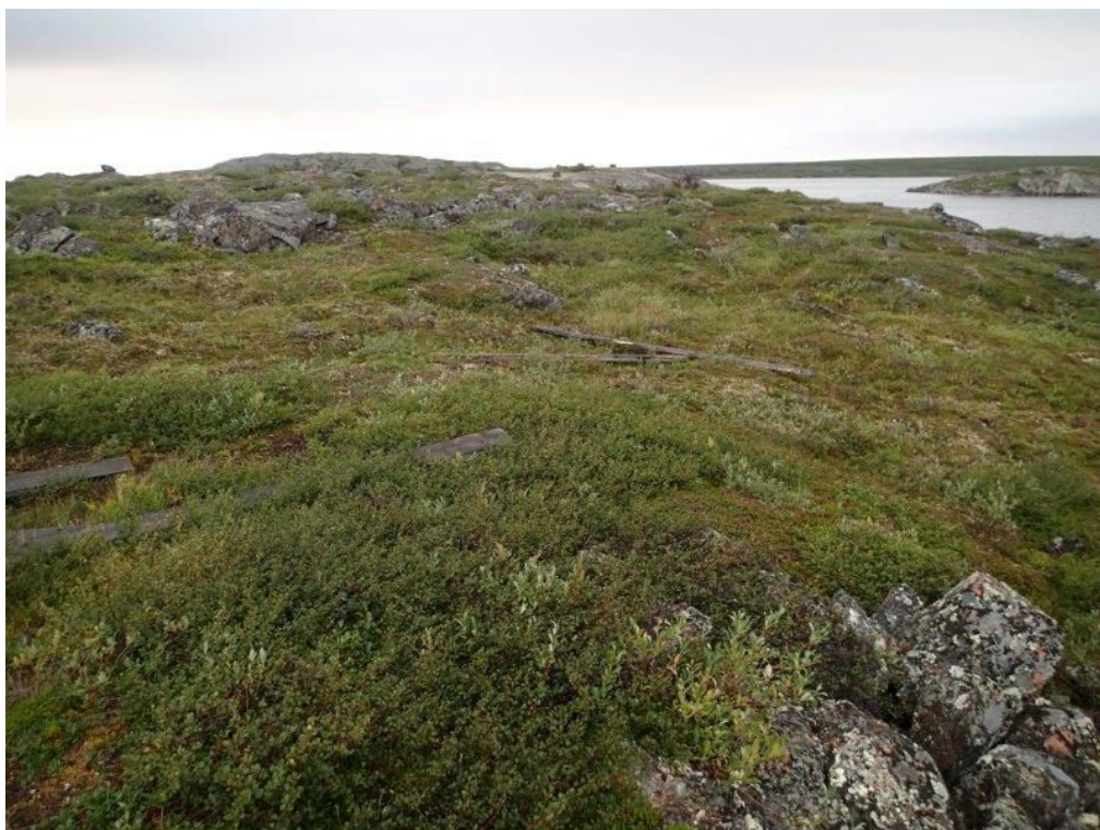
Photo 5: Before photo of planks at Mouse Lake camp. Looking northwest.