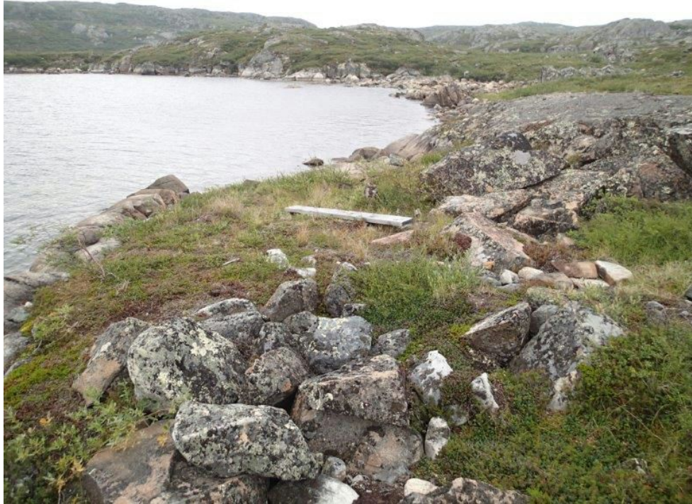
Photo 11: Before photo of 2 nd plank by lakeshore at Mouse Lake camp. Looking east.