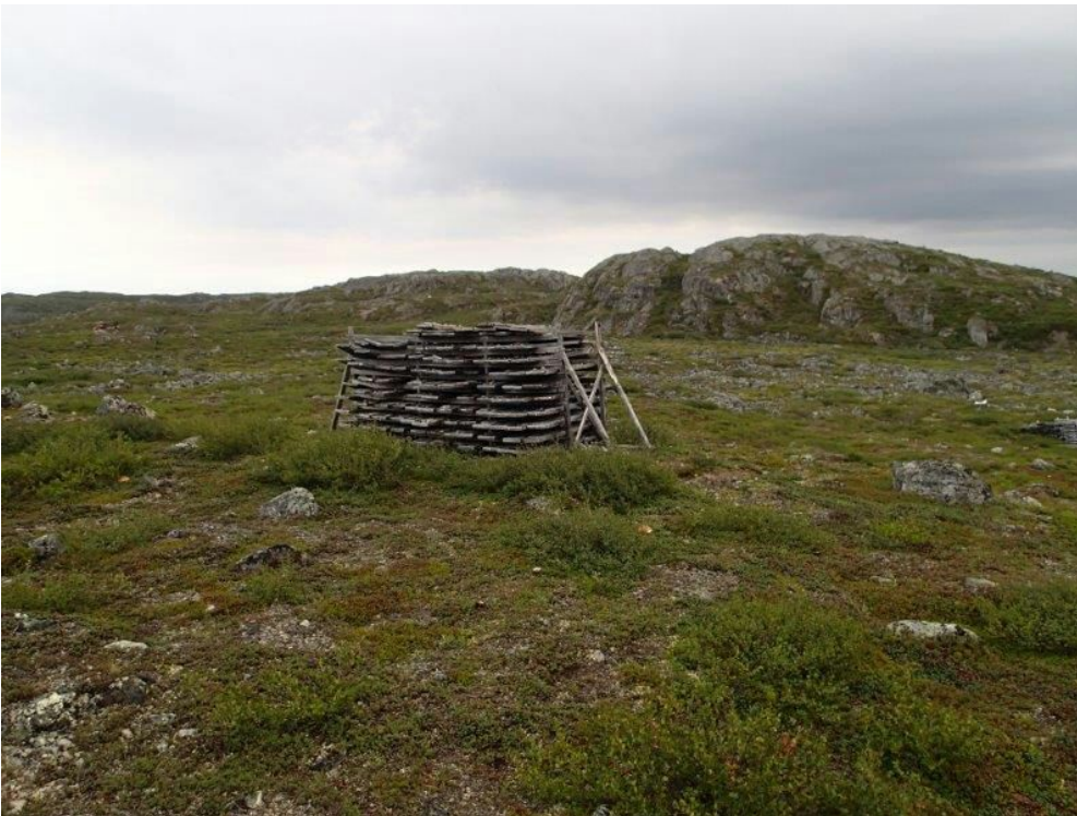
Photo 18: After cleanup photo of historic drill core rack area 2. Boxes and core strewn about were stacked in or on core racks. Note: no before cleanup photo was taken. Looking east.