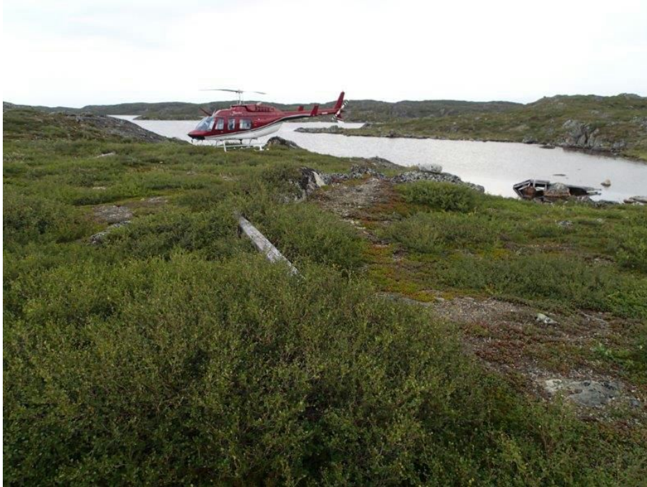
Photo 13: Before photo – example of one of the historic timbers near southwest end of Paleface Lake cleaned up by North Arrow. Looking east.