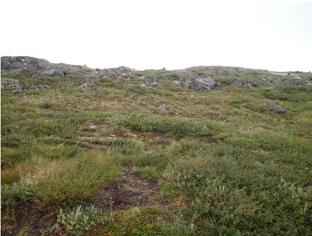
Photo 4: After cleanup photo of planks at Mouse Lake camp. Looking west.