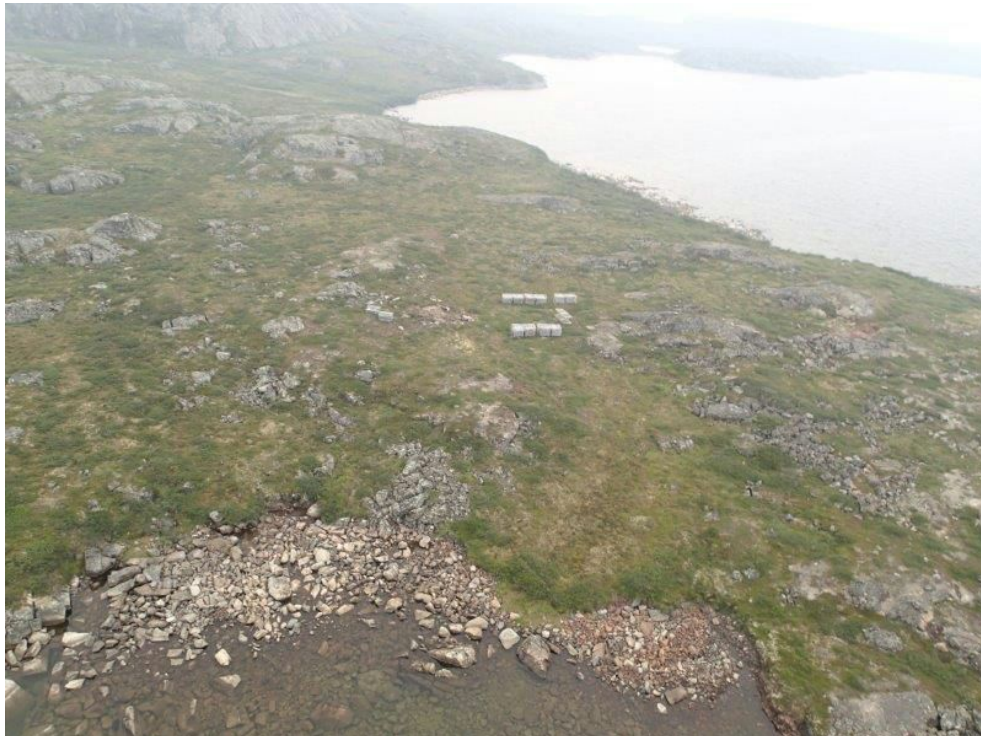
Photo 2: After cleanup photo (timbers removed) at Mouse Lake. Looking south.