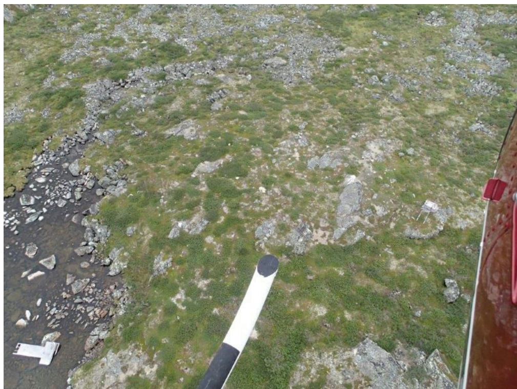
Photo 24: After cleanup photo of historic debris (timbers, core rack) at south end of Paleface Lake. Looking south.