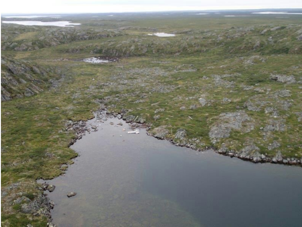
Photo 23: Before photo of historic debris (timbers, dock) at south end of Paleface Lake. Looking south.