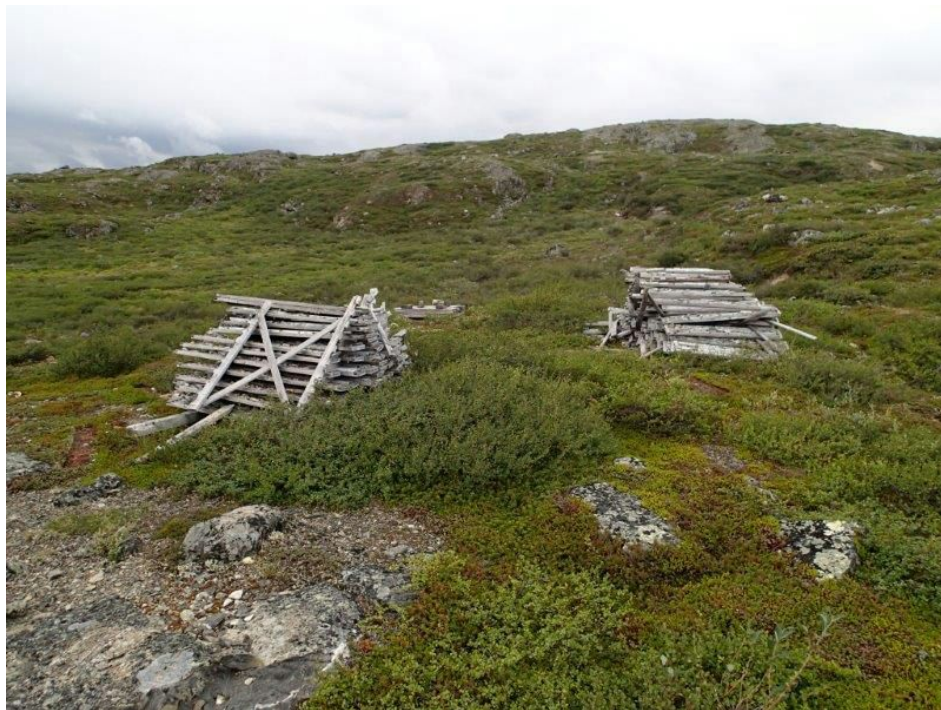
Photo 20: After cleanup photo of historic drill core area 3. Looking west.