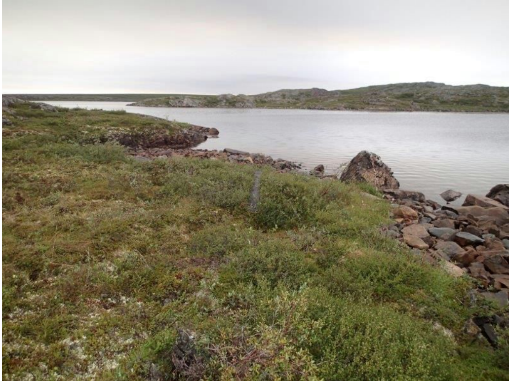
Photo 9: Before photo of plank by lakeshore at Mouse Lake camp. Looking northwest.