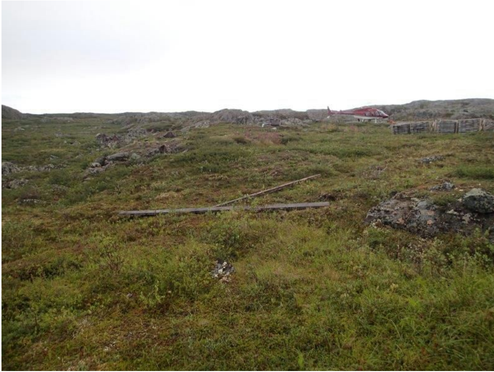
Photo 7: Before photo of planks at Mouse Lake camp. Looking south.