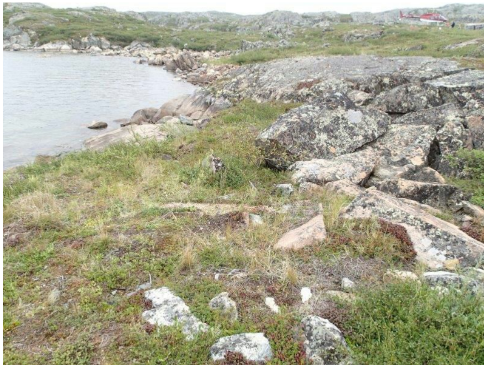
Photo 12: After cleanup photo of 2 nd plank by lakeshore at Mouse Lake camp. Looking east.