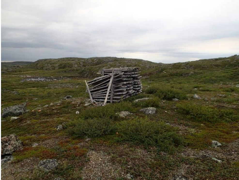
Photo 17: After cleanup photo of historic drill core rack area 2. Boxes and core strewn about were stacked in or on core racks. Note: no before cleanup photo was taken. Looking south.