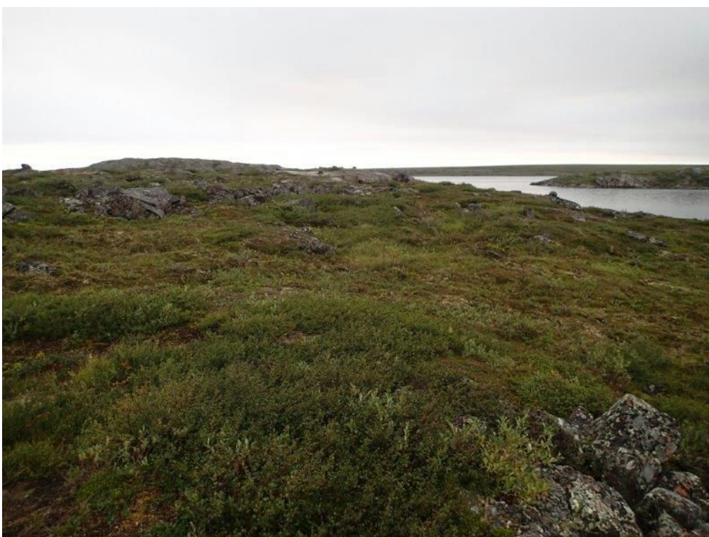
Photo 6: After cleanup photo of planks at Mouse Lake camp. Looking northwest.