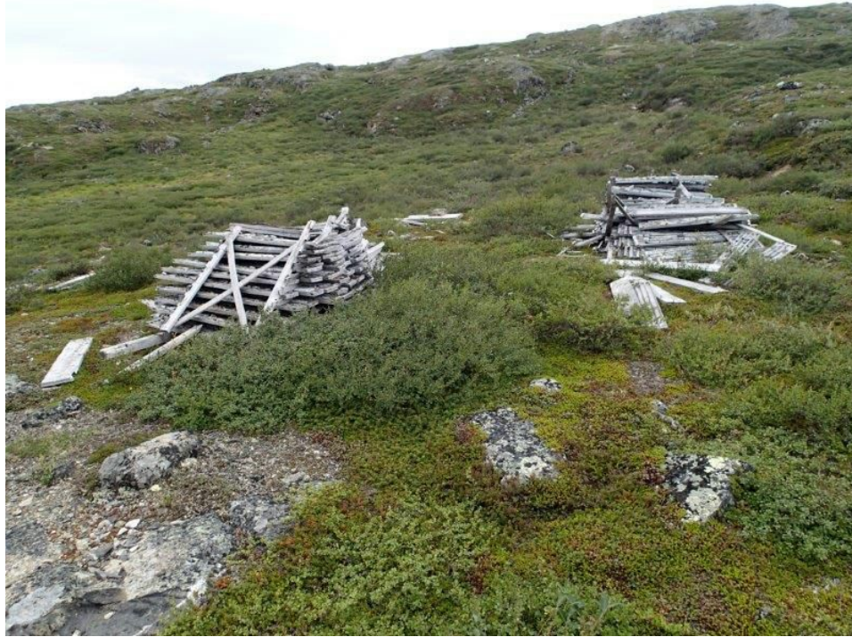
Photo 19: Before photo of historic drill core area 3. Looking west.