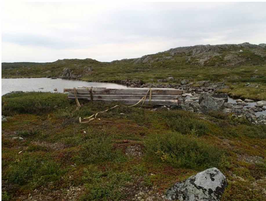
Photo 14: Photo of five historic timbers collected and strapped for removal near southwest end of Paleface Lake. Looking east.