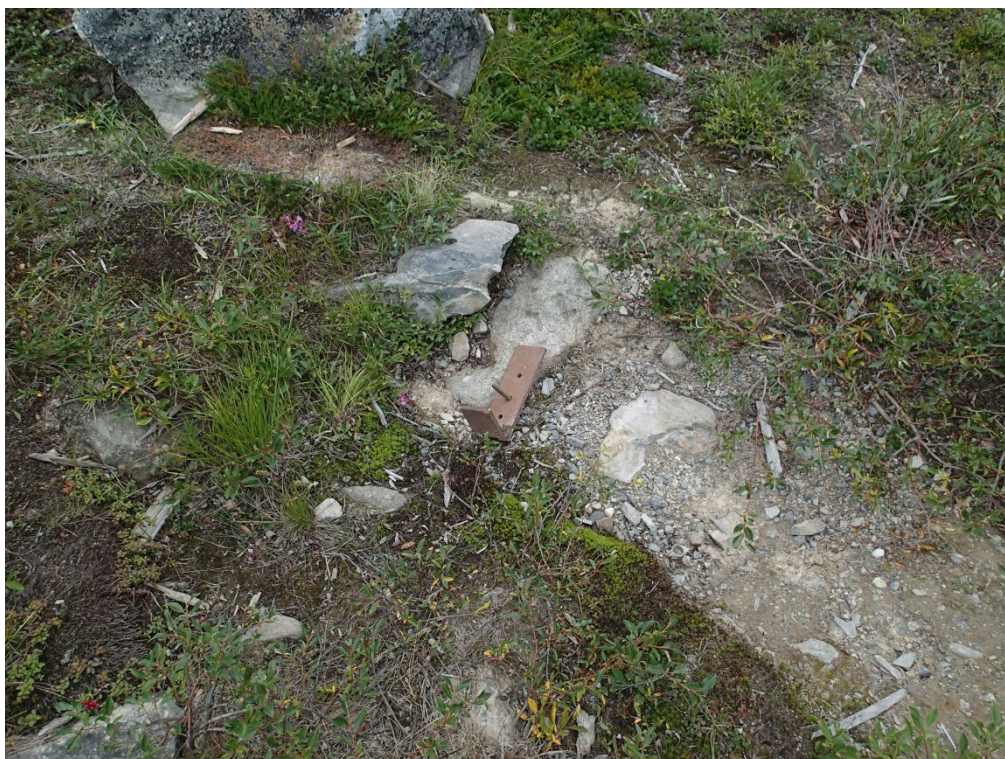
Photo 21: Before photo of historic metal bracket-debris near spot of already cleaned up historic timber.