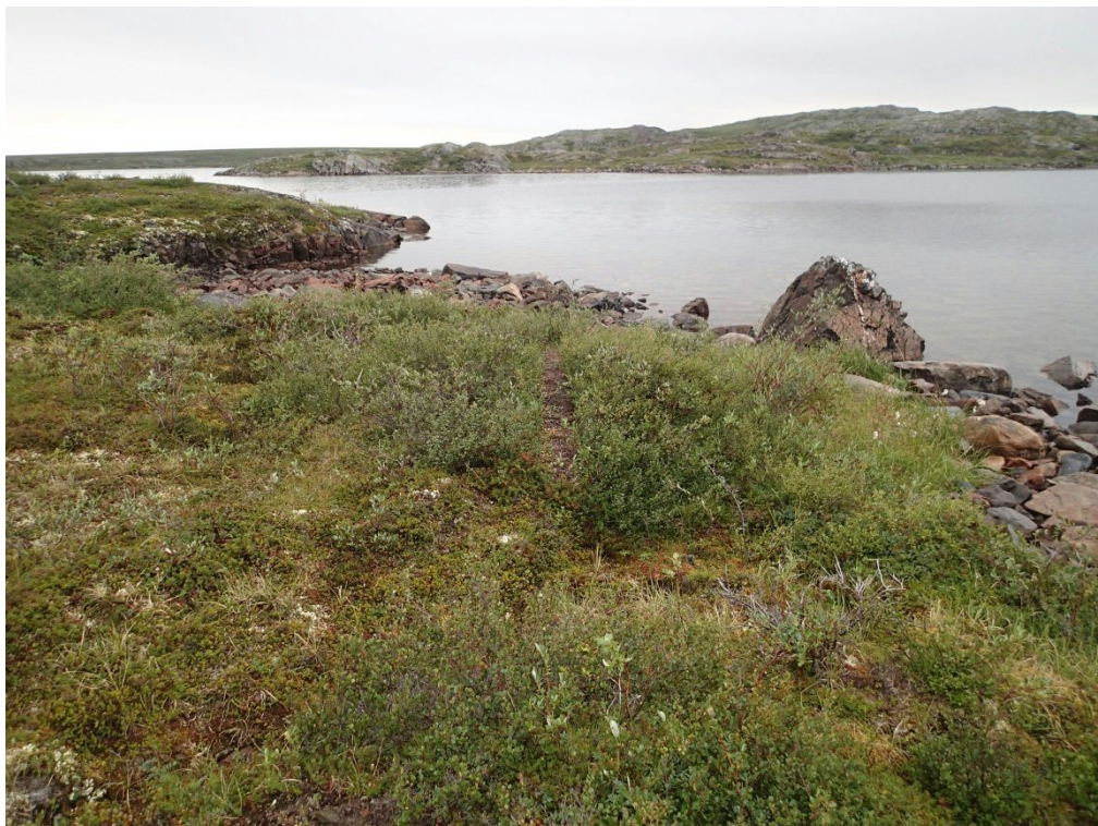
Photo 10: After cleanup photo of plank by lakeshore at Mouse Lake camp. Looking northwest.