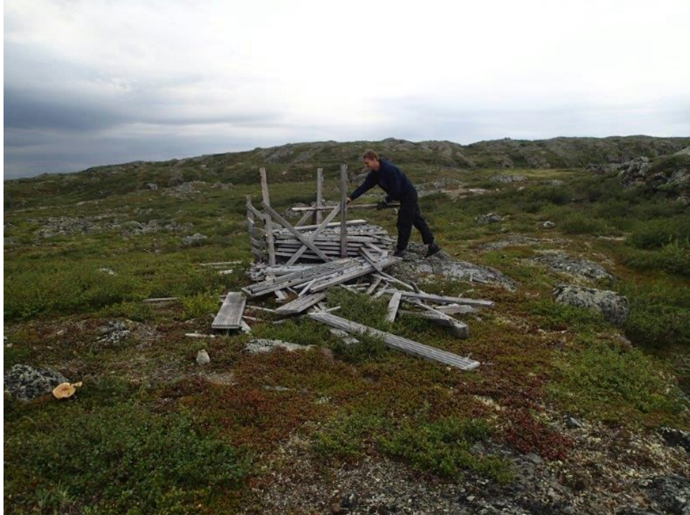
Photo 15: “Before” photo of historic core rack area 1. Looking west.