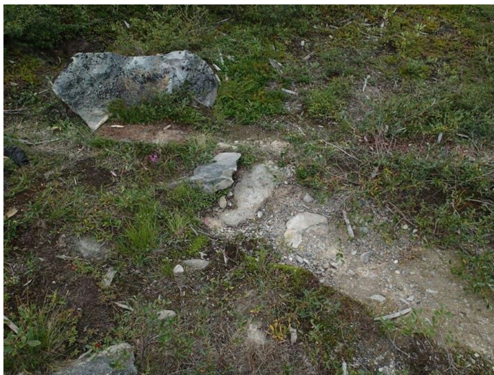
Photo 22: After cleanup photo of historic metal bracket-debris near spot of already cleaned up historic timber.