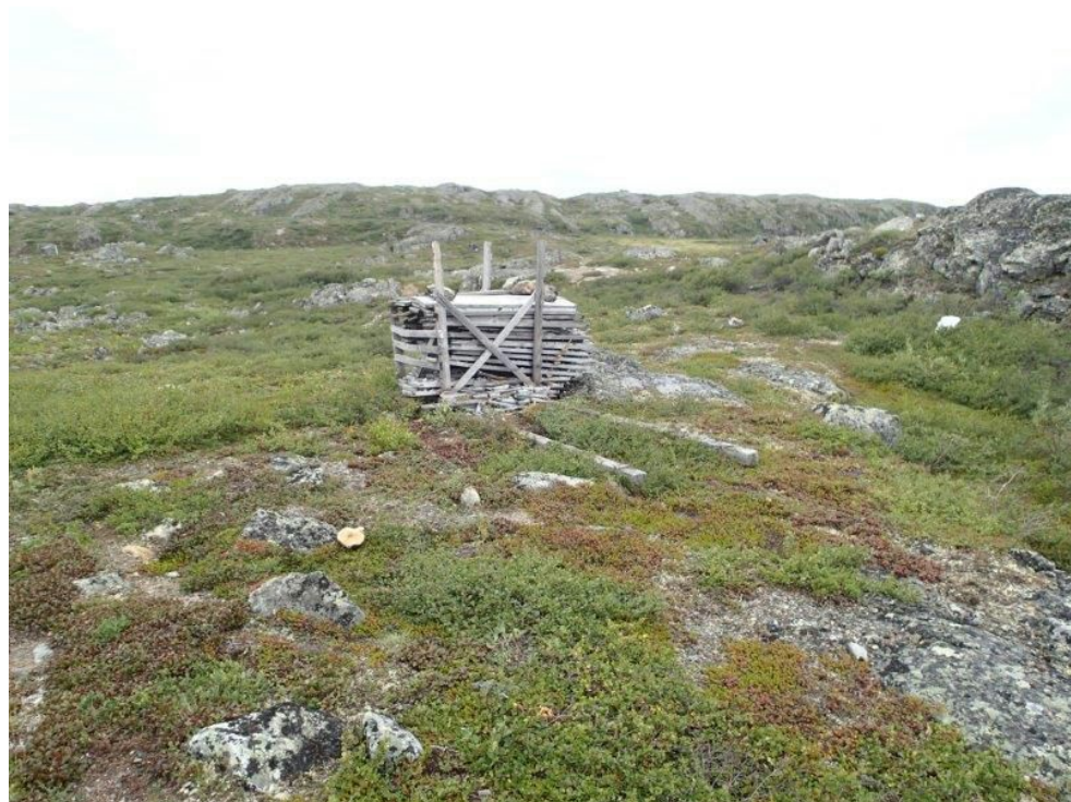
Photo 16: “After” cleanup photo of historic core rack area 1. Looking west.