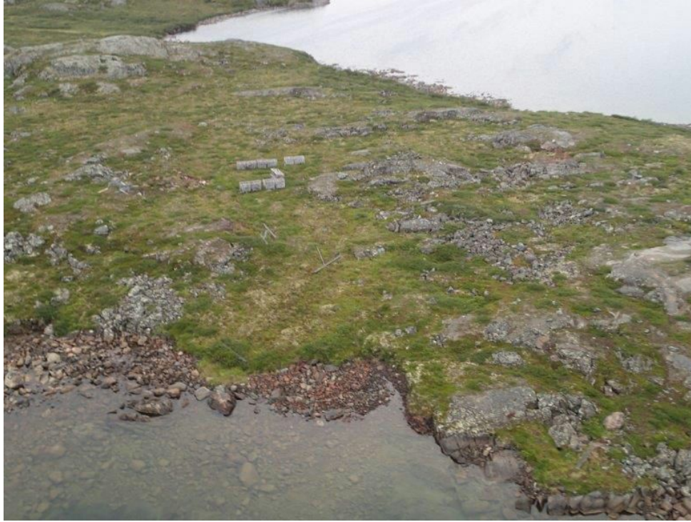
Photo 1: Air photo of timbers and core racks at Mouse Lake before cleanup. Looking south.