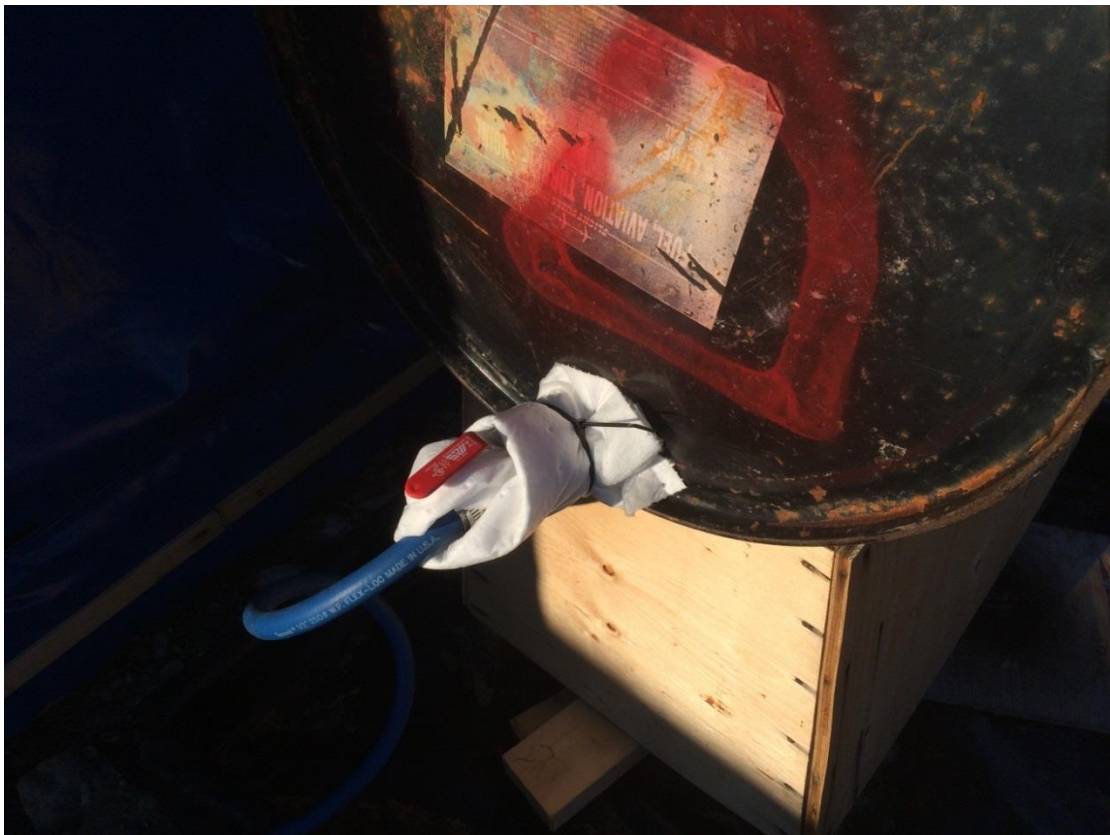
Photo 4: Absorbent Matting Wrapped Around Tent Drum Fuel Line Fitting