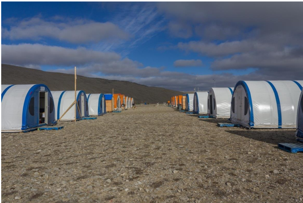
Photo 2: Storm Camp during Operations (looking east)