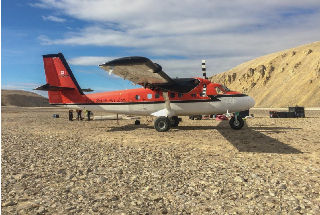
Photo 3: Storm Camp Airstrip and Laydown Area (looking west)