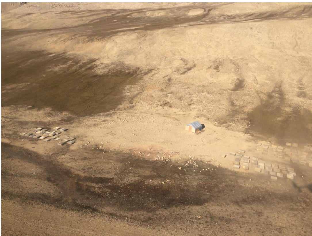
Photo 12: Aston Camp and Historical Drill Core Stacks after Shutdown – Aerial (looking north)