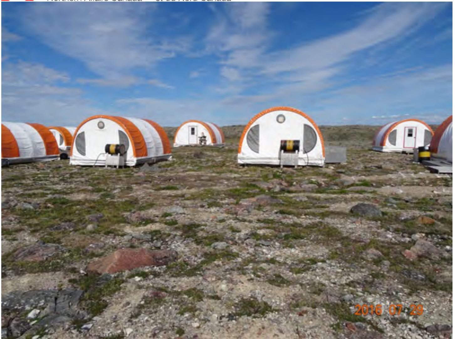
Figure 17 Weather Haven tents with fuel drums on wooden stands