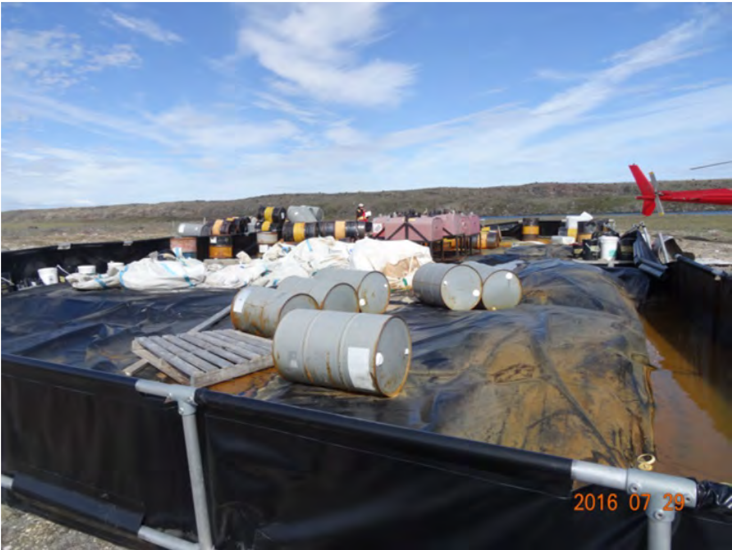
Figure 4 45 gallon drums of Jet A and heating fuel in secondary containment - evidence of leakage from drums