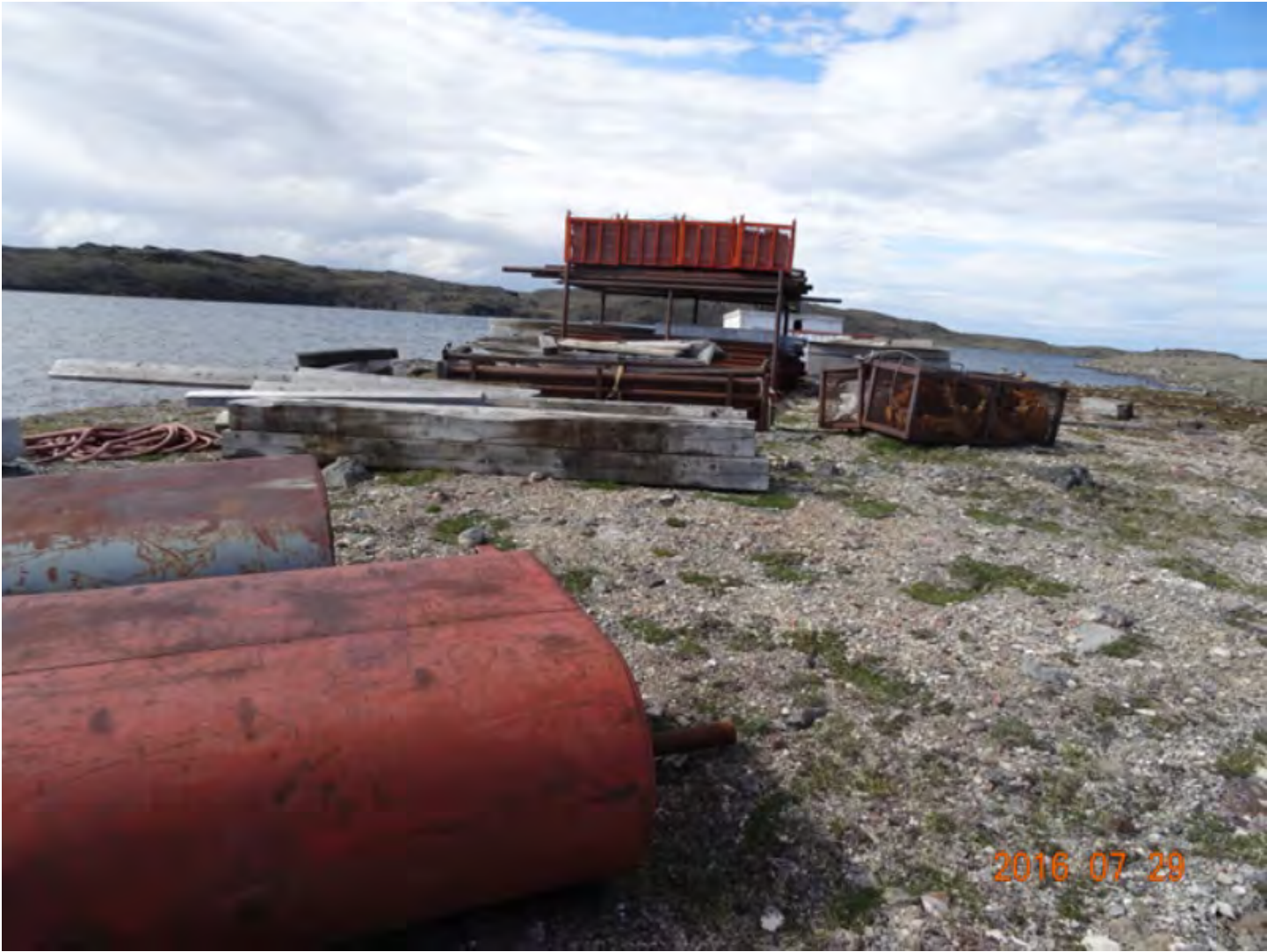
Figure 24 Drillers laydown at the Tuktu Camp