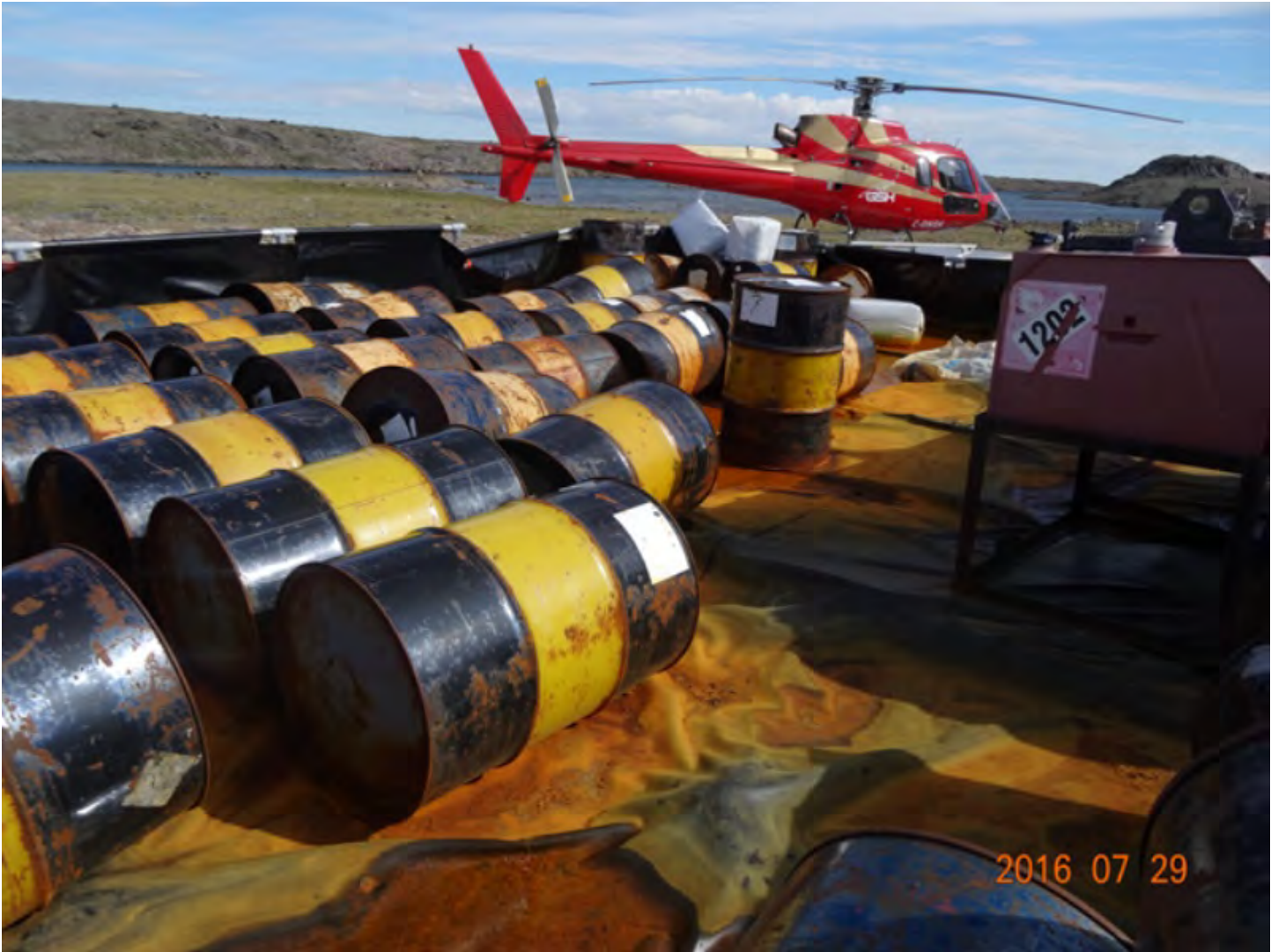
Figure 6 Secondary Containment with barrels of fuel and water