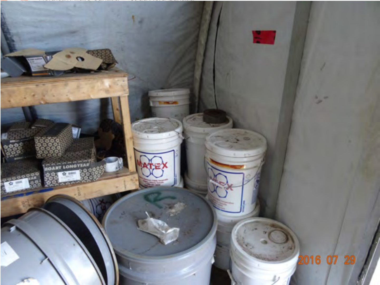
Figure 31 Drums of lube and unknown oil at camp