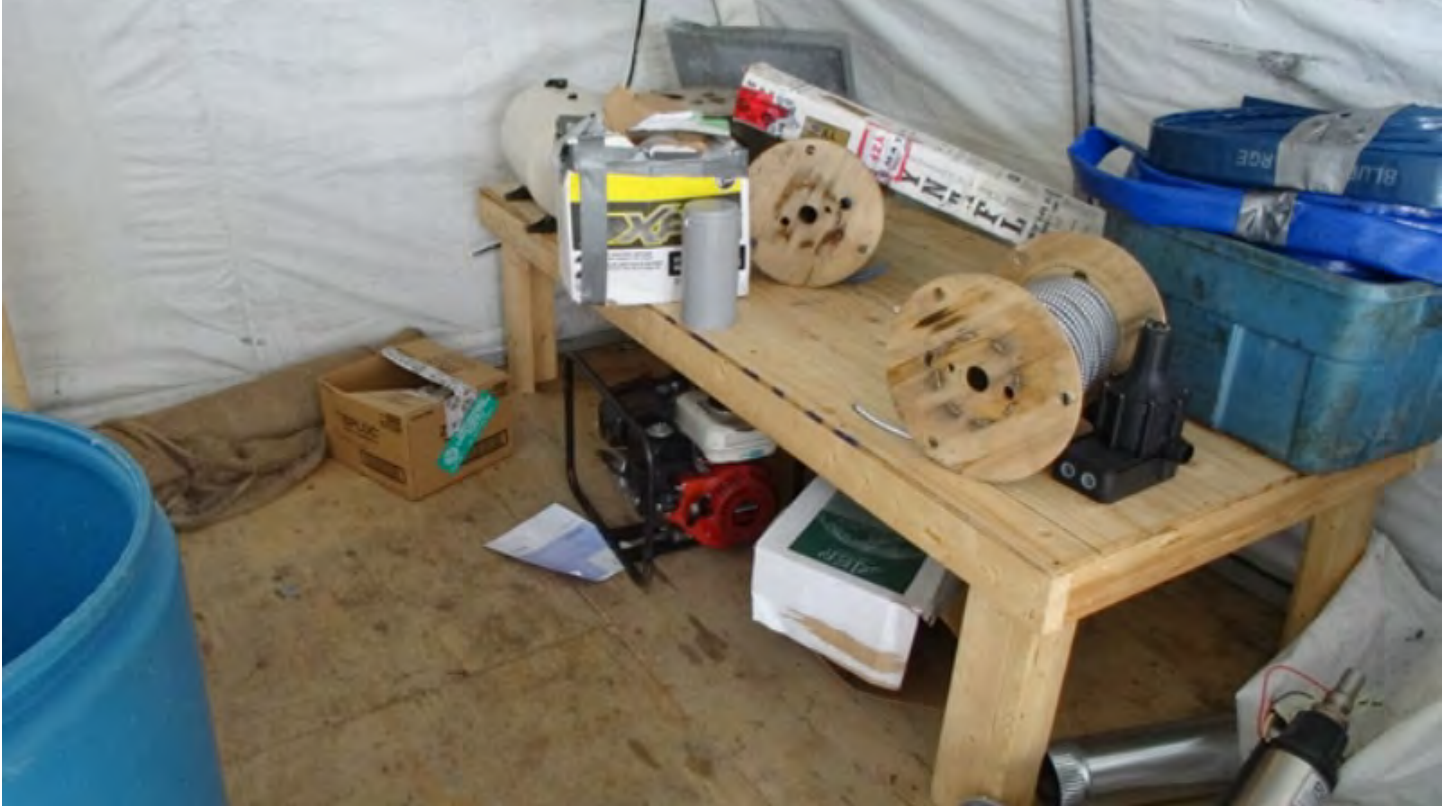
Figure 19 pumps and other tools abandoned at the Tuktu camp