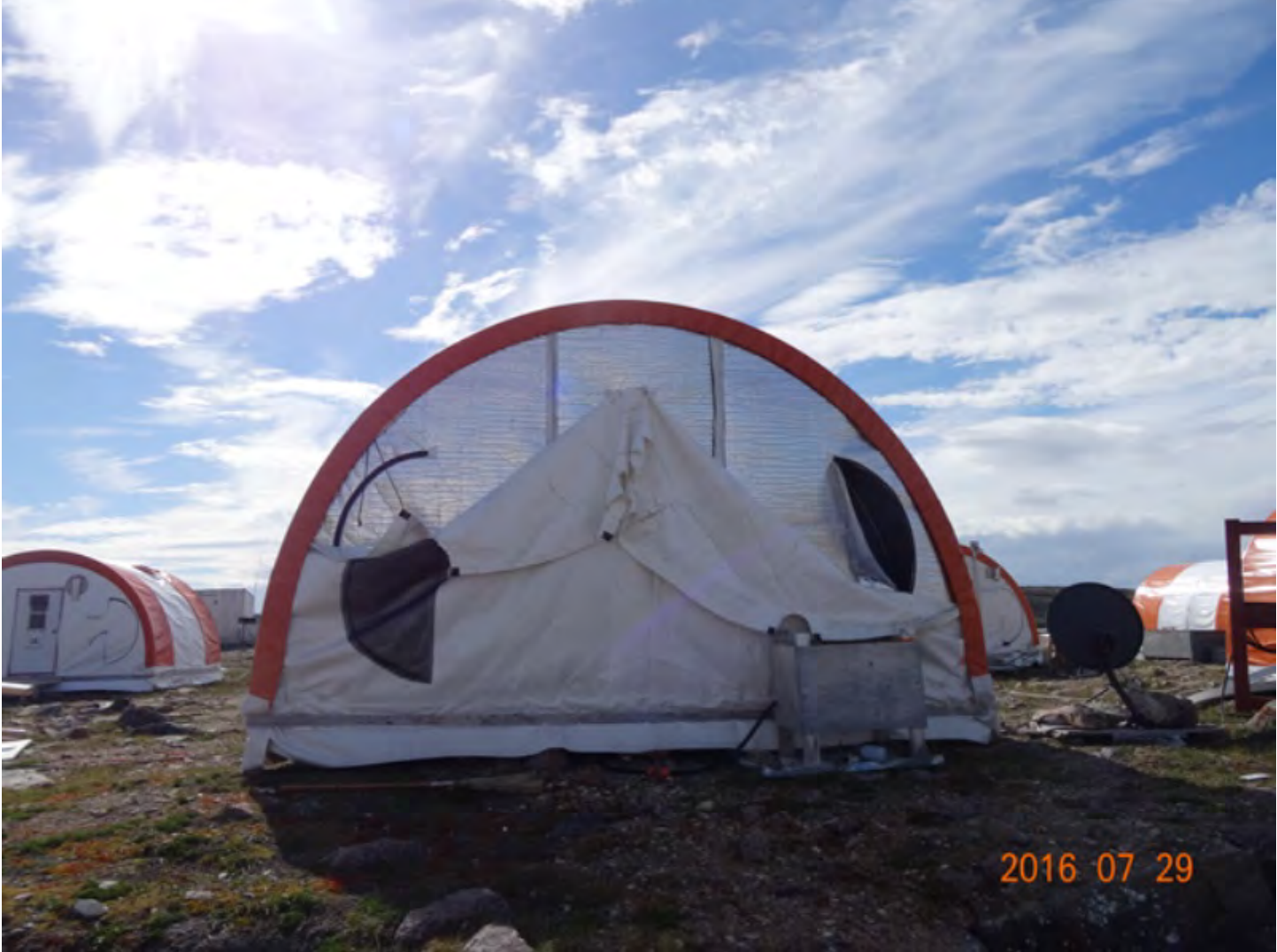
Figure 15 Weather haven tent needs repair