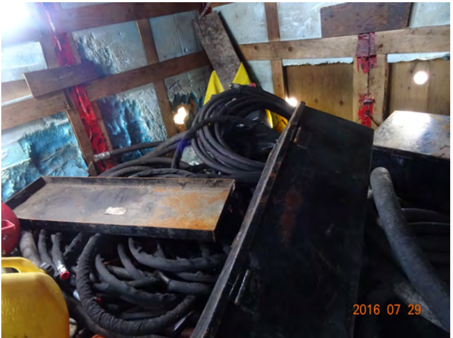
Figure 26 Drill hose at the Tuktu Camp