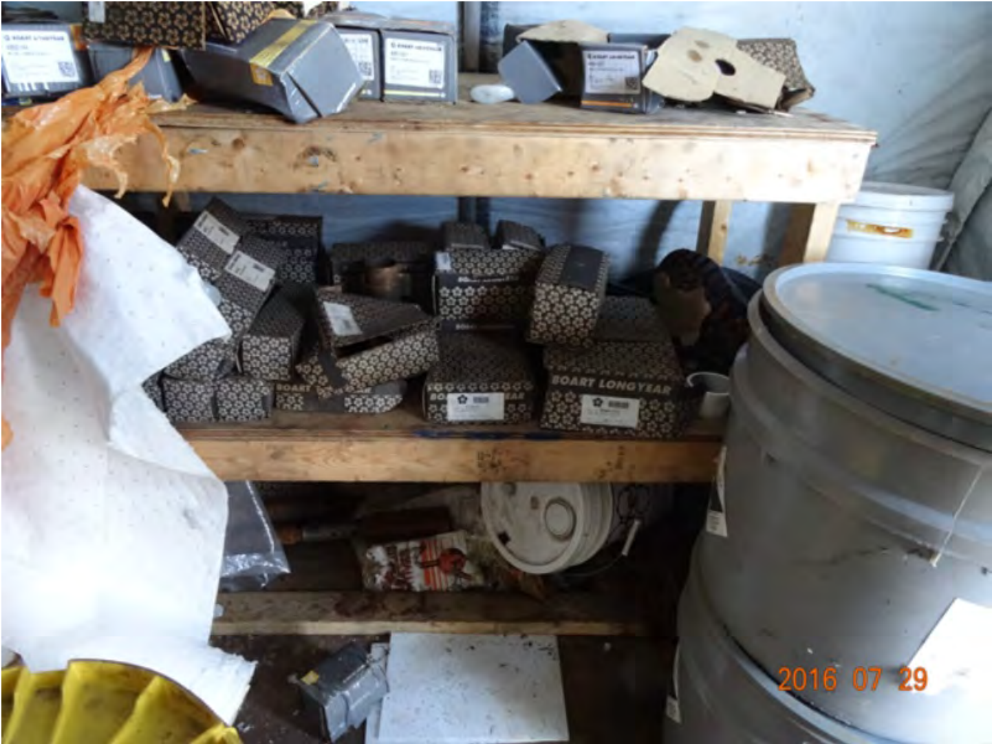
Figure 32 Spare parts for drilling equipment