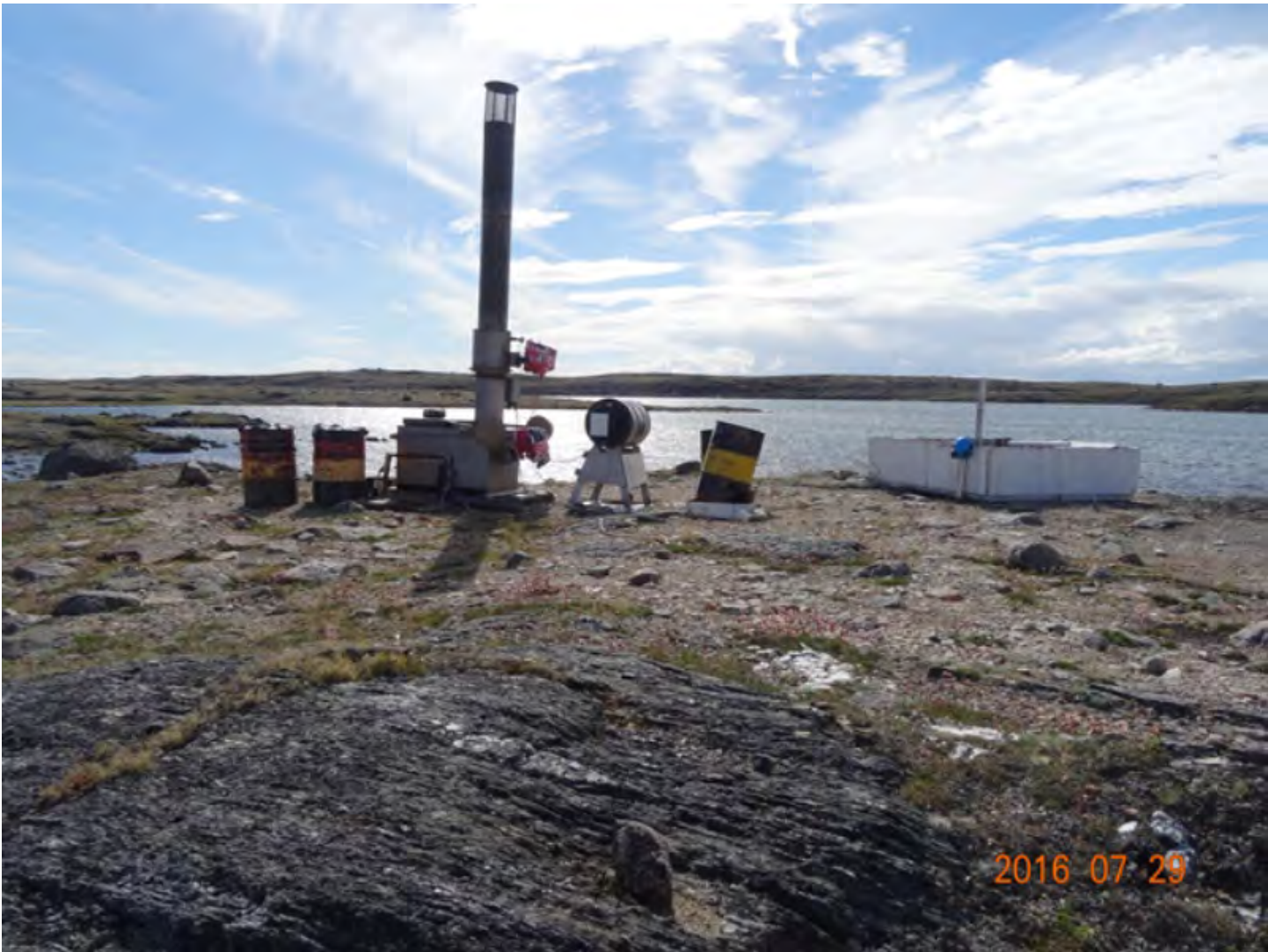
Figure 2 Incinerator with Garbage at the camp.