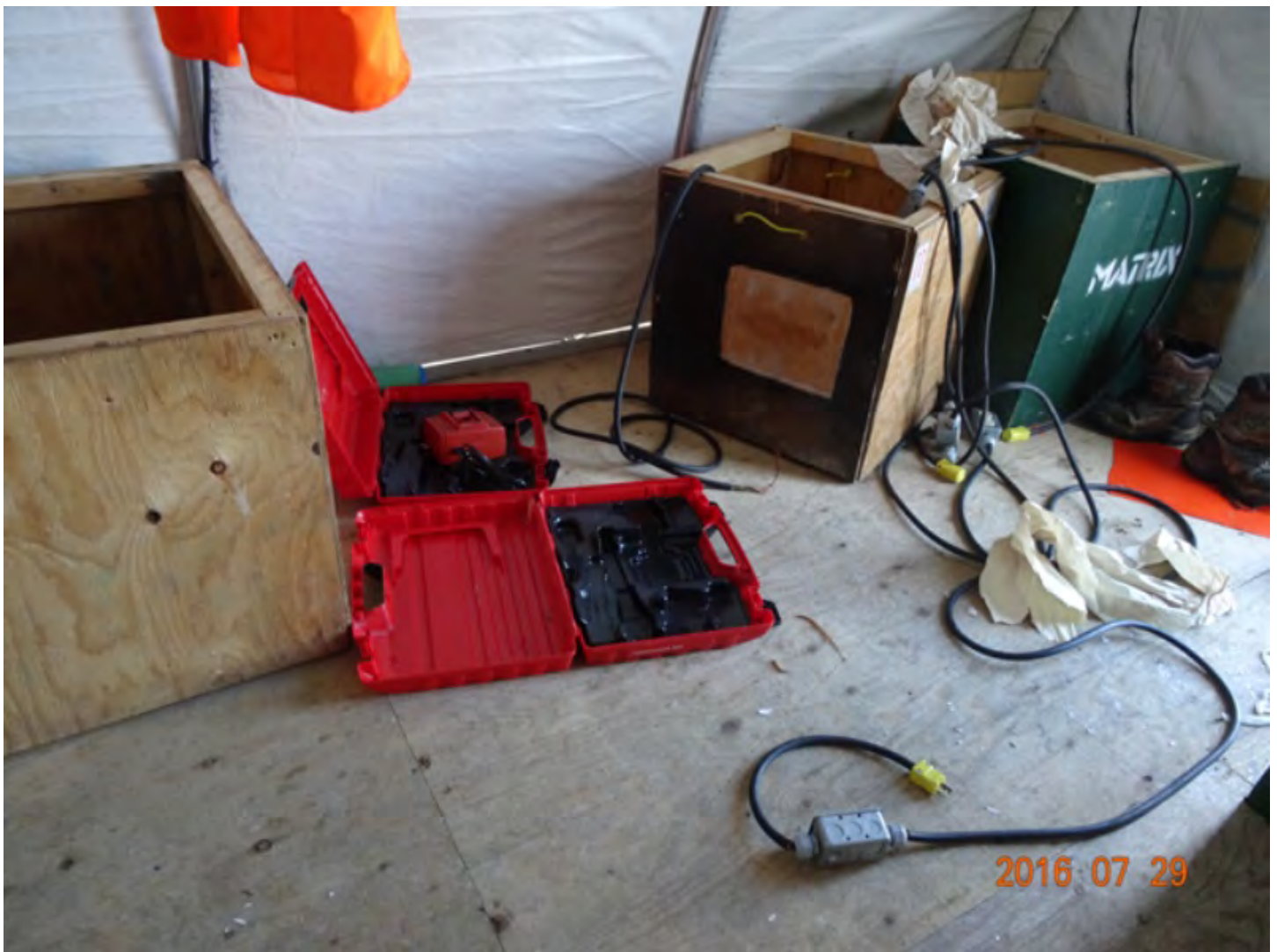
Figure 18 Misc. abandoned camp supplies found inside a weather haven