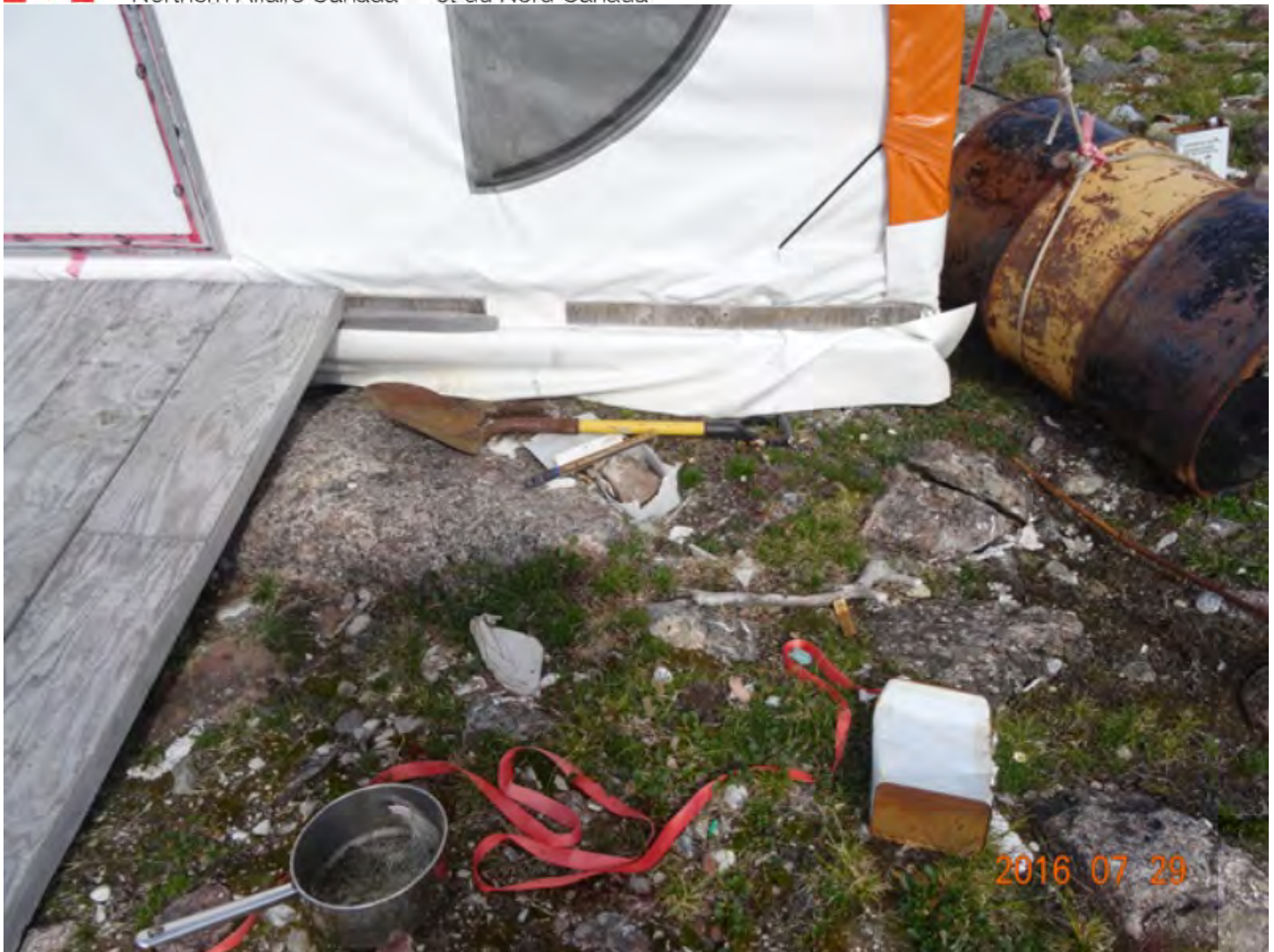
Figure 21 Hydrocarbon staining outside tents at the Tuktu Camp.