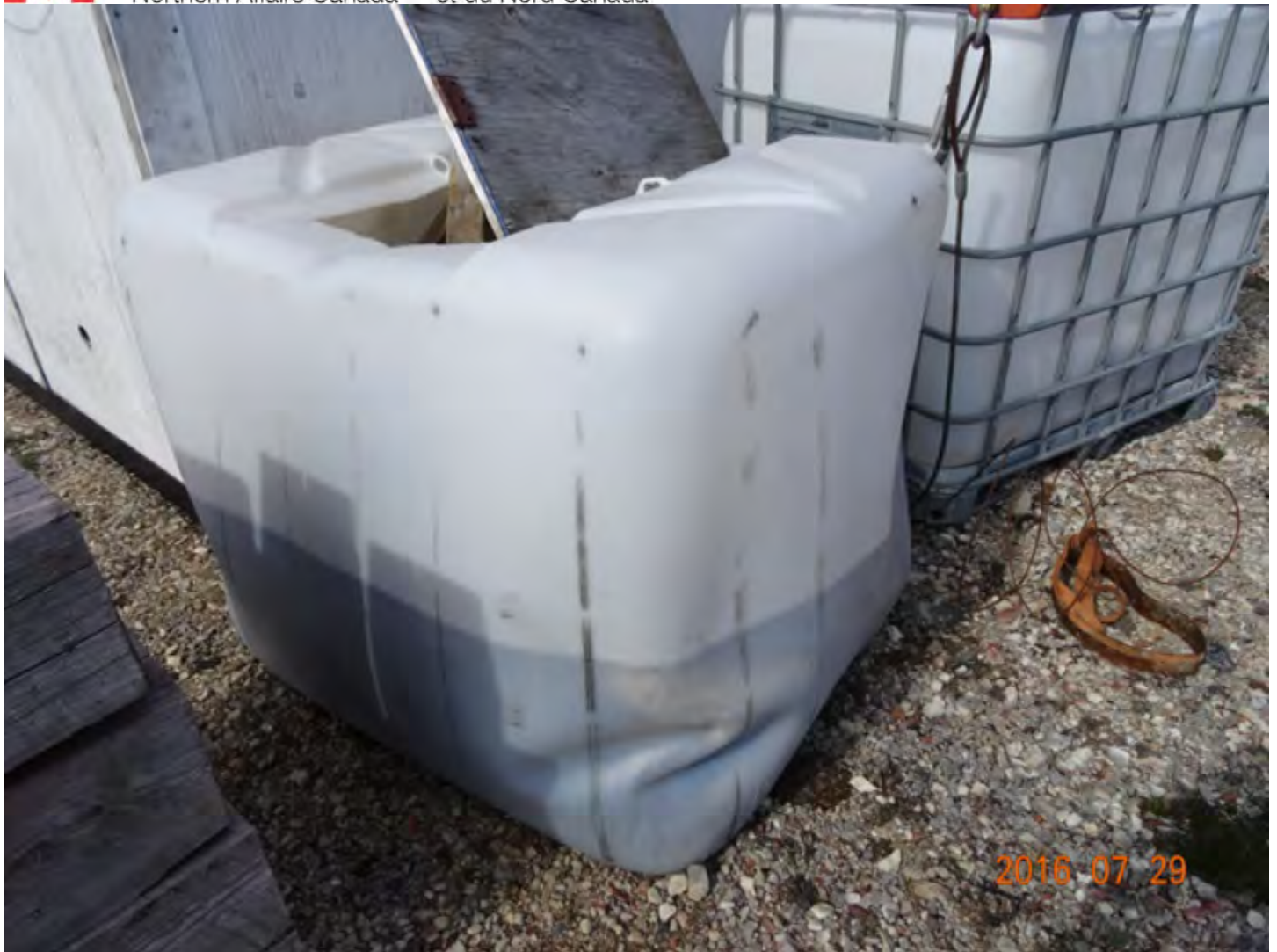
Figure 25 Unknown liquid waste at the driller's lay down at Tuktu Camp