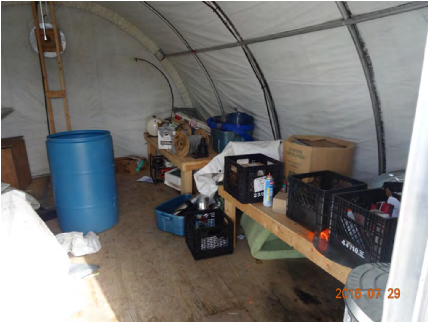
Figure 20 misc. supplies abandoned at the tuktu camp