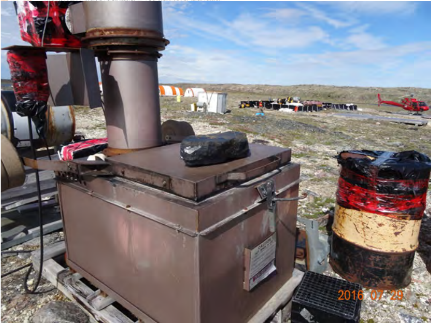
Figure 3 Incinerator . Barrels of ask and other waste materials