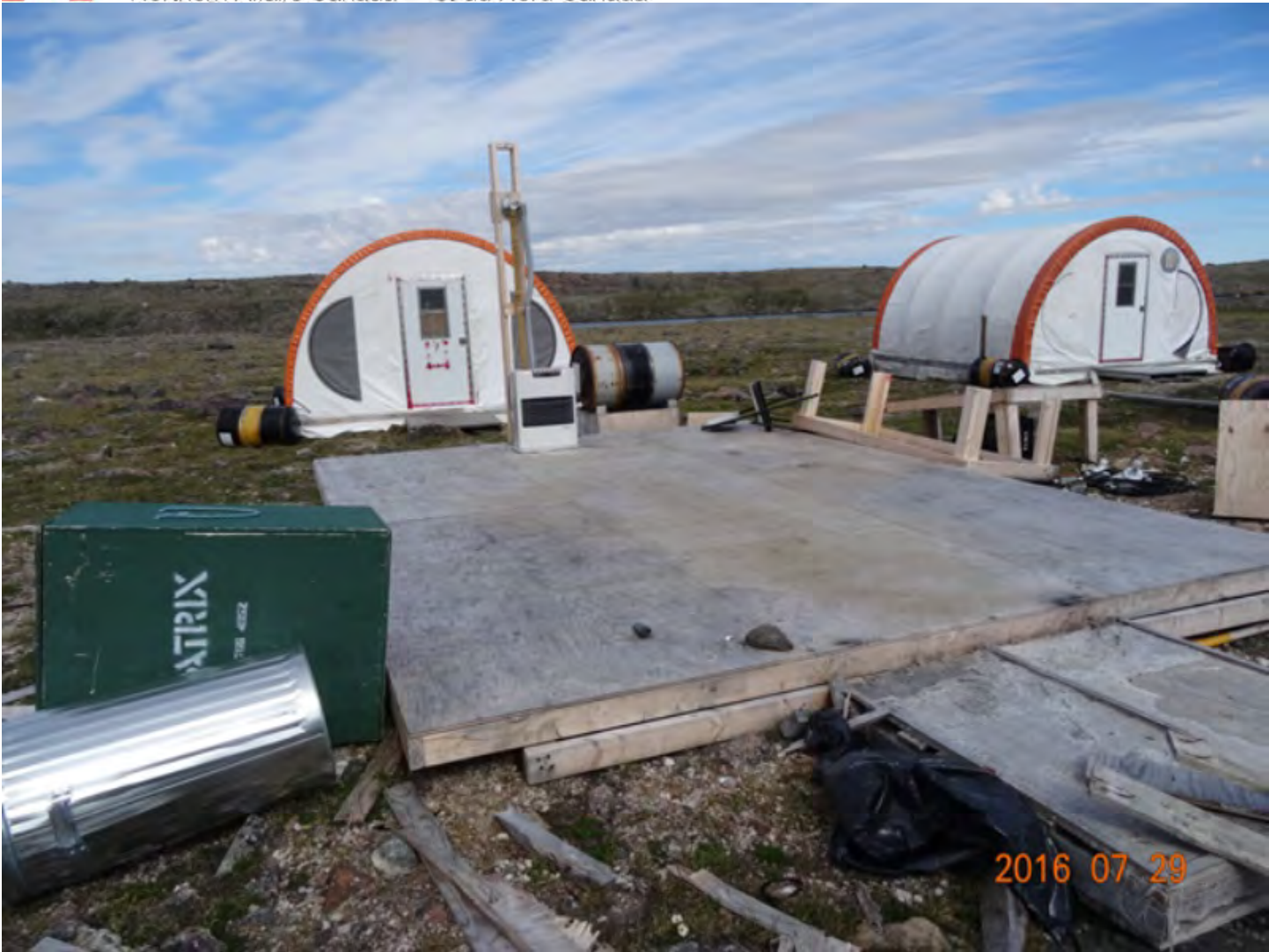
Figure 33 Tent platform.. unknown where the tent is located