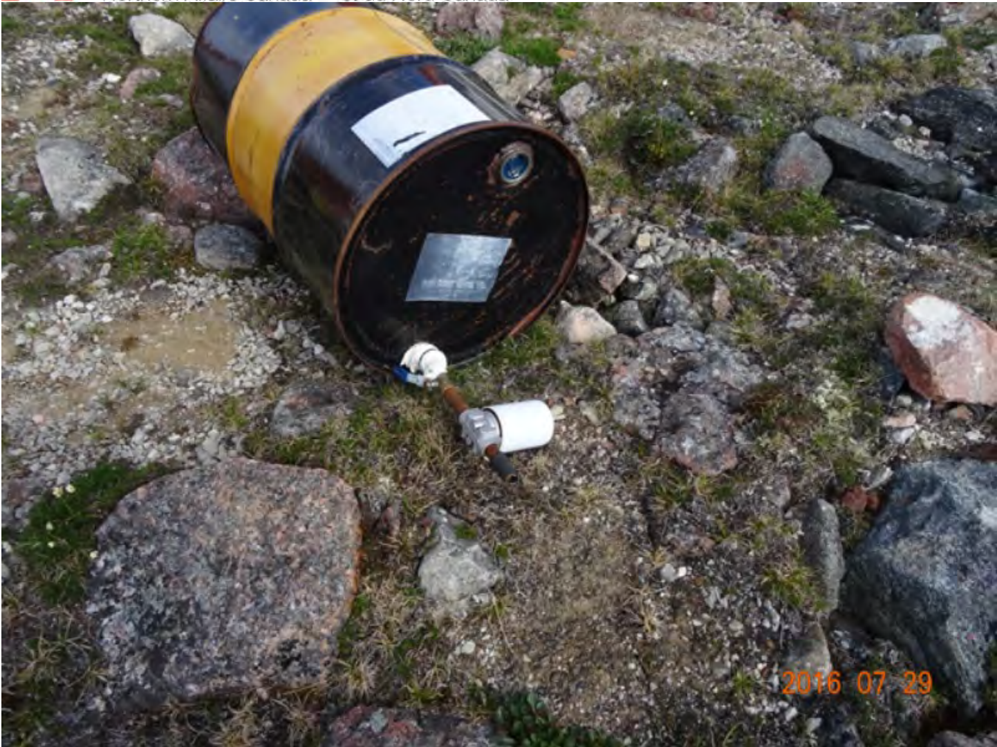
Figure 29 Empty 45 gallon drum from stand