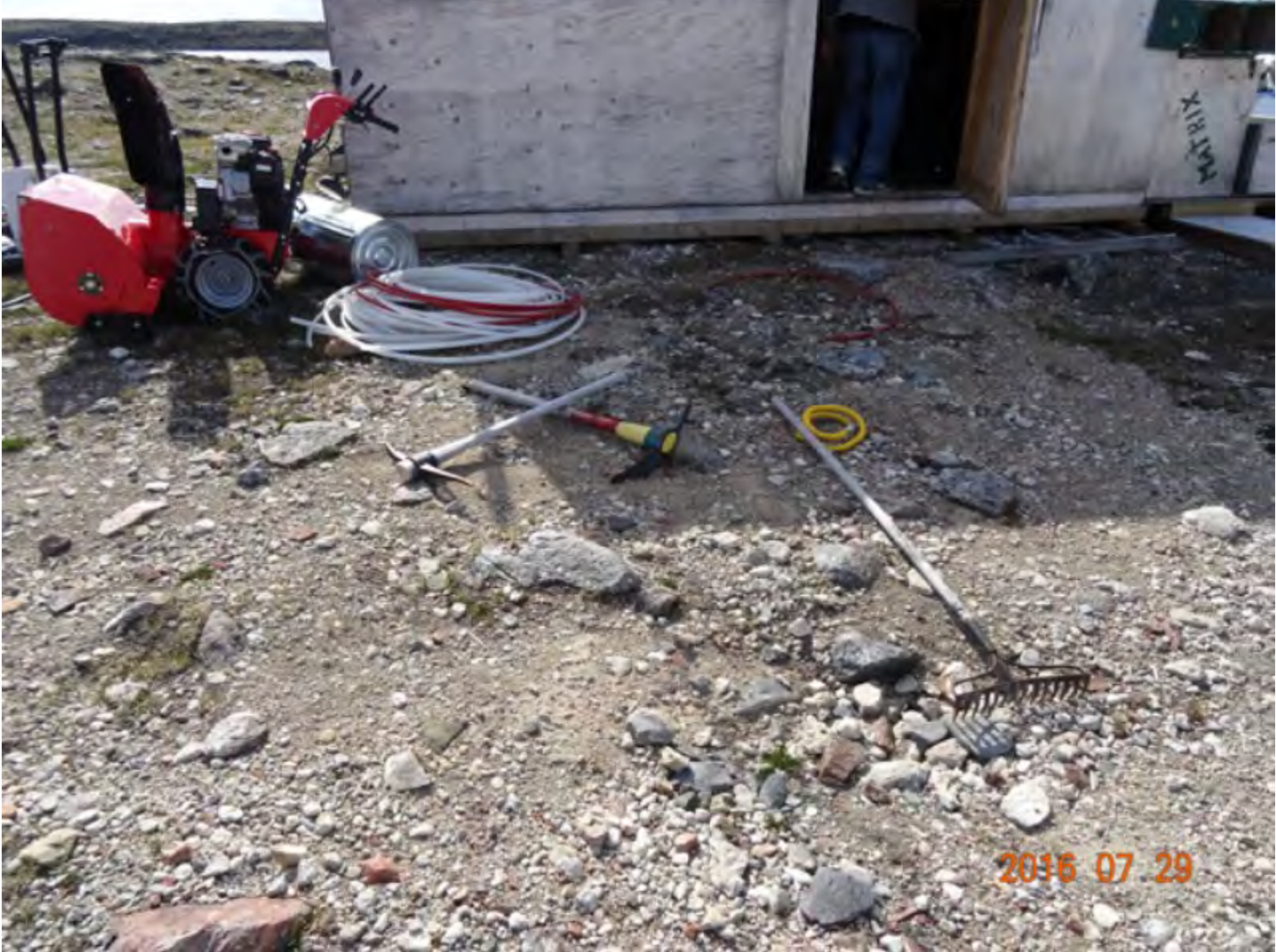
Figure 9 Hand tools and equipment outside storage shed on site