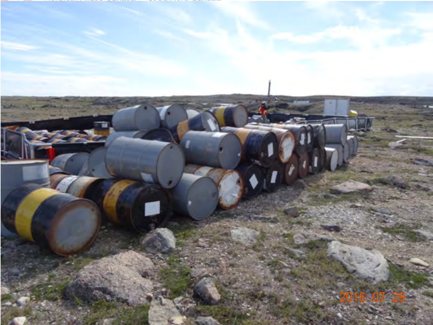
Figure 7 Unsecured drums laying outside secondary containment