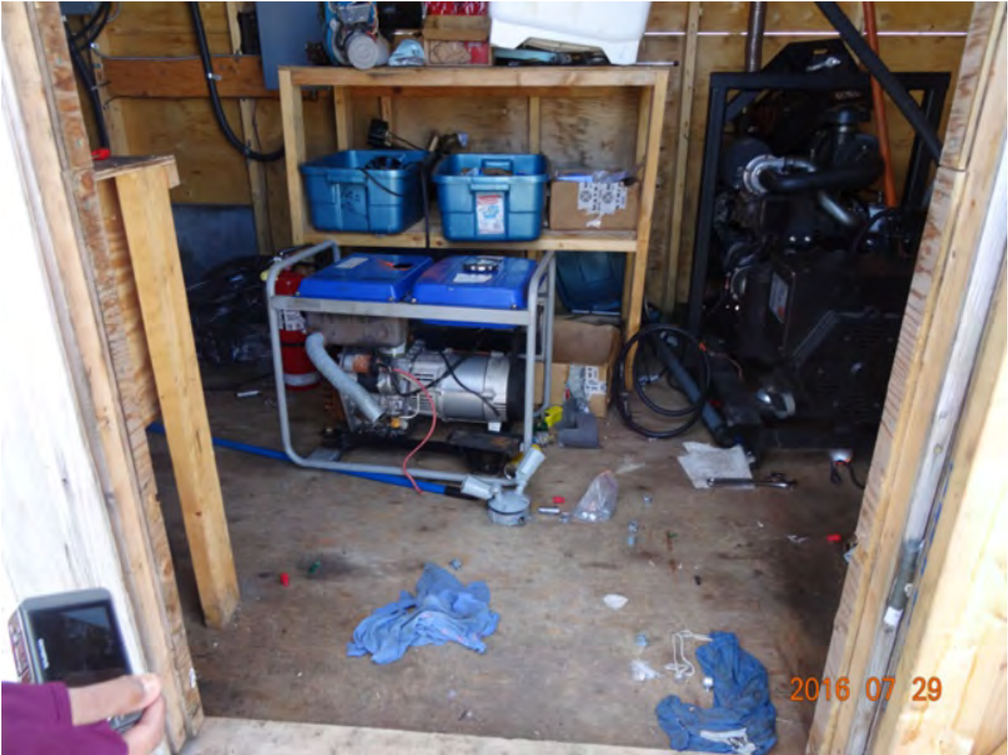
Figure 10 Gen set on site - tank has fuel