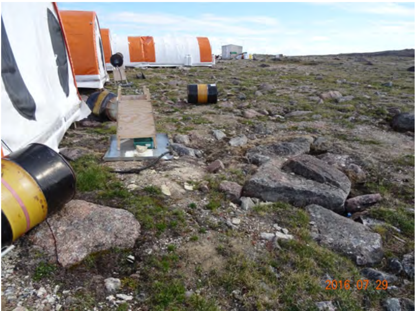
Figure 28 45 gallon drums have come off wooden stands and leaked into the ground behind the tents. Hydrocarbon staining very obvious