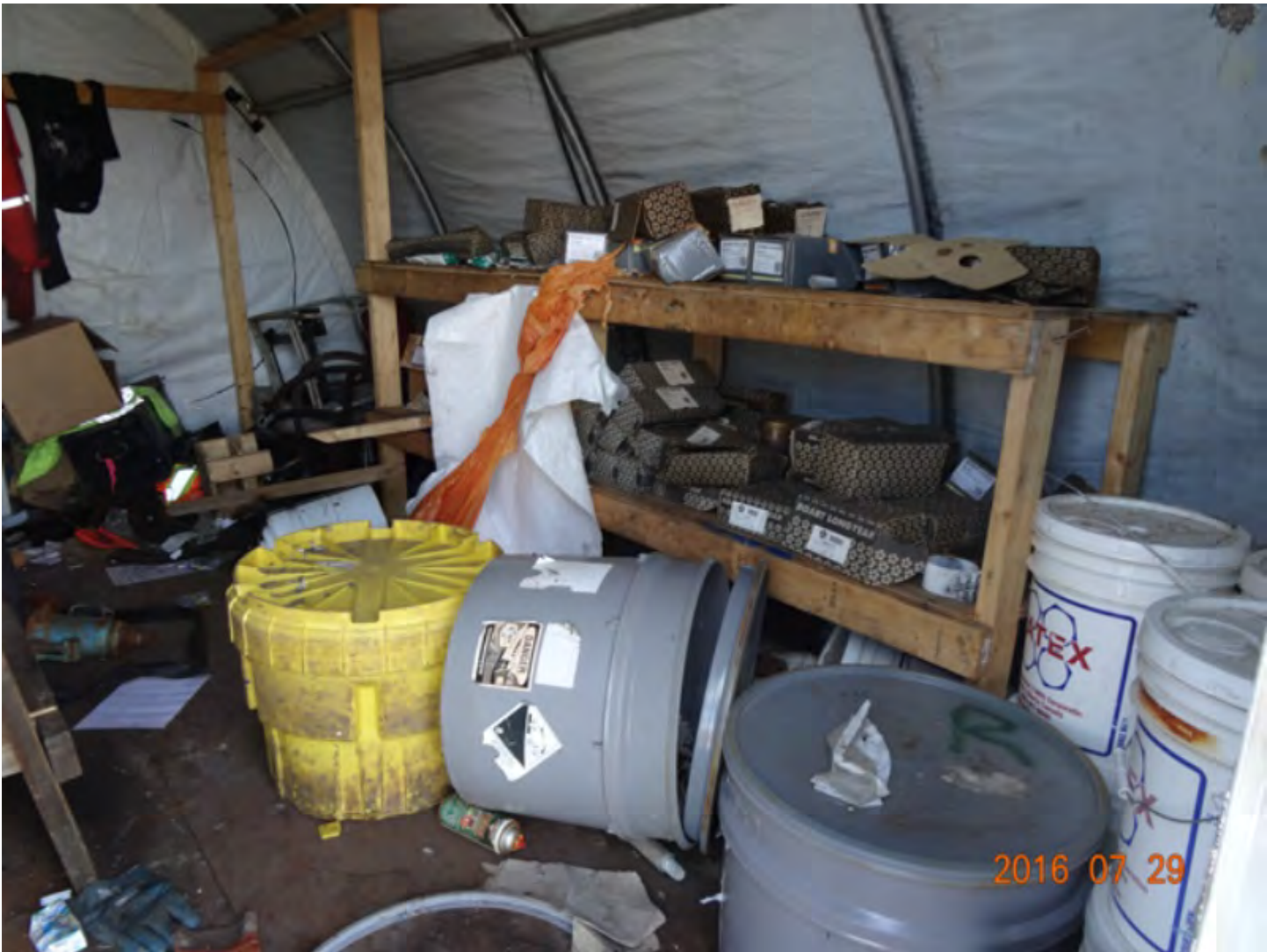
Figure 30 Waste oil, drilling lubricants and batteries in shipping containers in storage shed at Tuktu Camp