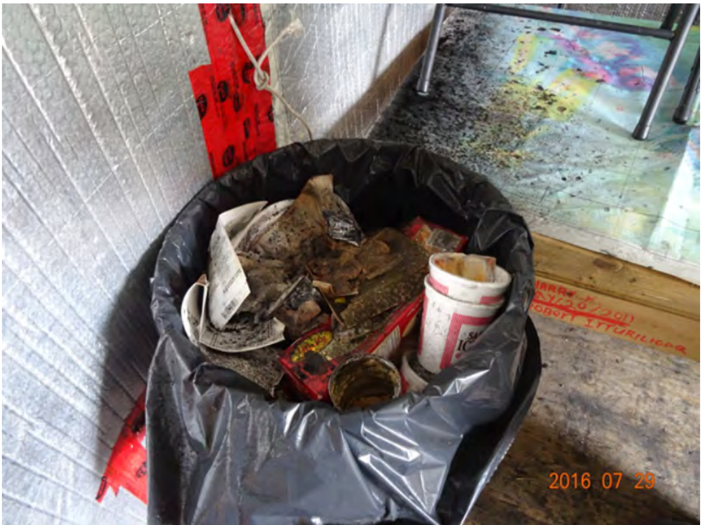
Figure 22 Garbage left on site in the cook tent at Tuktu Camp site