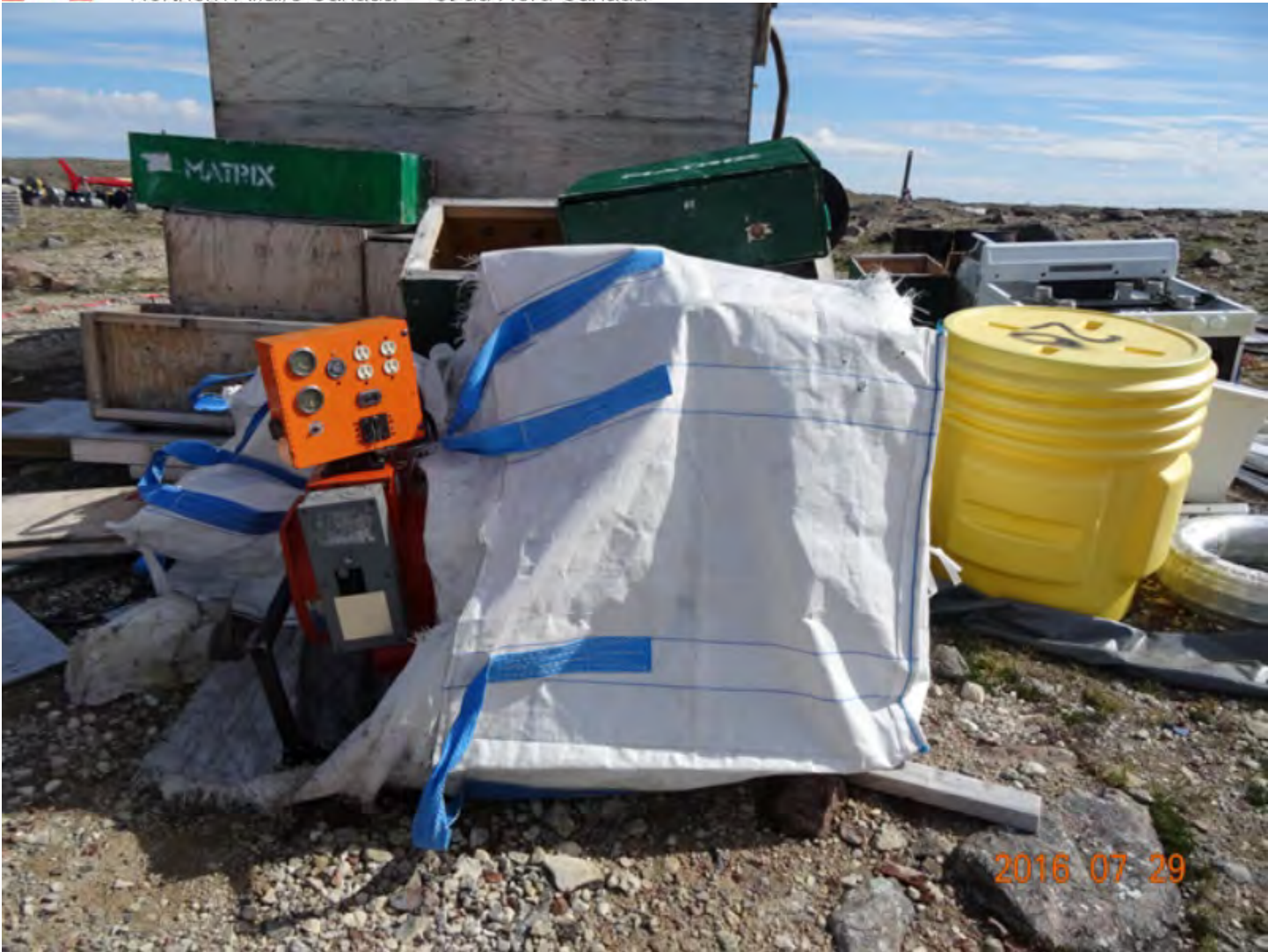
Figure 11 misc equipment and gen set for drillers rig behind main storage shed