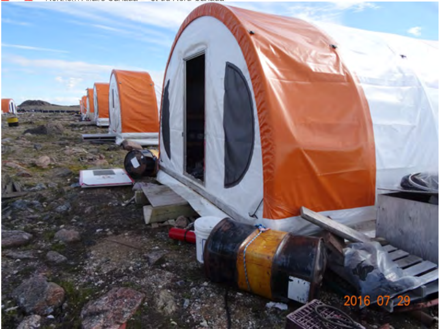
Figure 27 Main camp Tuktuk Camp.. Doors to weather haven have blown open and torn off.