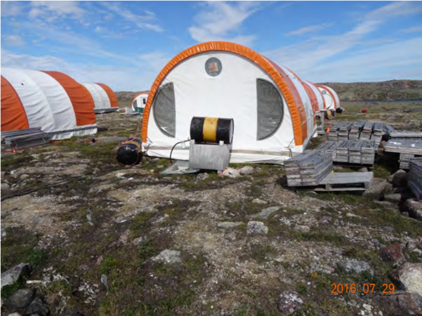
Figure 8 45 gallon drum of heating fuel unsecured on a wooden stand behind tent