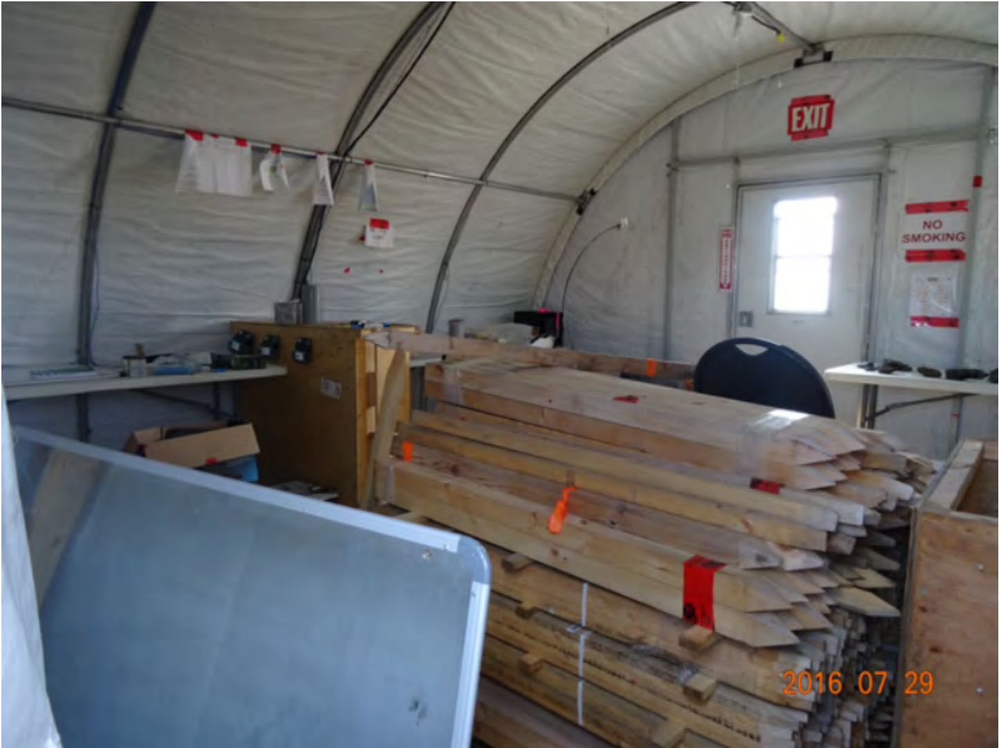
Figure 16 Misc equipment and supplies stored in weather haven tent at tuktu camp