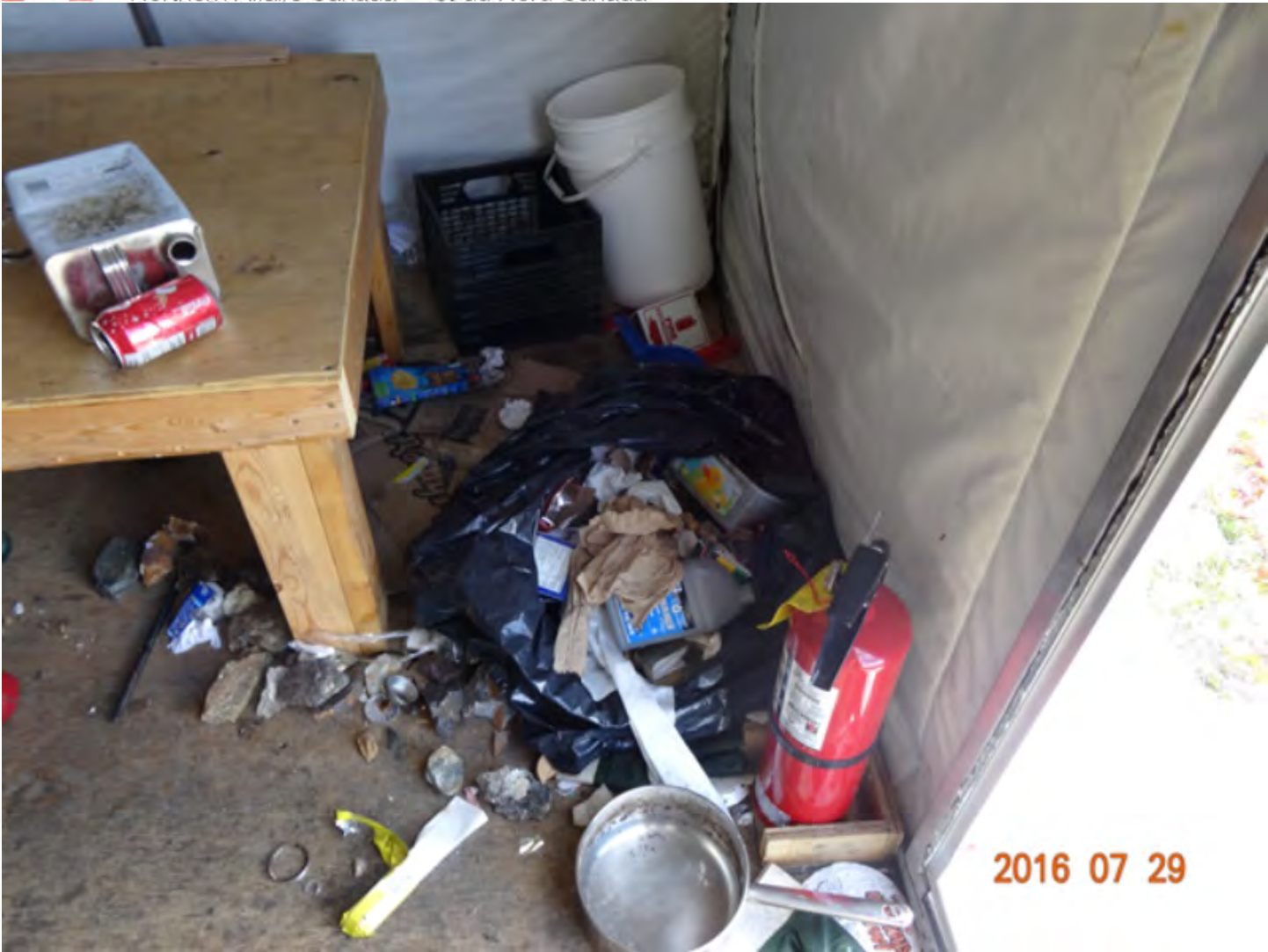
Figure 23 Bags of garbage left behind in the weather haven tents at the Tuktu Camp