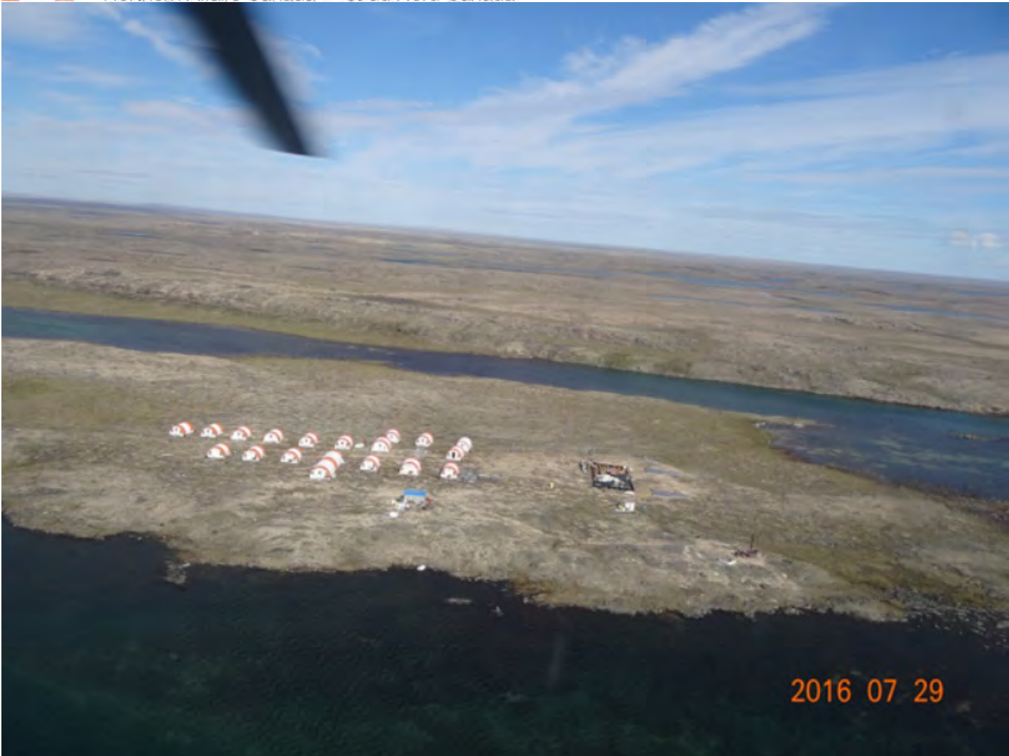
Figure 1 Over view of camp