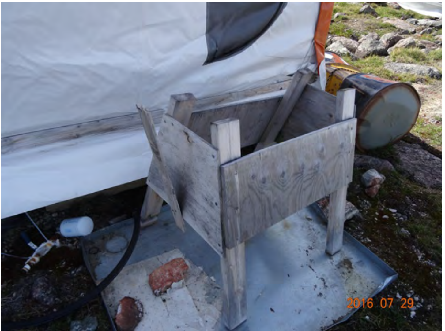
Figure 14 Broken wooden stand