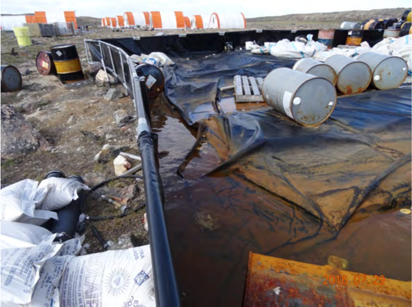
Figure 5 Secondary Containment with water and waste fuel