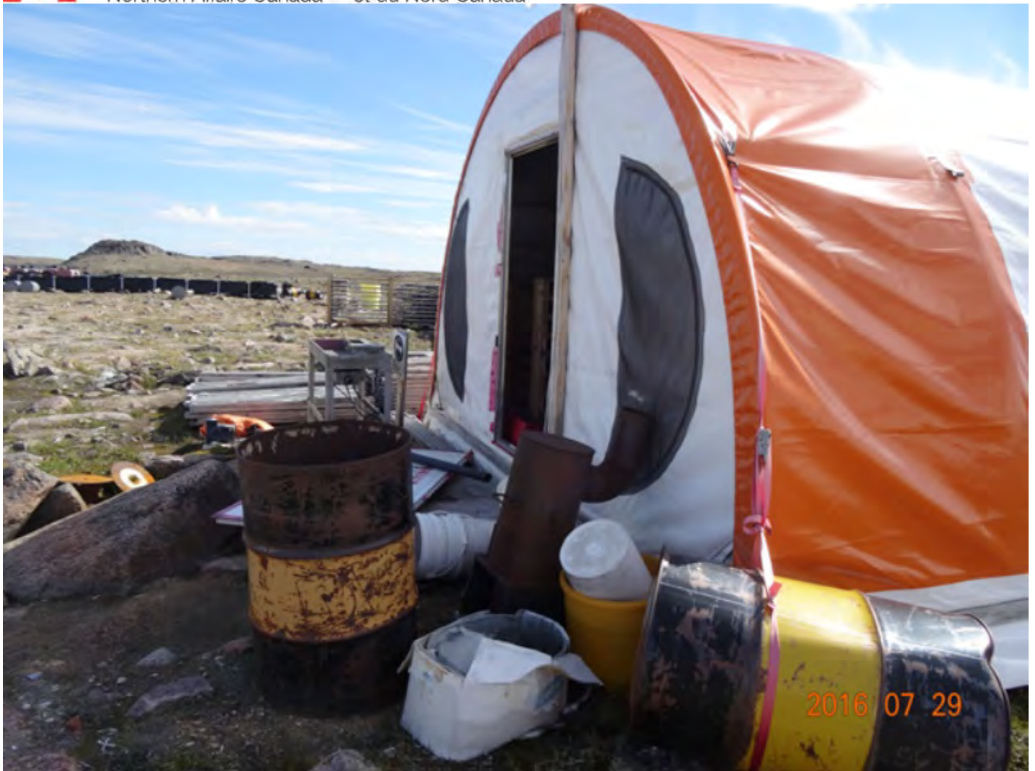
Figure 13 waste materials and broken doors at tents at the Tuktu site