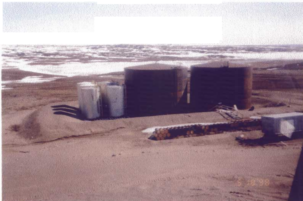
Photo 4 Ulu Project Camp3 Fuel tank farm looking from the west. Two 350,000 usg tanks and six 14,000 usg tanks to the left Off loading apron in foreground with fuel drum storage.