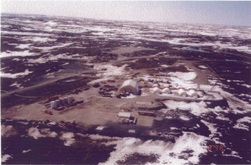
Photo 1 Ulu Project Camp looking from the northeast. Laydown area in foreground, fuel tank farm on left, underground surface sump - middle left, weatherhaven camp and ore storage pad (center above camp).