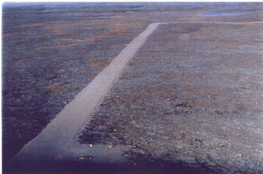
Photo 5 Ulu Project Air Strip; looking north. The Ulu Camp is accessed via the road that takes off from the north end of the airstrip (camp not in view).