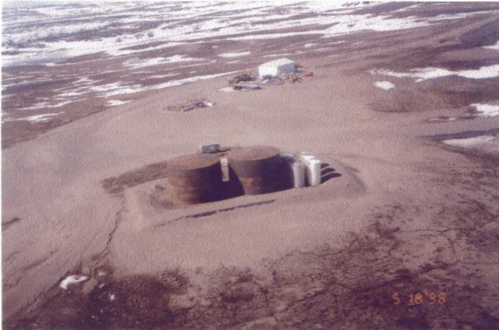
Photo 3 Ulu Project Camp 3 at Reno Lake looking from the east. Fuel tank farm in foreground. Steel clad shop and equipment storage above. Road accesses to Ulu Camp on right, explosives magazine above right.