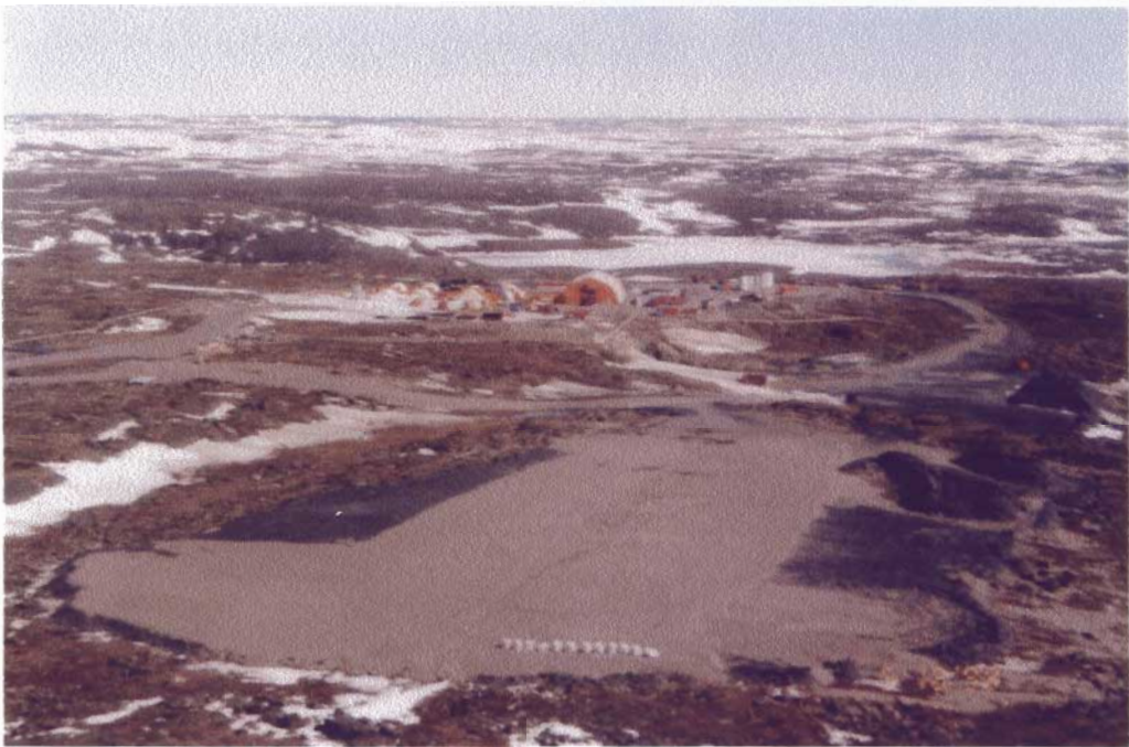
Photo 2 Ulu Project Camp looking from the south. Incomplete ore storage pad in foreground, weatherhaven shop and camp in centre with Ulu Lake in the background.