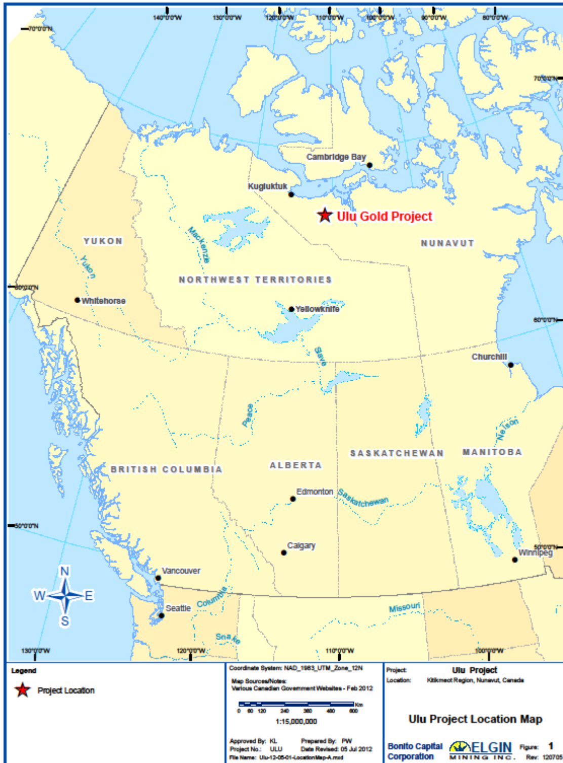
Figure 1: Ulu Project Location Map