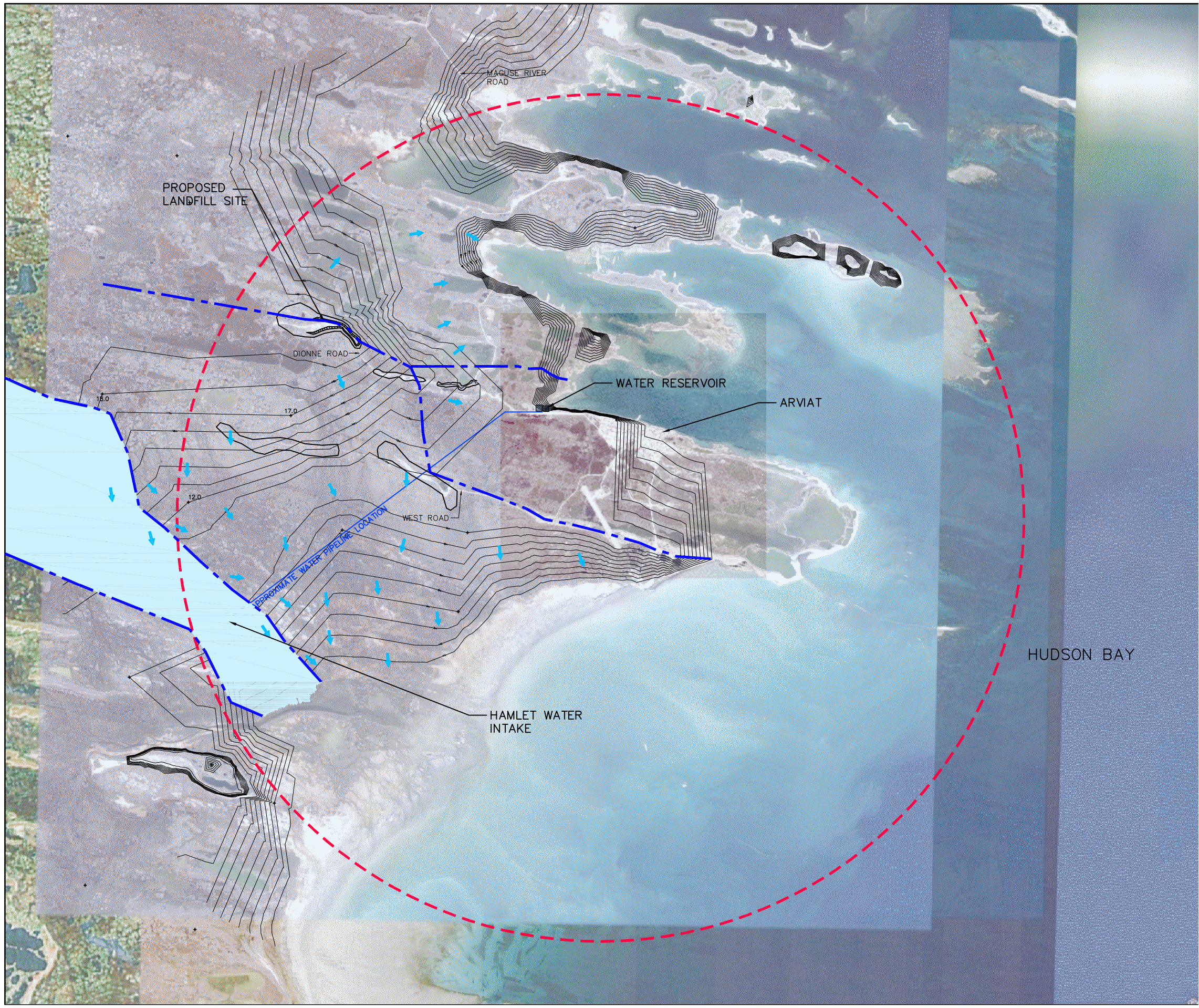
FIGURE 3 HAMLET OF ARVIAT HAMLET OF ARVIAT, NUNAVUT WATER LICENCE SUBMISSION