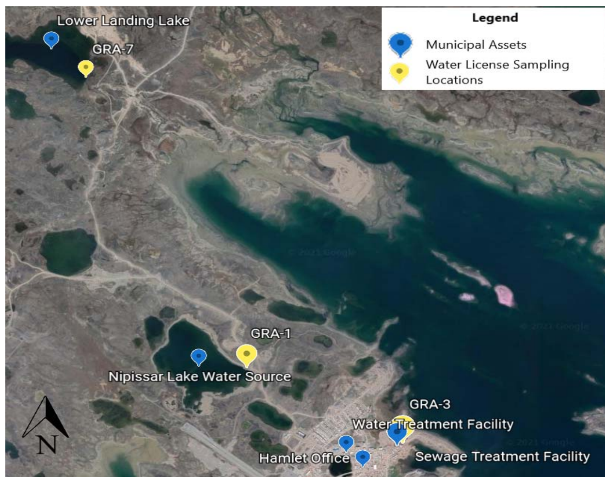
Figure 1 Rankin Inlet Water License Sampling Locations

The monitoring program included in the water license includes specific requirements regarding sampling locations, sampling frequency and parameters to be analyzed. These are provided in Table 1 and Table 2. Monitoring locations are shown in Figure 1.