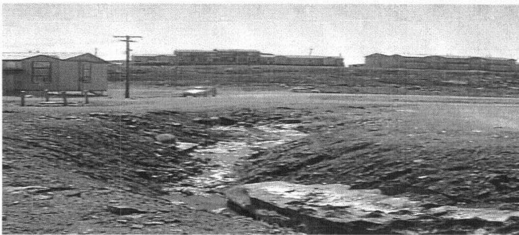
figure 2. Drainage ditch; July 5, 2000.