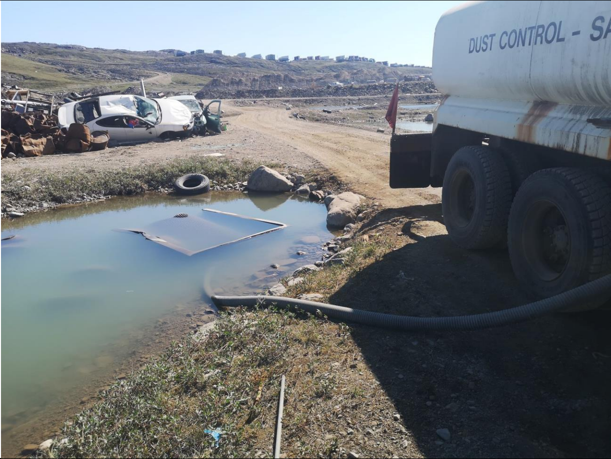
Description: Unauthorized usage of water.