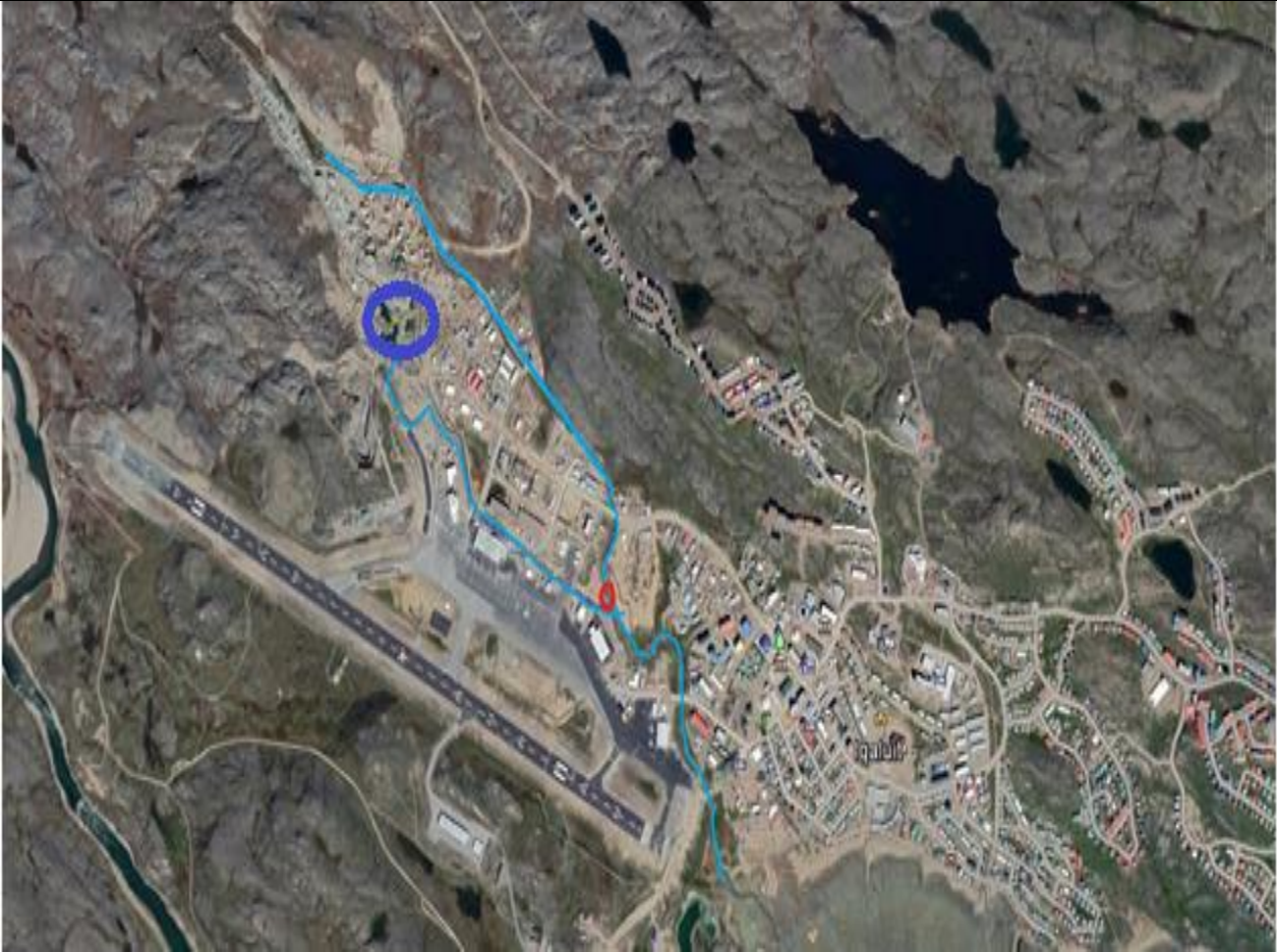
Description: Carney Creek in Blue and Deposit of waste in the red circle.