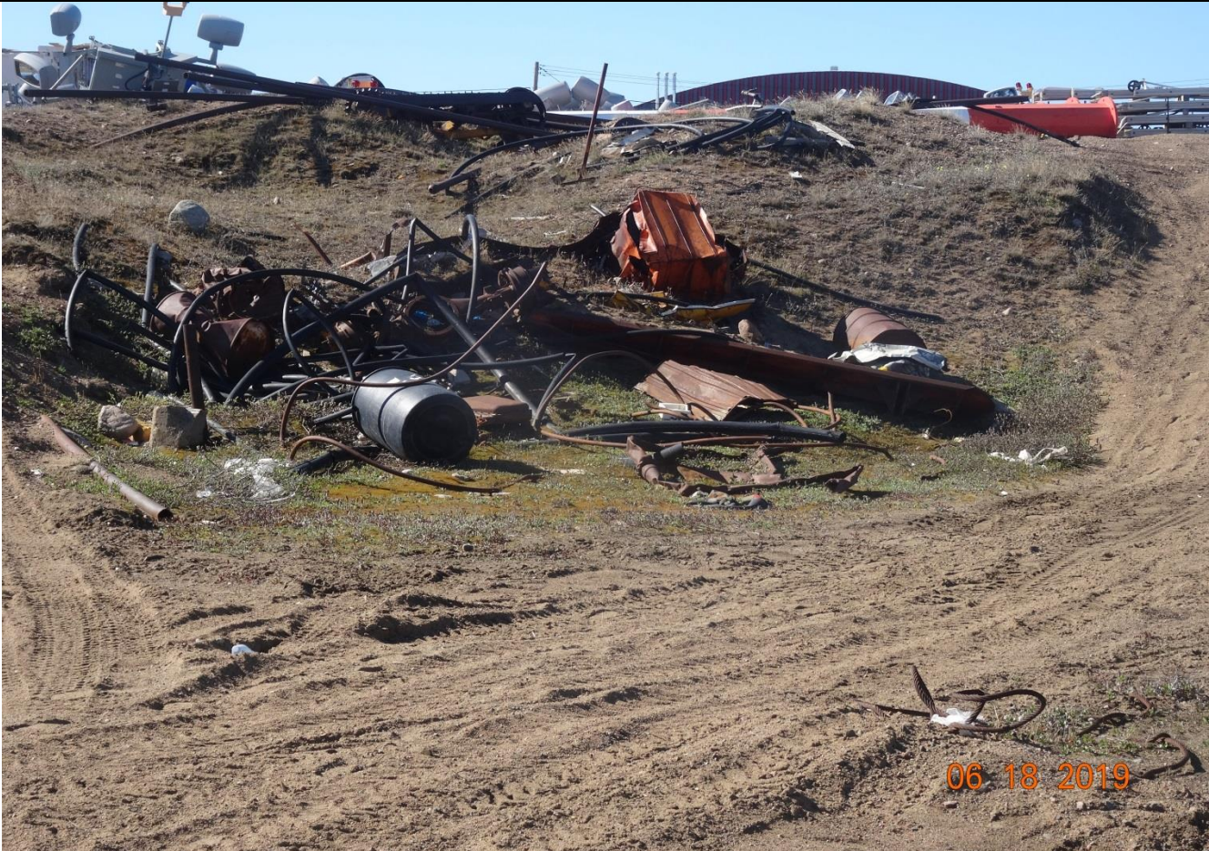
Description: Deposit of waste in the red circle of photo #1.