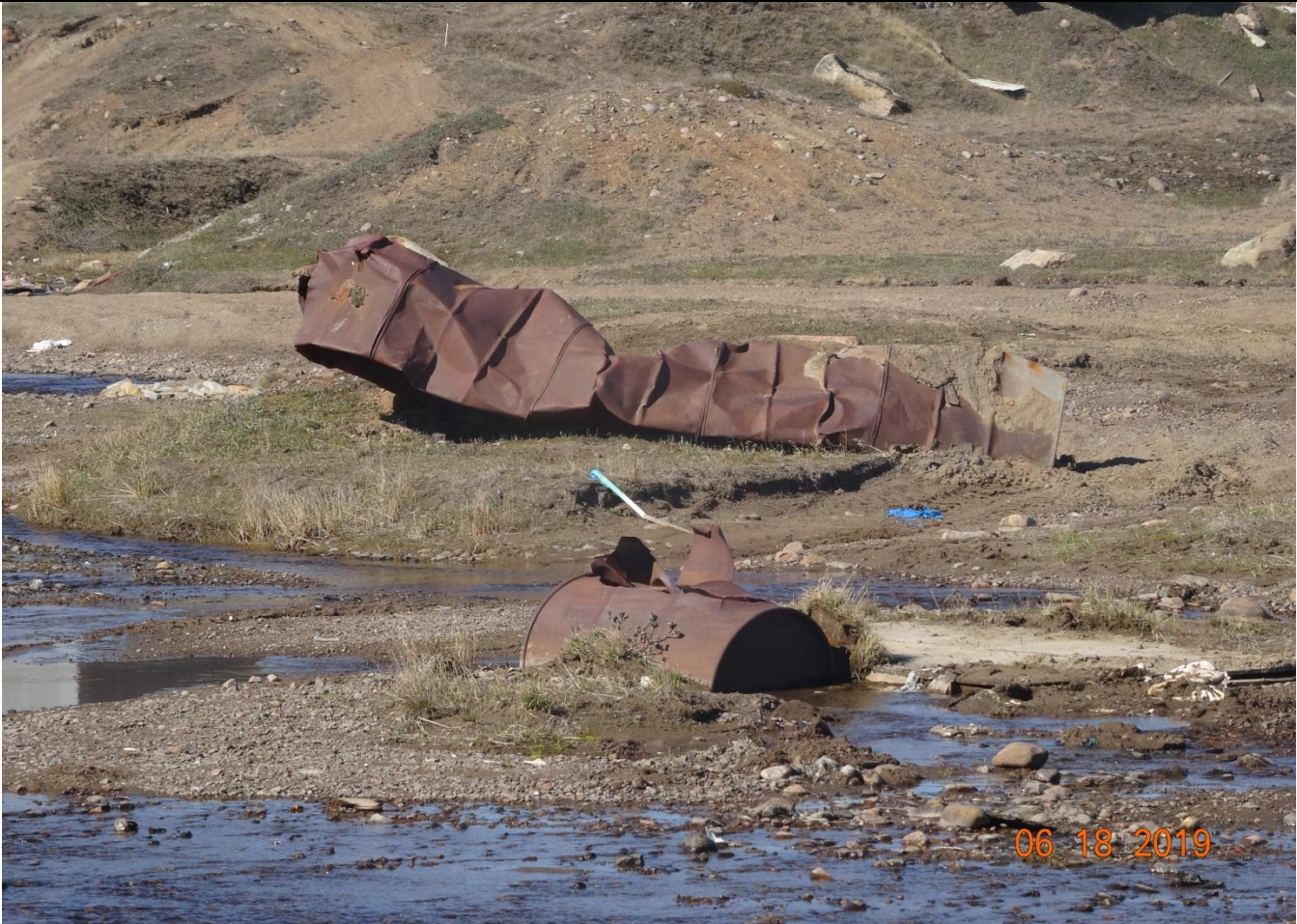
Description: Waste in Carney Creek