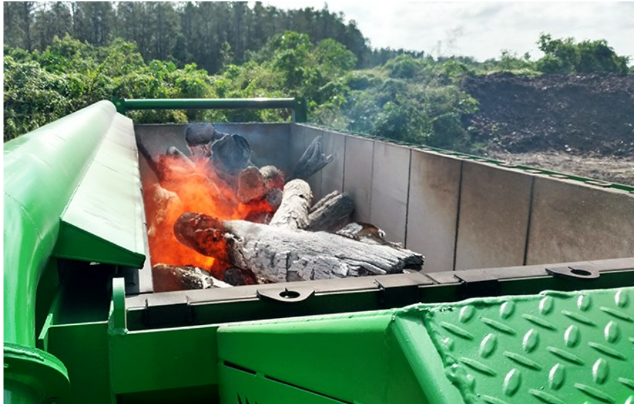
S-327 in Operation