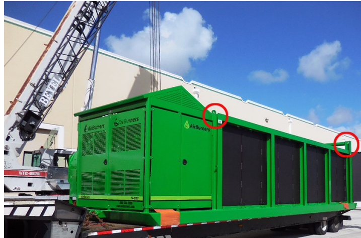
S-327 Series Lifting Points

There are four designated lifting pad eyes for lifting the S-220 units by crane, two on each side. Only lift by attaching cables to these four pad eyes. Their locations are marked with yellow lifting point labels with up-arrows (One side shown here)