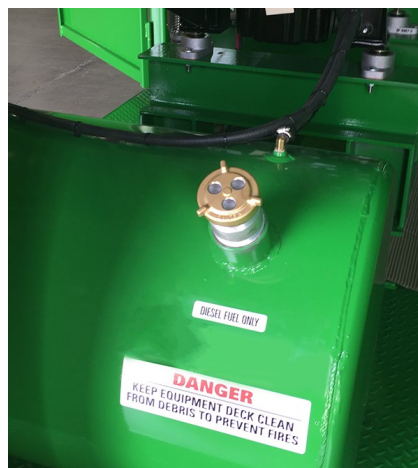
Fuel Tank - Open Side Door