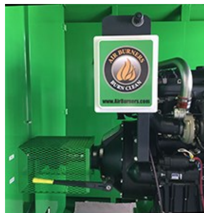
Control Area - Open Left Front Door