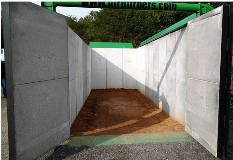
S-327 Rear Doors (Open)