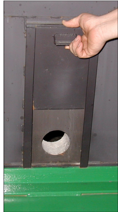
Access door for lighting

If you are using Diesel fuel as a starter, let the fire burn until you begin to see wisps of white smoke replacing the wisps of black smoke from the Diesel fuel or, if you are using propane torches, wait until the fire has strengthened and flames are reaching the top of the firebox. Then engage the air at 1,400 RPM. As the fire burns stronger, increase the air (approximately 200 RPM every 15 minutes) up to maximum.