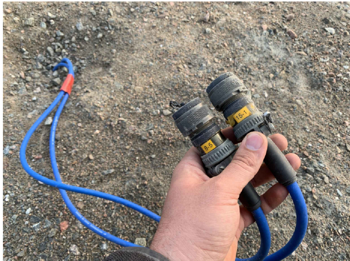
TYPICAL EXISTING TEMPERATURE SENSOR STRING