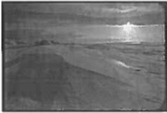
Page 7 - March 12, 2018