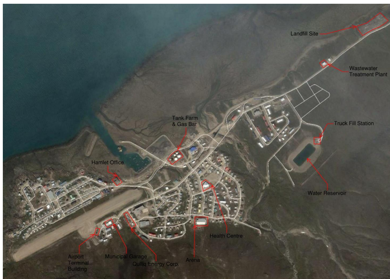
Figure 1: Location of Various Facilities, Pangnirtung, NU

The following paragraphs describe the facilities and/or activities which might result in a spill event or an emergency situation that might impair the environmental and/or human health.