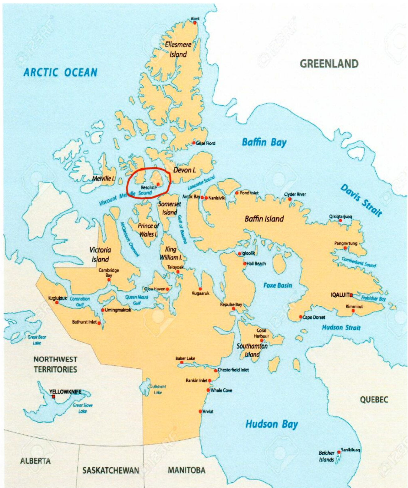
Fig. 1: Location of the Municipality of Resolute Bay