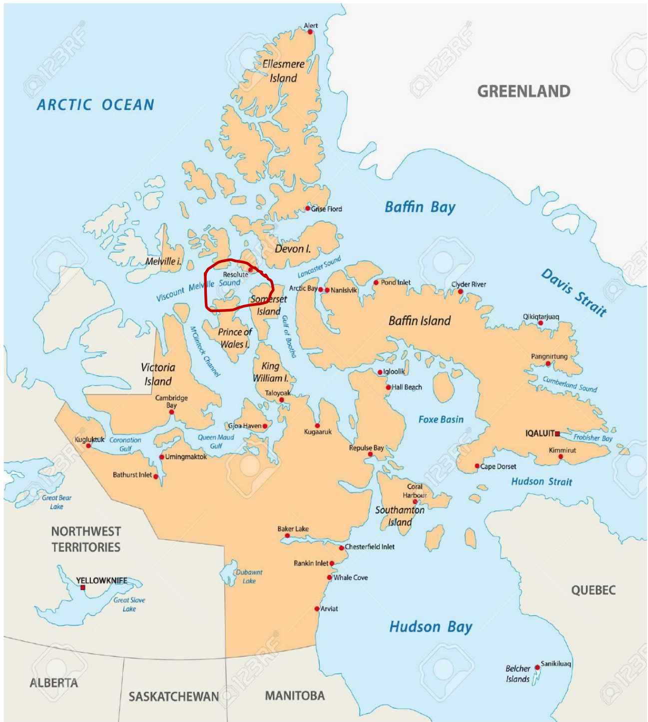
Fig.1: Location Map of the municipality of Resolute Bay in Nunavut