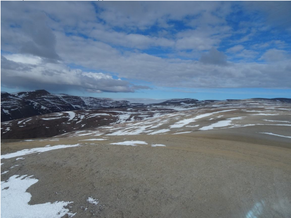
Figure 2 Camp Location